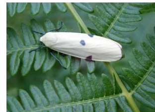
Four Spotted Footman