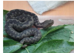
Nose Horned Viper