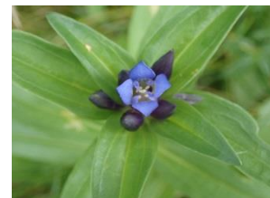
Cross Flowered Gentian