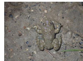
Yellow Bellied Toad