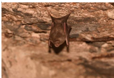
Lesser Horseshoe Bat