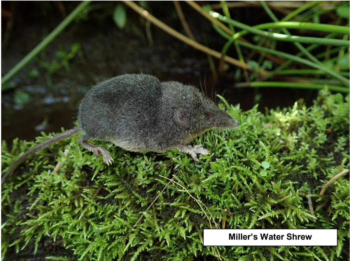
Miller's Water Shrew

Two of us headed back down the valley to do some bat trapping, we set a mist net over a small river and waited, as the light faded we spotted a few moths including buff arches and scorched carpet . A few bats were present on the detector, passing serotine and noctule and a few pipistrelles but they kept away from the net but we did eventually catch an Alcathoe's bat . Later in the evening I heard my name being called and saw two lights from our base yet there was only two of us, I headed over to investigate and there was a man with a large gun. He clearly spoke neither English nor Dutch and although one of the two Bosnian words I knew was Bat he did not understand what we were doing. We rang on of our local Bosnian contacts and explained what was happening, we handed him the phone but he clearly did not know what was going on and looked at it in wonder, we turned it to speaker mode and he was clearly surprised that a voice was speaking to him, a discussion over the phone was had and his fear that we were migrants was dispelled and he was clear what we were doing but perhaps not why. We declined an invite to visit his farmhouse to drink some moonshine spirit and he left us in peace. We did not catch anything else and headed back spotting a fox on the way.