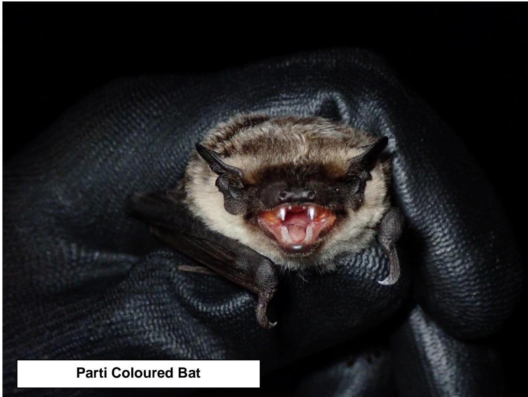
Parti Coloured Bat