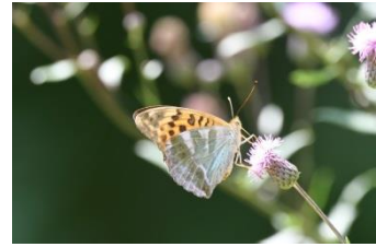
Silver Washed Fritillary

The night trap checks also produced nothing but another team had caught a nosed horned viper in one of the traps and brought it back in a tank for everyone else to see.