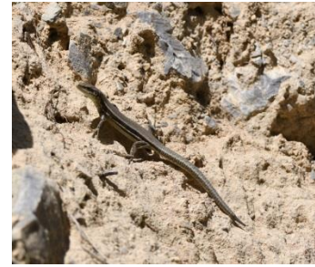
Common Wall Lizard

Pre breakfast trap check produced plenty of yellow necked mice and a couple of wood mice . After breakfast a group of us headed to the other side of the river to explore the grasslands and investigate some barns. Two of the barns held lone lesser horseshoe bats and we saw clouded yellow and scarce swallowtail butterflies. I split from the group and explored another area locating common wall lizards , lesser purple emperor and lots of Jersey tigers . After lunch a group of us headed to an area called Trojan higher up in the hills where traps had already been set prebaited and we set them to catch and explored the area. We saw red squirrel and nutcracker on our wander and in a barn we found a roosting lesser horseshoe bat .