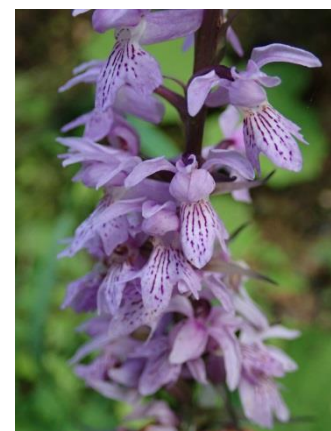
Sack-carrying Marsh orchids

We checked the traps at Trojan mid afternoon and had both common and bank voles with a scarce copper butterfly of note flying about. We stopped to admire the Sack-carrying Marsh orchids along the roadside on the way back but had little else.