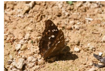
Lesser Purple Emperor

We checked the traps at Trojan before breakfast once again lots of yellow necked mice , and a couple of bank voles and a single common vole and a wood mouse . Some nice cross flowered gentians were in flower in the meadow and I found a couple of wartbiters , on the wander round.