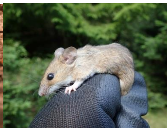
Yellow Necked Mouse