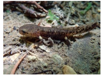
Fire Salamander eft

After dinner we did some bat trapping catching in the area where we met the gun carrying local a few days before, it was uneventful on that count but we did catch a few more bats, 2 leisler's bats , and singles of Alcathoe's , Parti coloured and Geoffroy's bats .