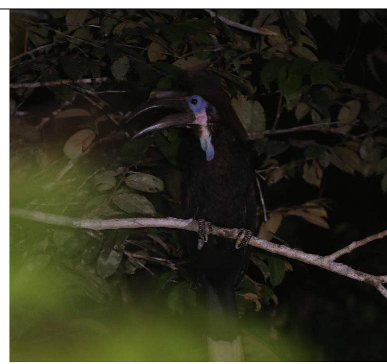
Black- casqued Hornbill