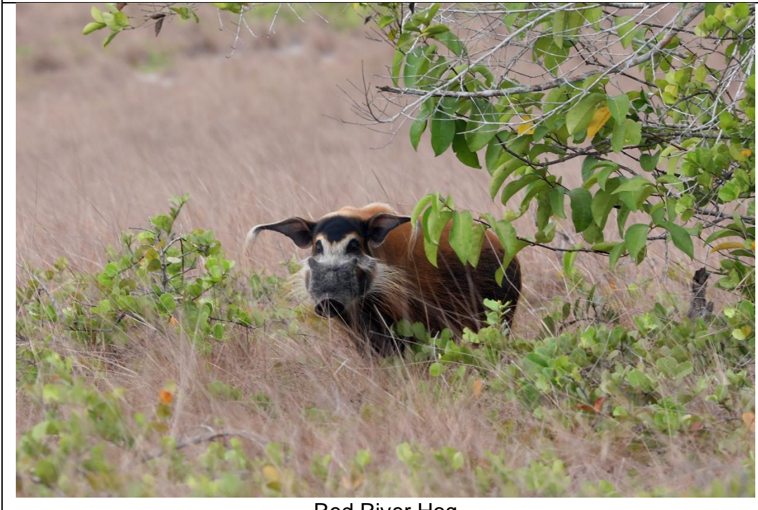
Red River Hog