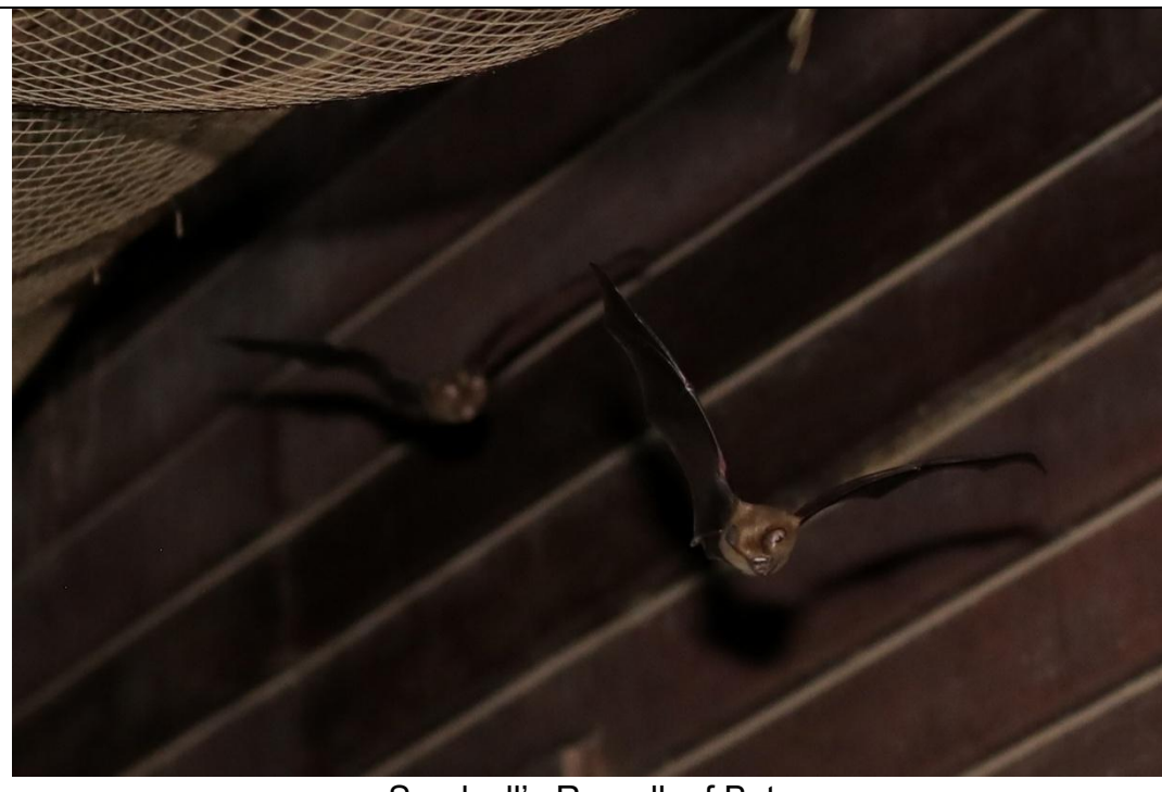
Sundvall's Roundleaf Bat