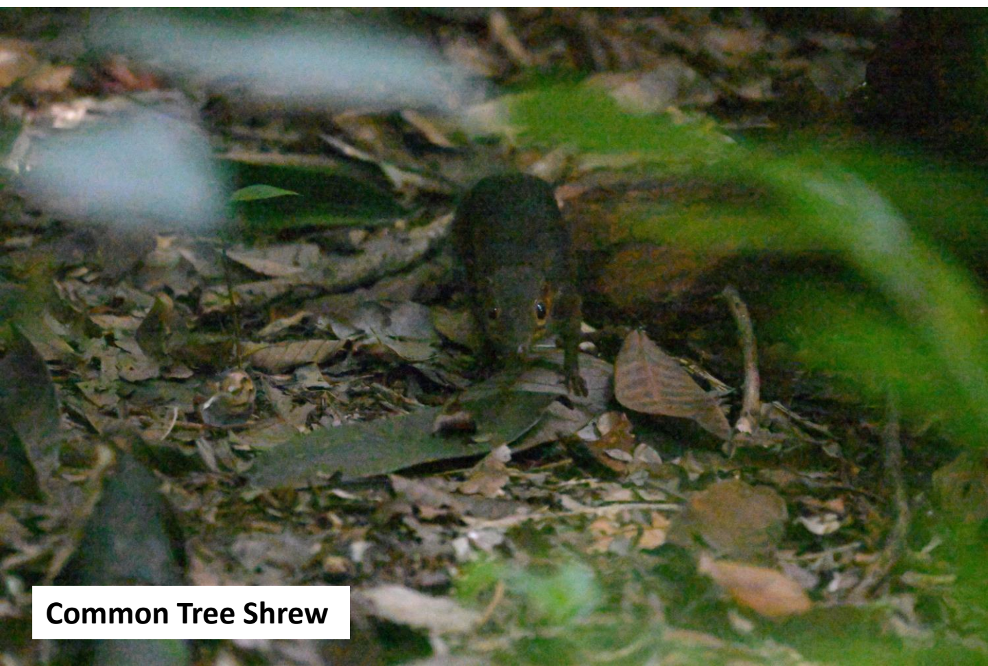
Common Tree Shrew

We headed off for some food before our night walk at Bukit Timah. Here we quickly found some feeding lesser dog faced fruit bats. The small stream held walking catfish, swamp eels, freshwater crabs, forest shrimps and some frogs. We could not find any Colugos but did find an Oriental scops owl some Cave nectar bats and some pipistrelles and a striped bronzeback. With time moving on we headed to Bukit Batok here we found a few brown rats and a few roosting small birds I was getting concerned about seeing Colugos because weather the following day was looking poor so this would be our only chance but one flew right over me and landed in the closest tree and showed well. Ivan also located another one high up in a tree, it was now very late so we called it a night.