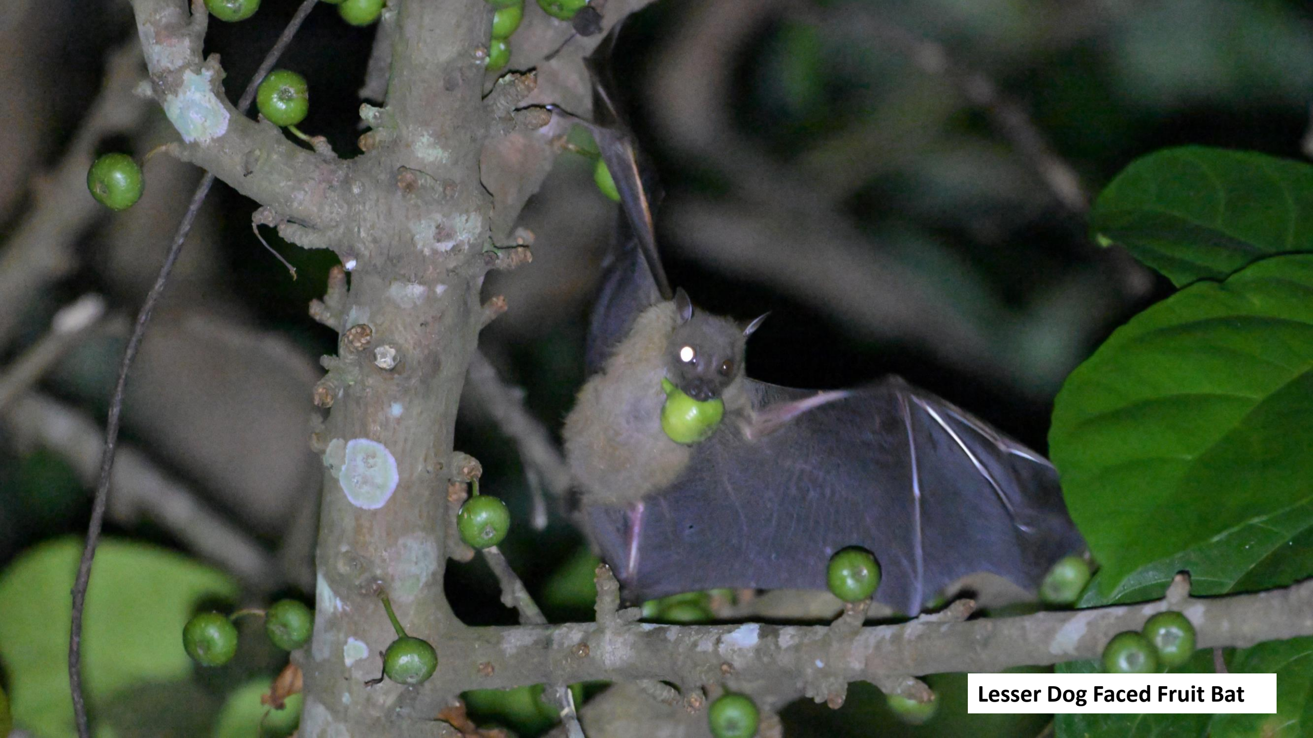
Lesser Dog Faced Fruit Bat