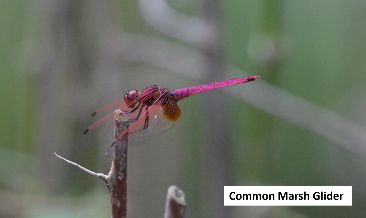
Common Marsh Glider