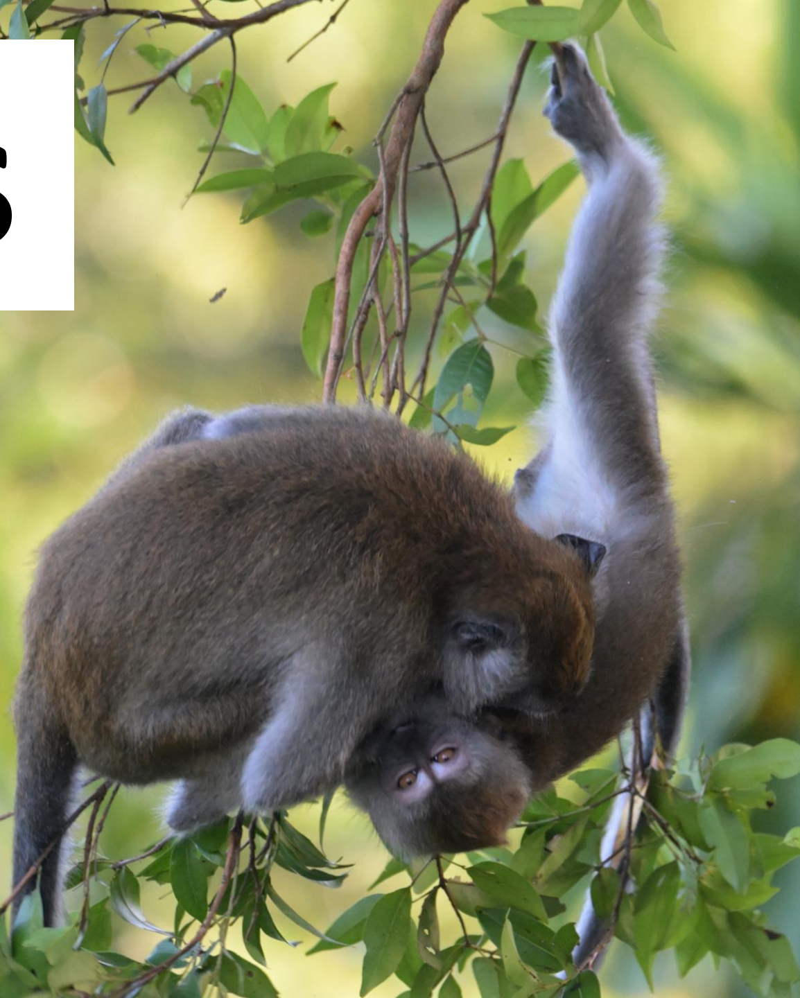
Long Tailed Macaque