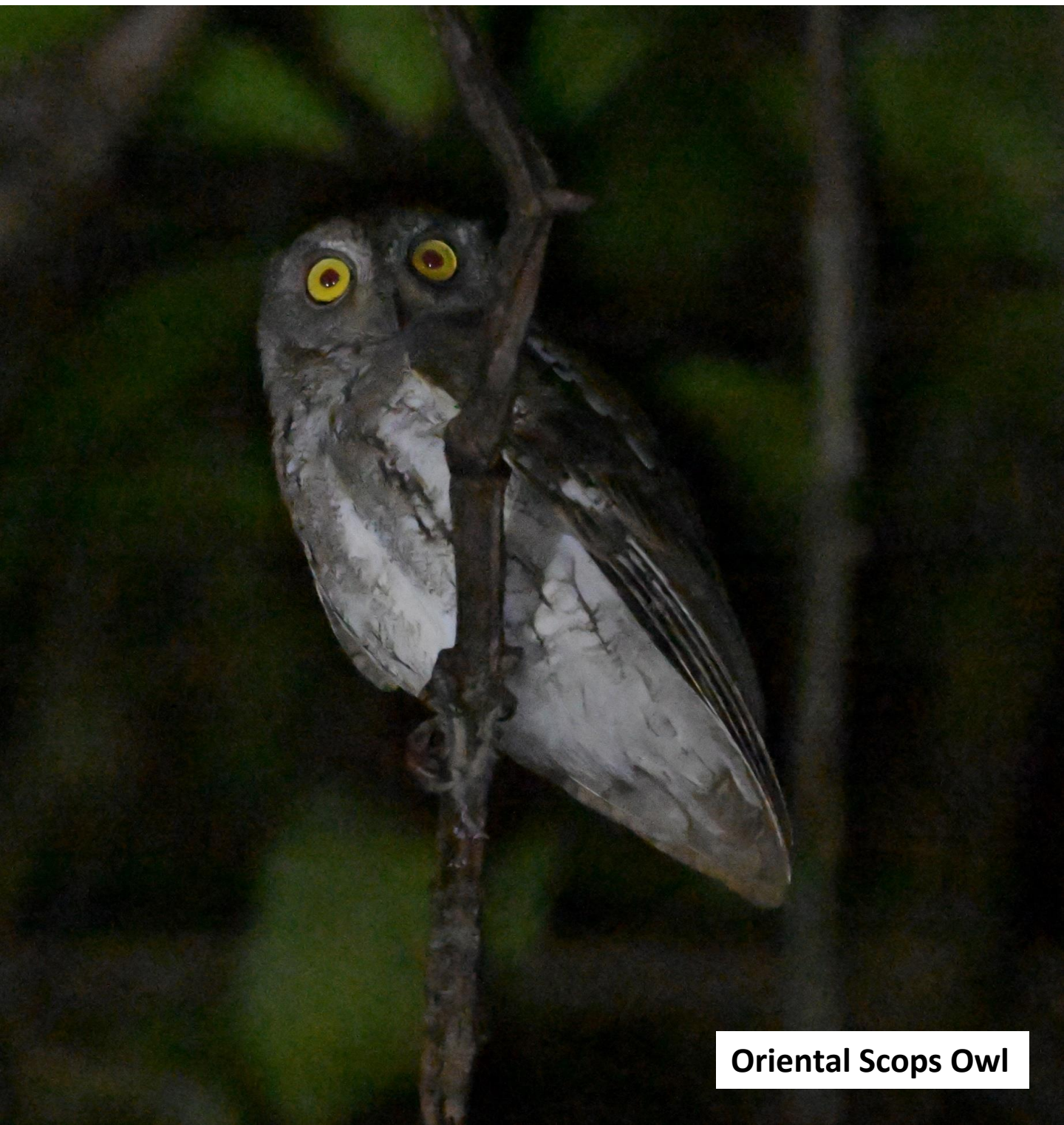
Oriental Scops Owl