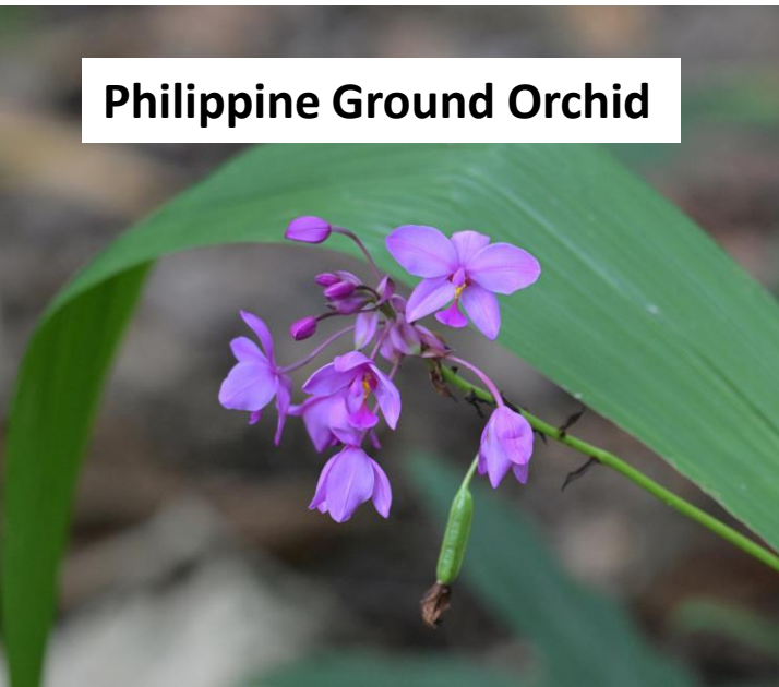
Philippine Ground Orchid