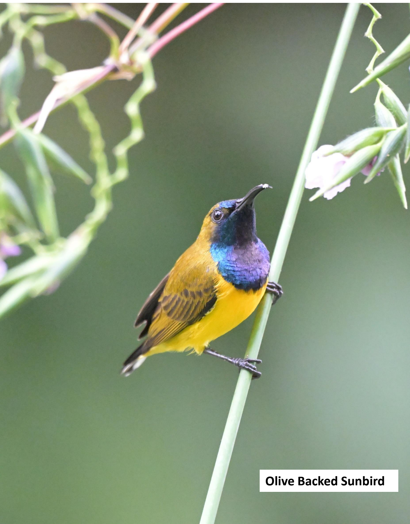
Olive Backed Sunbird