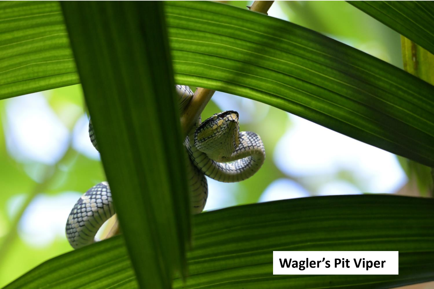
Wagler's Pit Viper