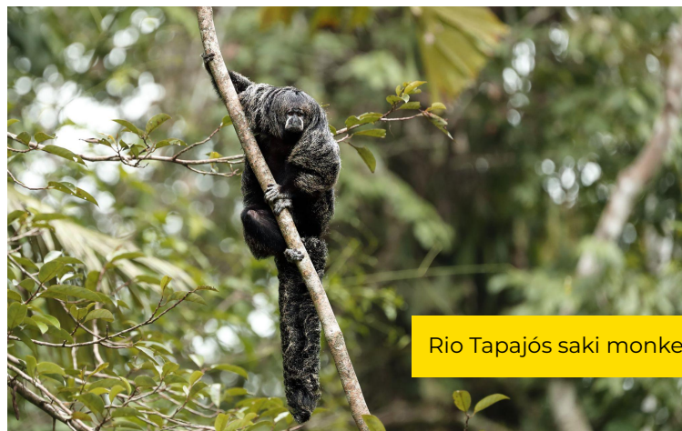
Rio Tapajós saki monkey

Jardim da Amazônia Lodge, in São José do Rio Claro, Mato Grosso, Brazil, is a remarkable eco-lodge within a preserved area of primary Amazon rainforest. Founded in 1997, it emphasizes sustainable practices, featuring farm-to-table dining and natural water sources. This sanctuary is ideal for primate and birdwatching, with 8 monkey species and over 580 bird species, including the rare Rio Tapajós Saki monkey and critically endangered Cone-billed Tanager. The lodge, located in a unique ecotone, offers an opportunity to explore the world-famous Amazon Rainforest.