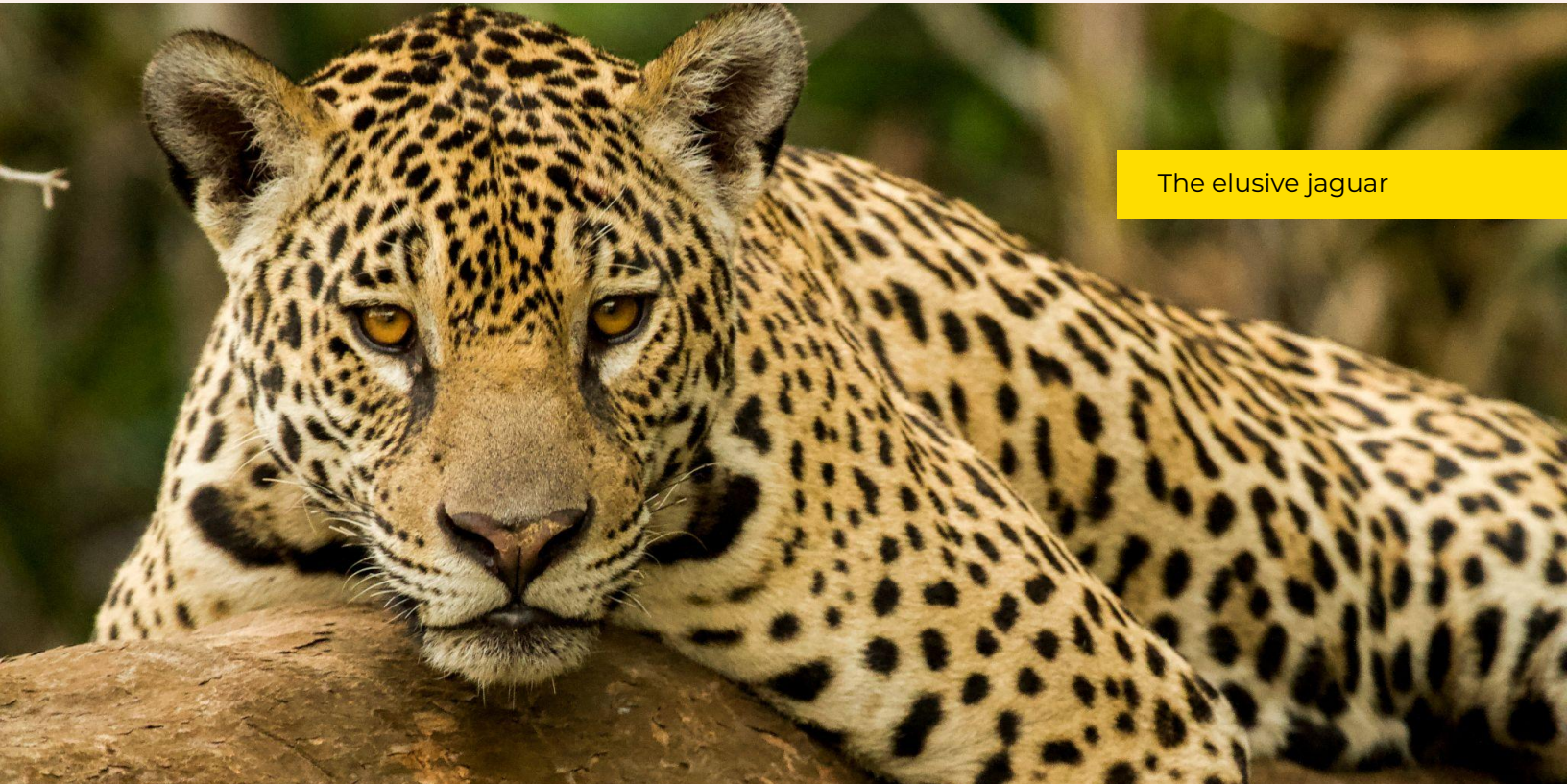
The elusive jaguar