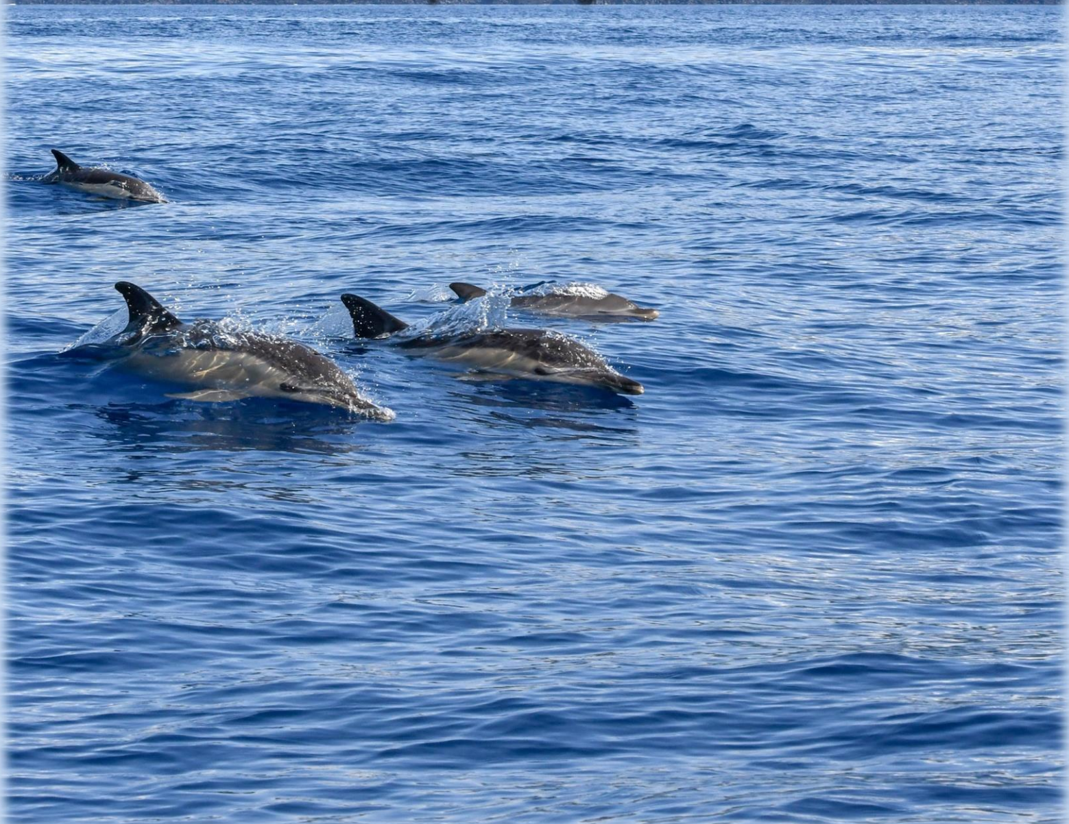
Short-beaked common dolphin – Pico island