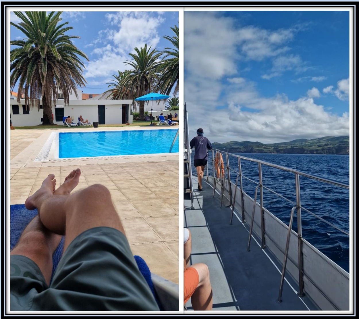
Left: I split my time between the pool at Hotel Caravelas and the Zodiacs for whale watching.