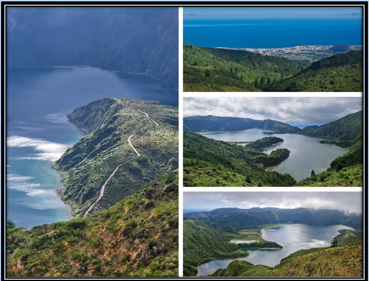
Sao Miguel island