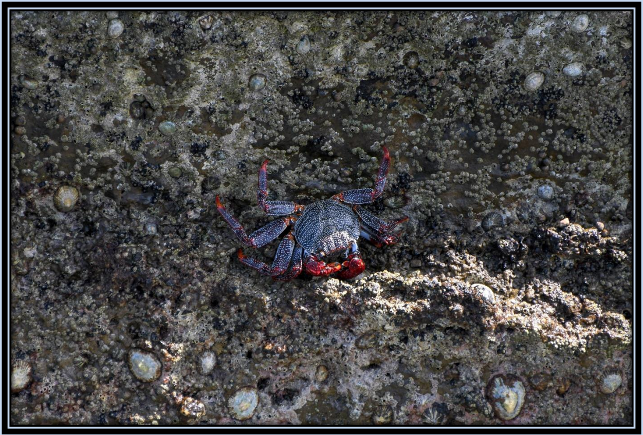
Red rock crab ( Grapsus adscensionis ) – Pico island