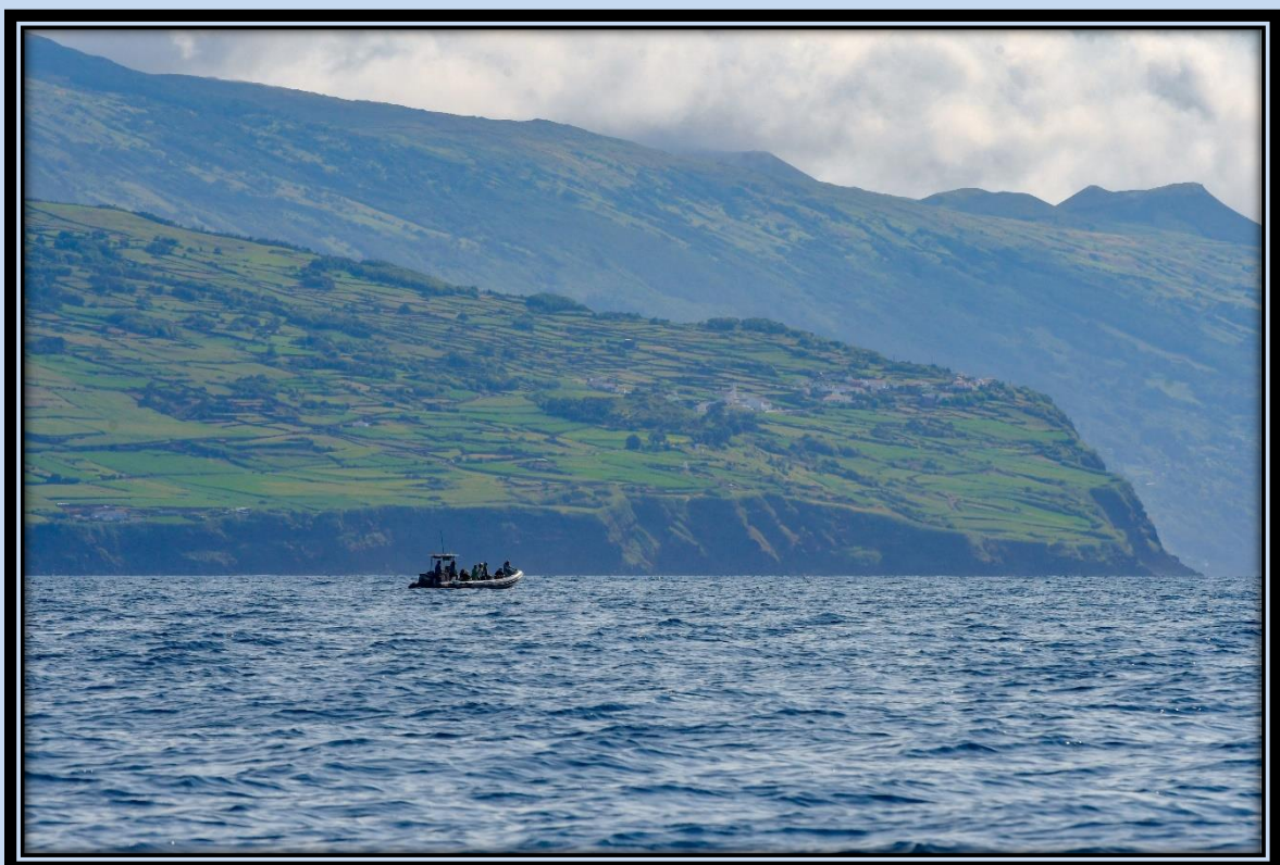
Whale watching – Pico island