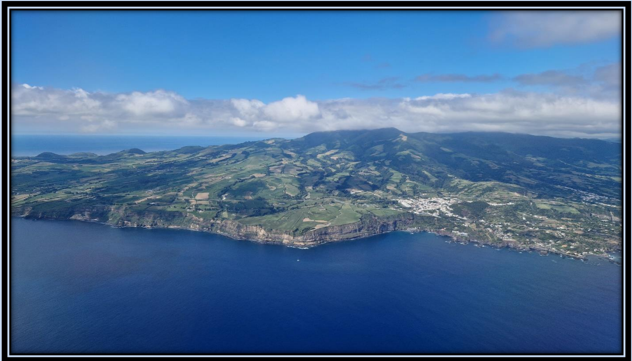
Sao Miguel island

I shared my time between Sao Miguel island (3 nights) and Pico island (4 nights). Azores airlines have good connections in between. I also did a day tour to the charming Faial island which is only a 30 minutes boat ride from Pico.