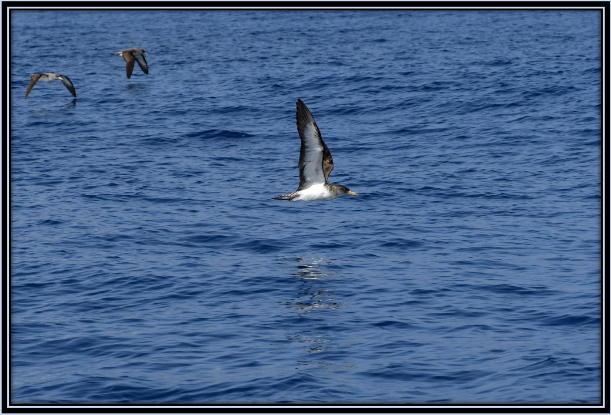
Cory's shearwater – Pico island. A good bird for birders...