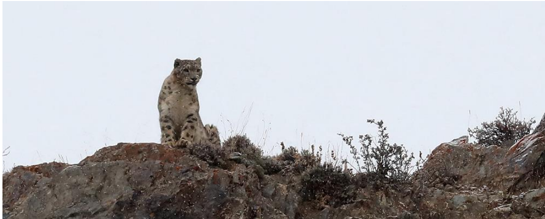
Snow Leopard in SNOW