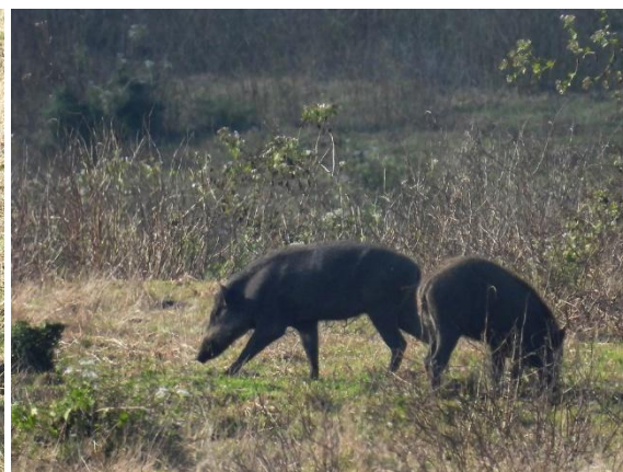
Banteng and Javan Deer (left). Wild boars (right)