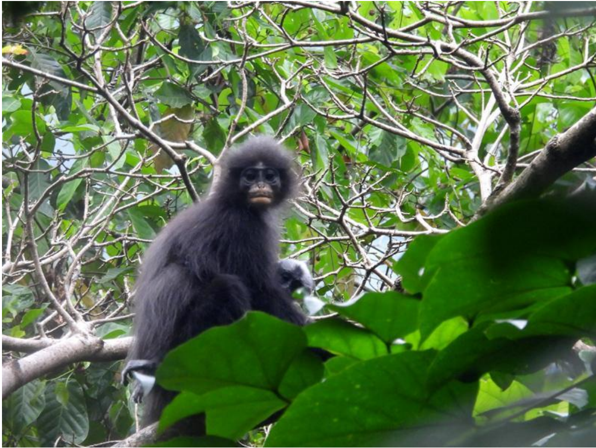
Javan Fuscous Leaf Monkey with its baby

Birds seen are Olive-backed Sunbird , Crested Serpent-eagle , Long-tailed Shrike , Orange-bellied Flowerpecker , Crimson-breasted Flowerpecker and the Java and Bali endemic Yellow-eared Barbet .