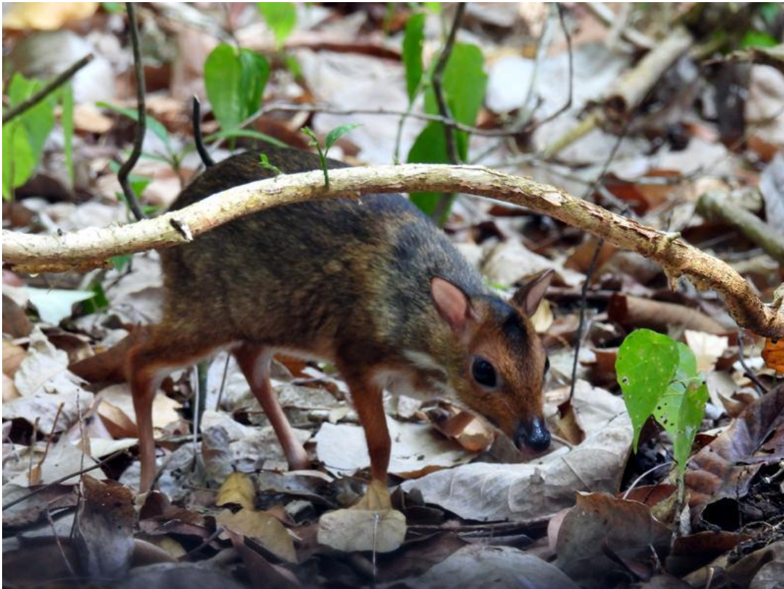
Javan Chevrotain (Mouse Deer)

Even surprised, a Javan Chevrotain (Mouse Deer) , sneaked to the hide and drank in calmly! From recent camera trap research, this Java and likely Bali endemic found to have a healthy population exist in the park. Other mammals seen were Plantain Squirrel and Black Giant Squirrel .