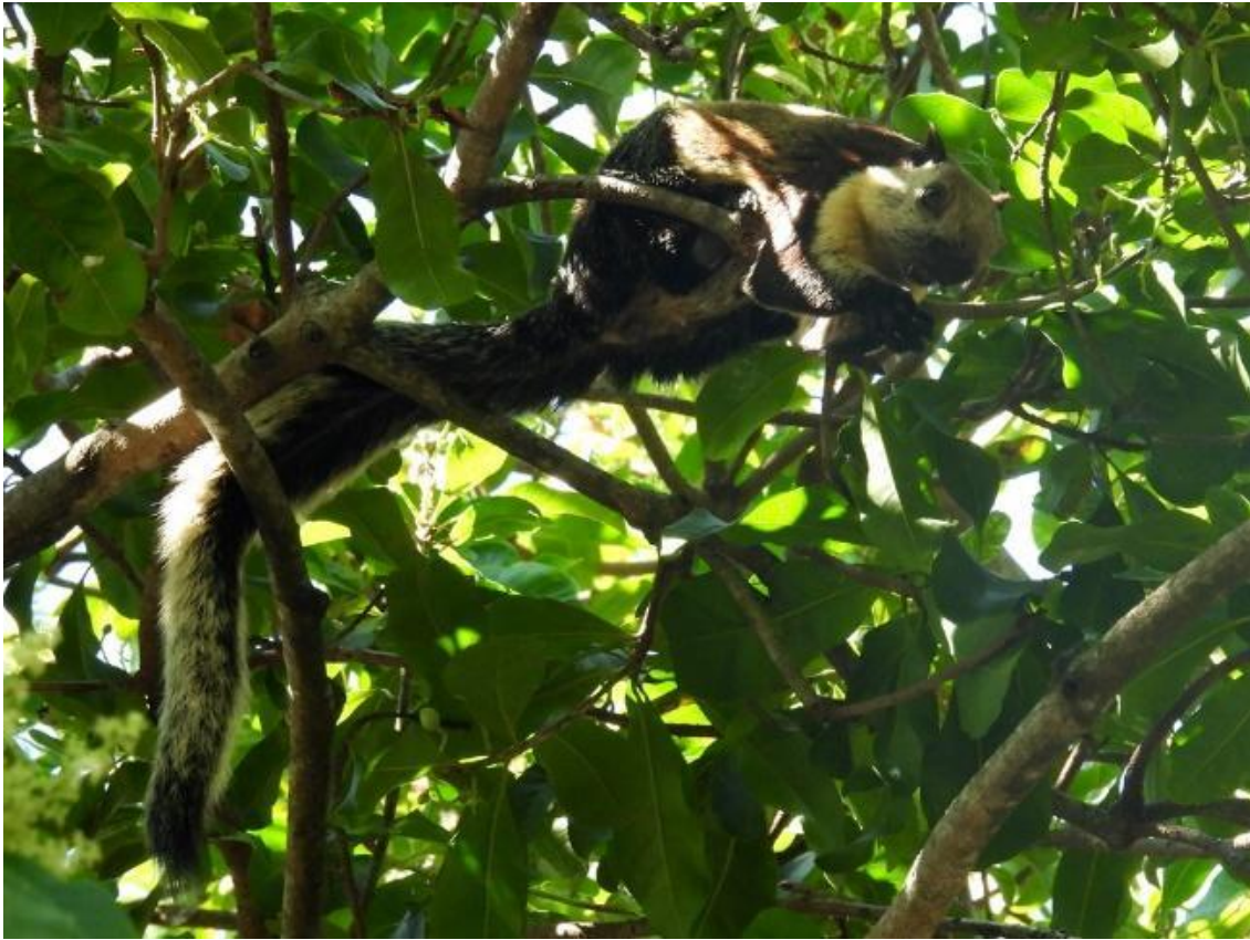
Black Giant Squirrel