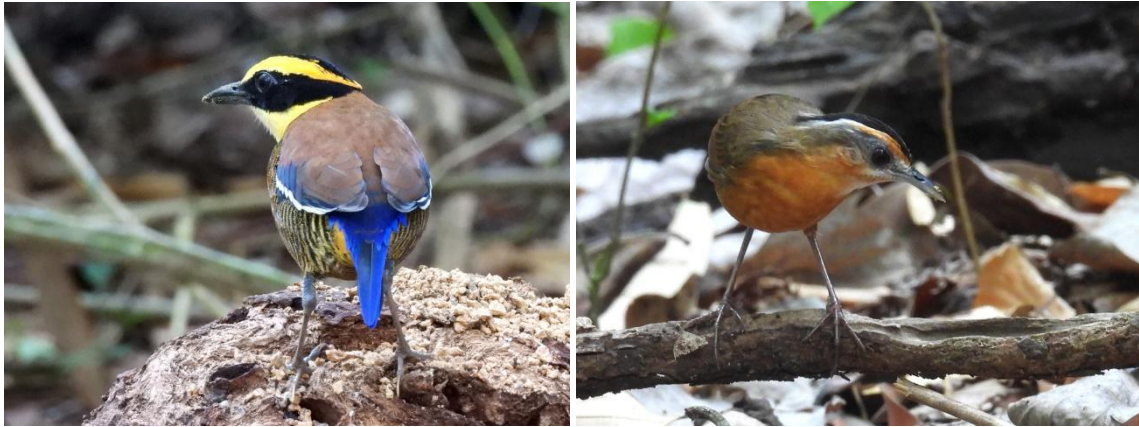
Javan Banded Pitta (left), Rufous-browed Babbler (right)

A pair of Great Slaty Woodpecker seen after a couple of minutes search. A stunning bird, one of the largest members of its family and now only recorded in a few areas in Java. In the forest surrounding, Javan Broadbill nicely perched in close distance. Another bird showed up briefly. Oriental Dollarbird , Velvet-fronted Nuthatch , Olive-winged Bulbul , Racquet-tailed Treepie , Slender-billed Crow , Edible/Black-nest Swiftlet and Chestnut-headed Bee-eater .