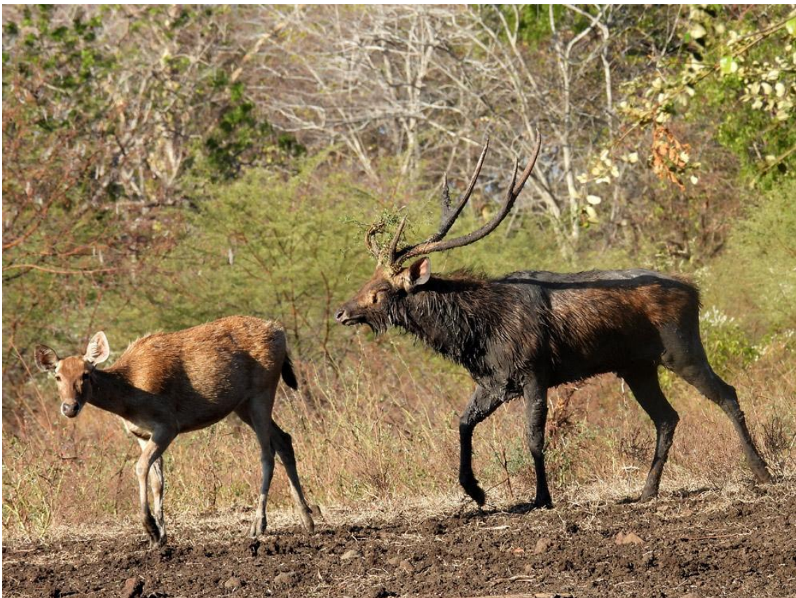
Javan Deer in Baluran NP