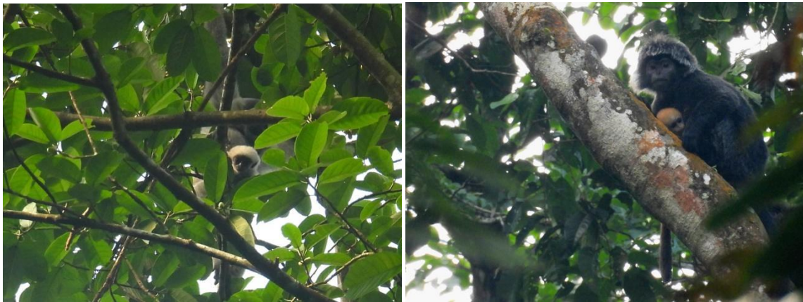
Javan Gibbon (left) and Spangled Ebony Langur (right), all seen having a baby

On the way back to Mendolo to have a birding session, House Swift is seen flying around the bridge. While in Mendolo village, nine birds were seen, including two additional species to the list: Black-winged Flycatcher-shrike and the smallest woodpeckers in Java, Rufous Piculet .