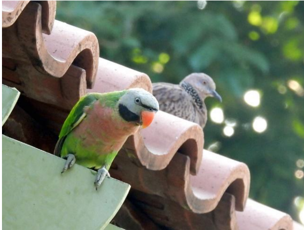
A Red-breasted Parakeet and Eastern Spotted Dove

Early arrival in Gambir train station, Jakarta gave advantages to our tour. While waiting for the train that takes us to Pekalongan, Central Java, some interesting birds were seen. Pink-necked Green-pigeon , Coppersmith Barbet and Red-breasted Parakeet , along with the common and widespread Cave Swiftlet , Eastern Spotted Dove , Sooty-headed Bulbul and Eurasian Tree Sparrow .