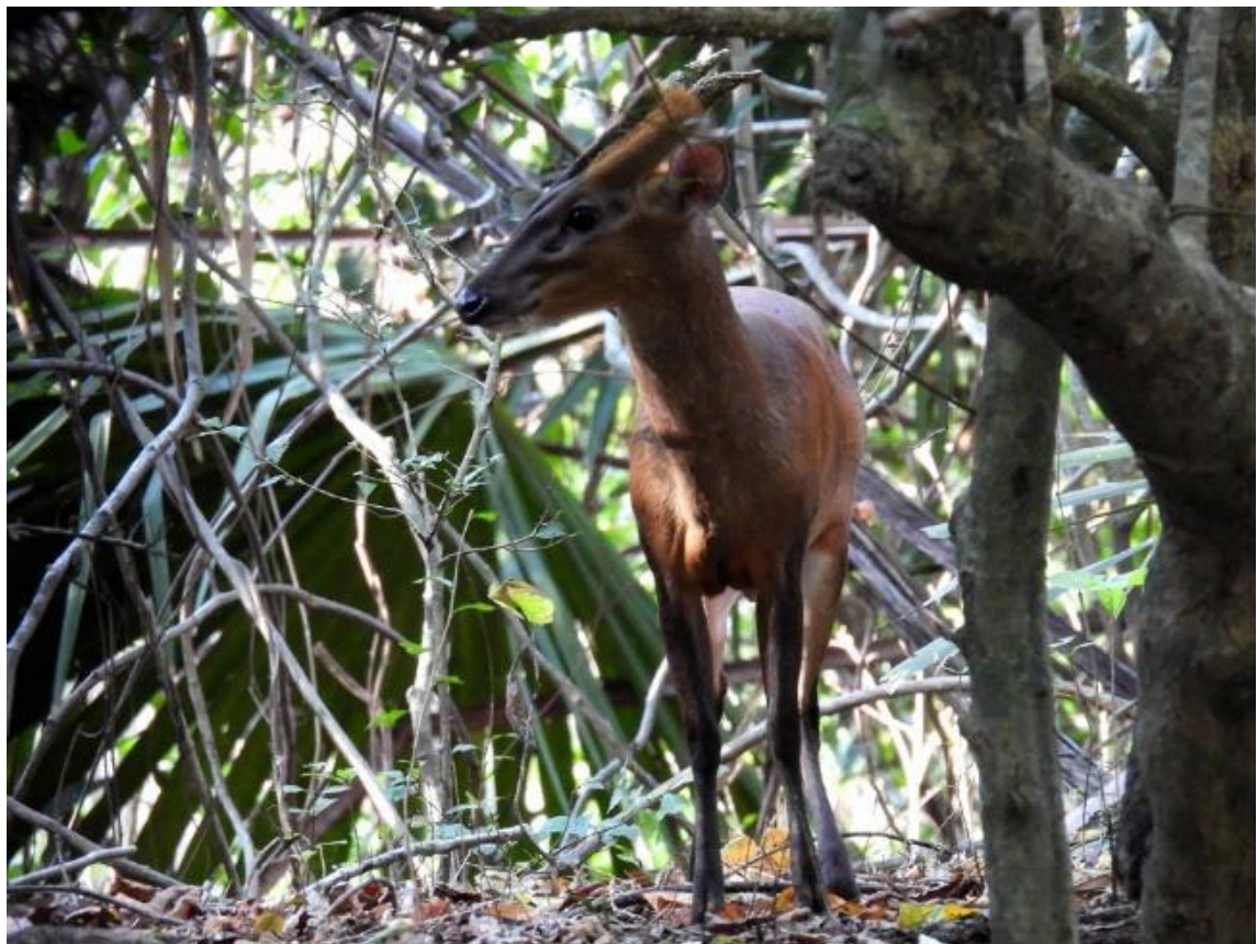
Southern Red Muntjac (Barking Deer)