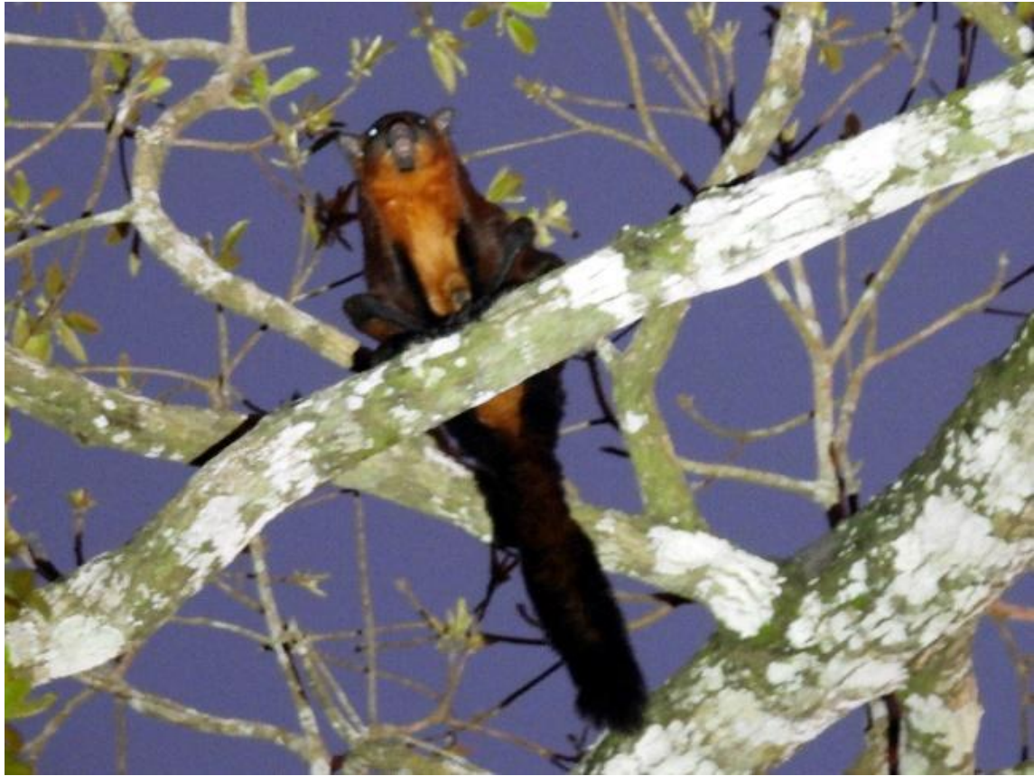
Red Giant Flying Squirrel