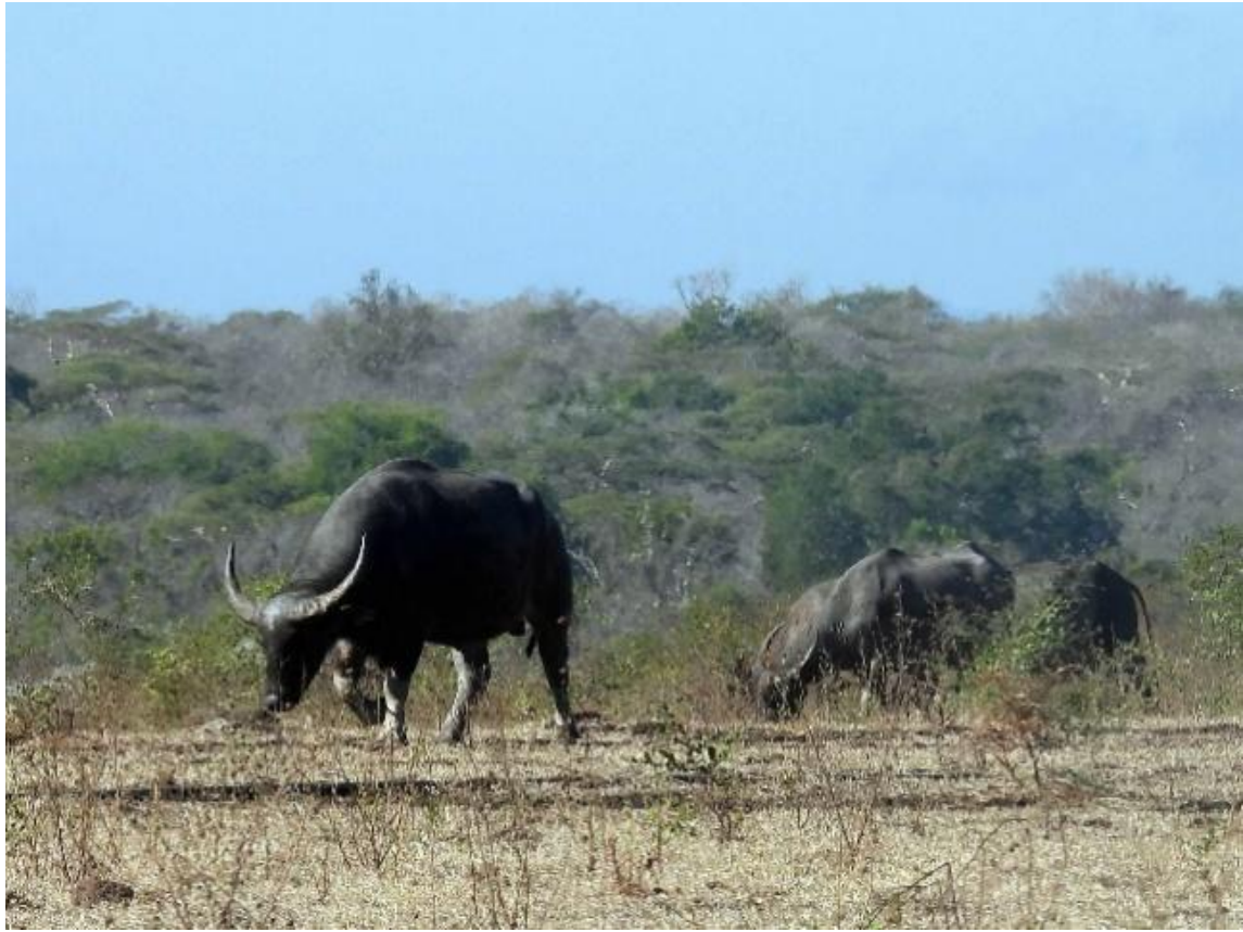
Domestic Water Buffalo