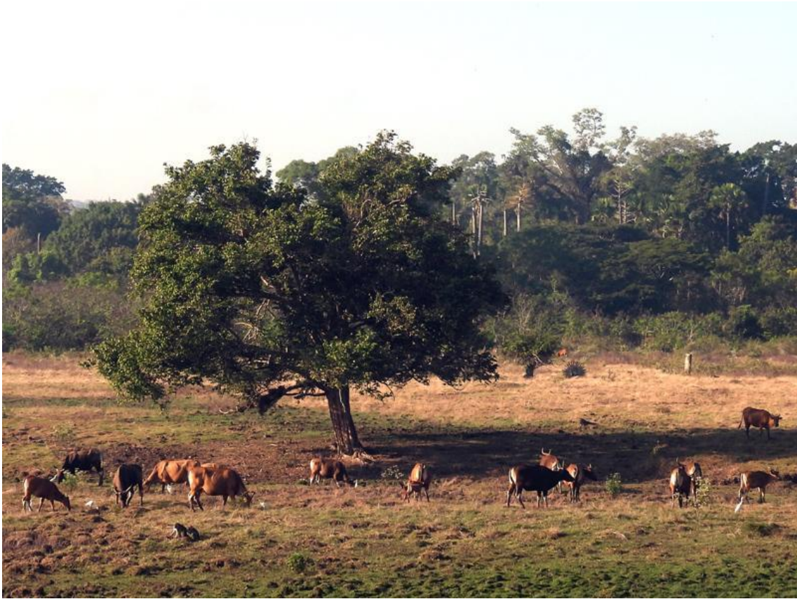
Banteng and other wildlife grazed in Sadengan, Alas Purwo NP