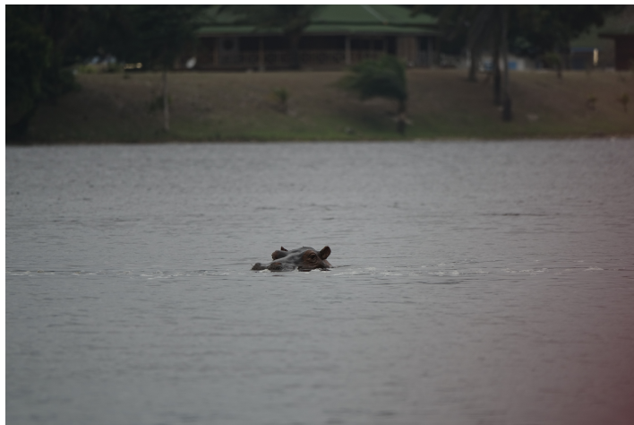
Loango, 2022

Overnight lodging: Ndola Tented Camp on sharing basis. Meals included: Breakfast, lunch, dinner + non-premium drinks