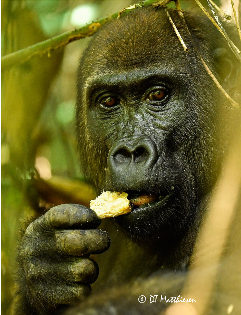
A winsome Western Lowland Gorilla.