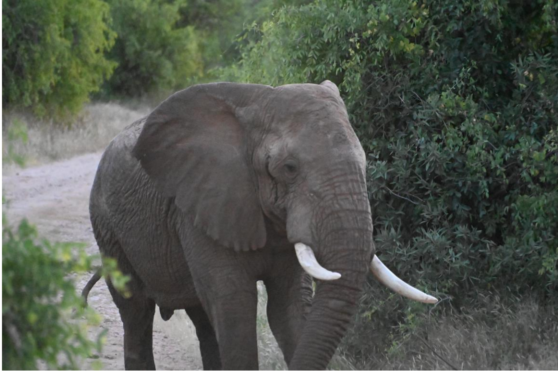
Savanna Elephant bull

That evening at dinner a Yellow-winged Bat flew over our table several times catching the insects attracted to the lights. Back at our tent I photographed many of the swarming insects, then walked around some of the unoccupied tents with a flashlight and found a Heart-nosed Bat .