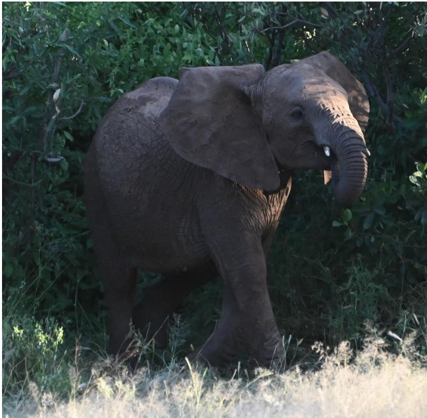
Savanna Elephant calf