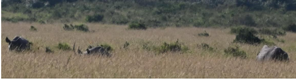
Eastern Black Rhinoceros