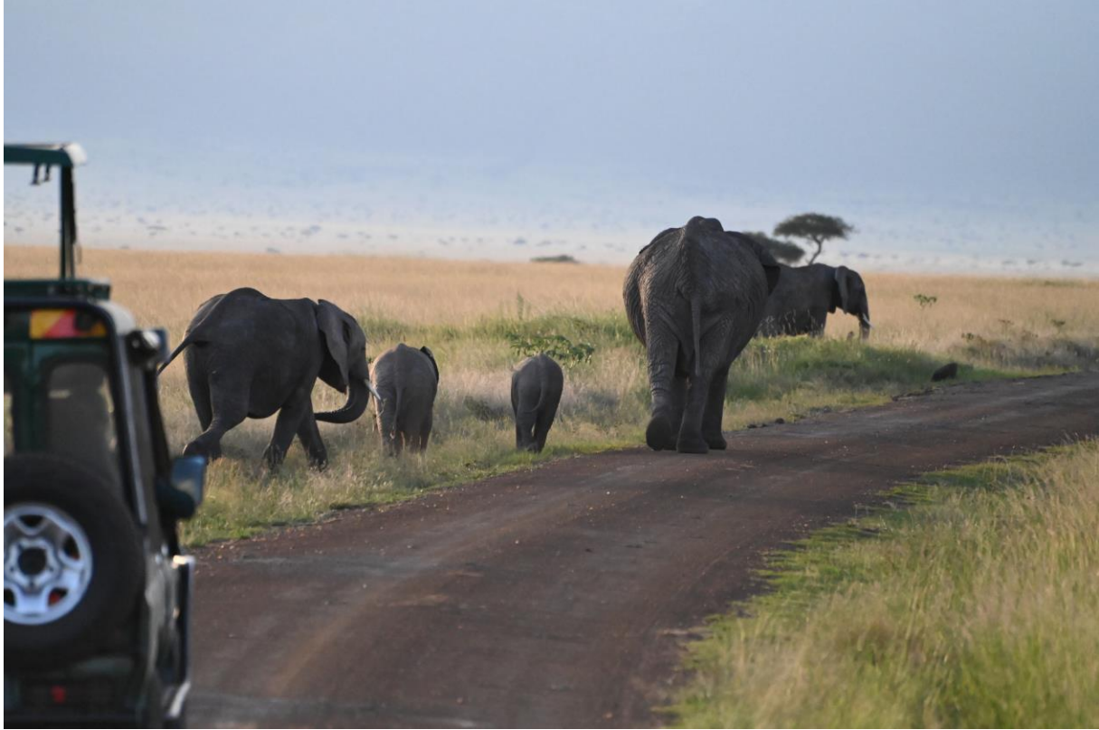
A worthwhile kind of traffic holdup.