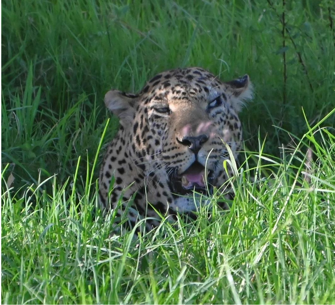
Though he appeared well-fed, he also looked to be blind in his left eye.