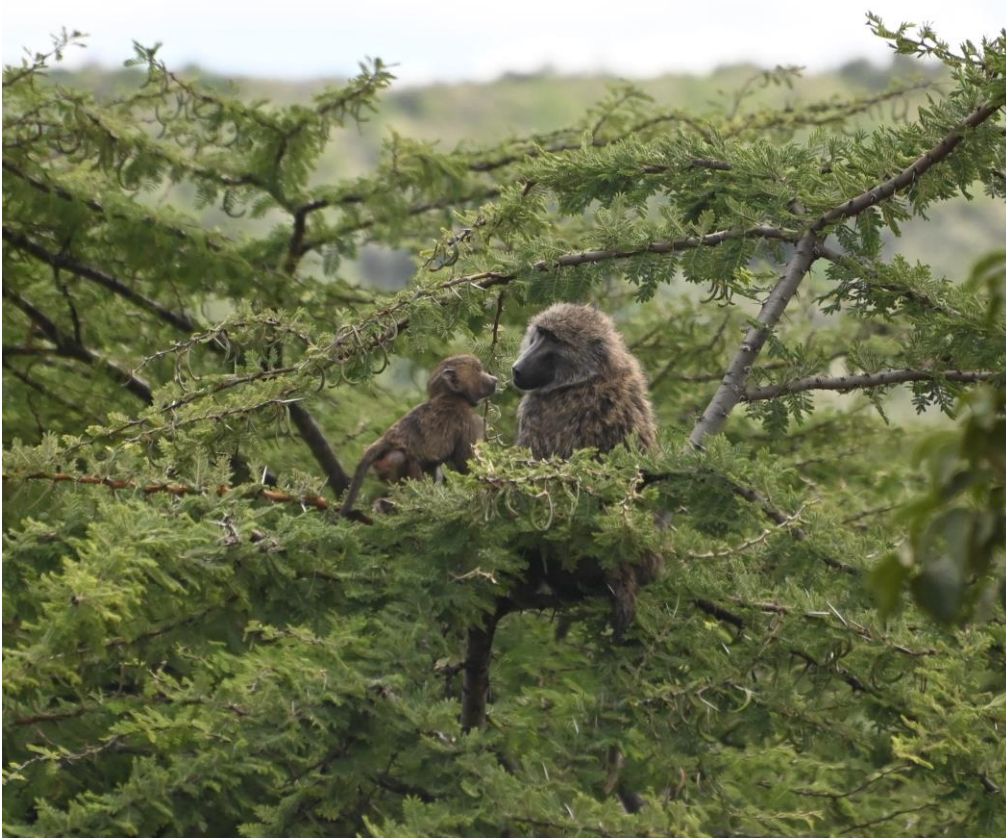
Olive Baboon and Common Dwarf Mongoose.