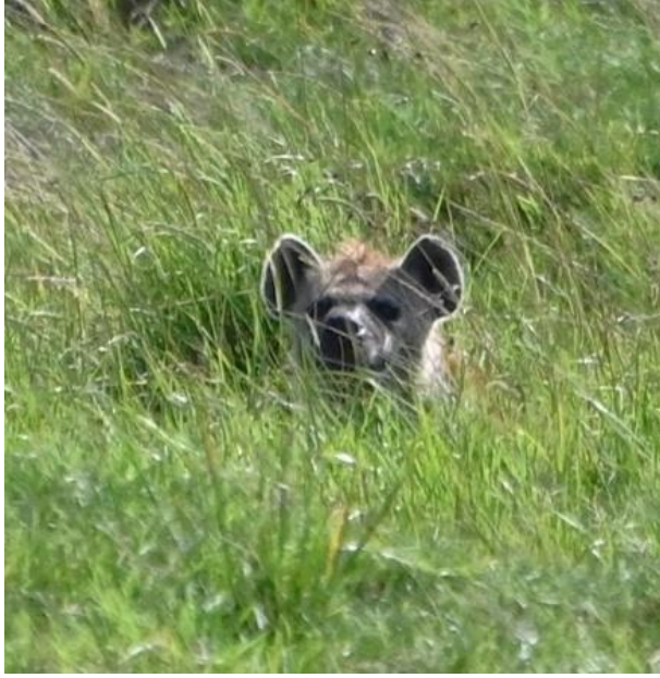
Spotted Hyena eying the antelopes.