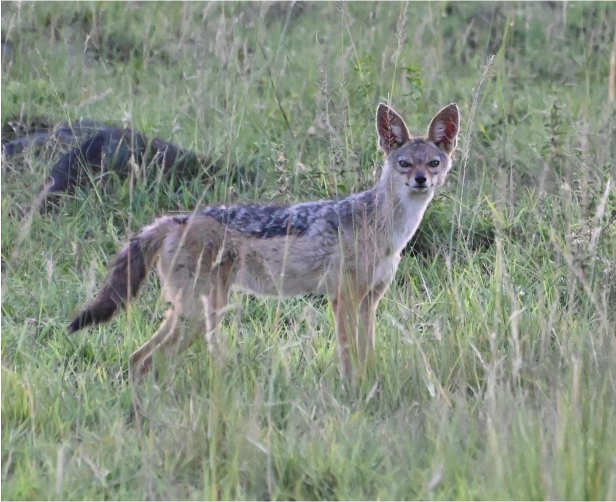
A pair of Eastern Black-Backed Jackals .