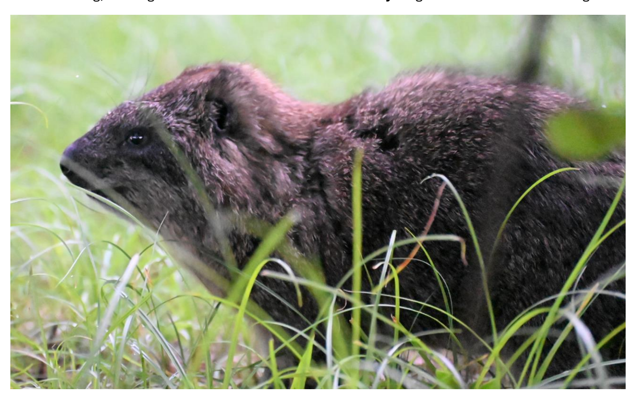
And while loading the vehicle, we spotted a whole colony of Eastern Rock Hyraxes basking on the building's roof.

In the morning, walking out to the vehicle an Eastern Rock Hyrax grazed between the buildings.