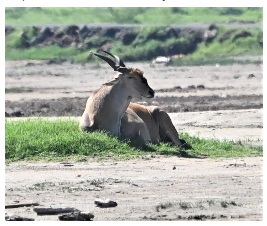
On the way out there were large herds of Cape Buffalo, East African Elands, Grant's Zebra,

Finally at the rift lake, besides the famous flamingos we saw East African Elands .