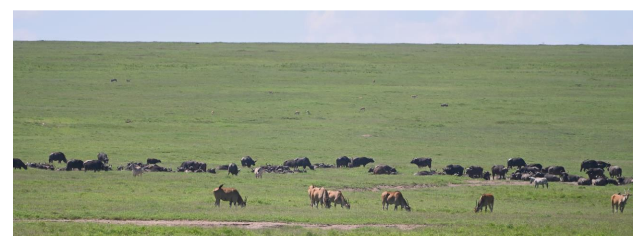
and Thomson's Gazelle.