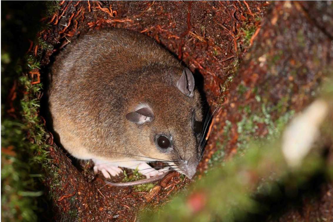
35-Bruijin's Tree Mouse ( Pogonomelomys bruijinii )- Great views of several in Klailik