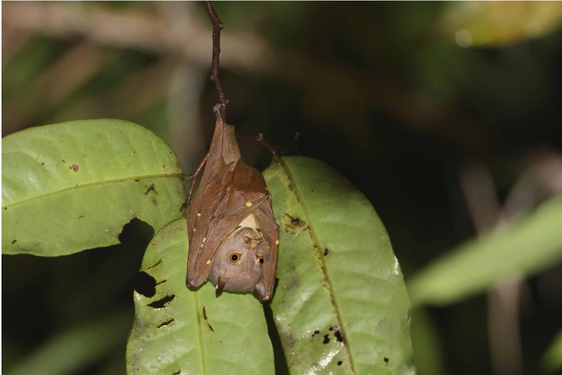
44-Waigeo Spotted Cuscus ( Spilocuscus waigeou )- Around ten logged in Waigeo, stunning views!