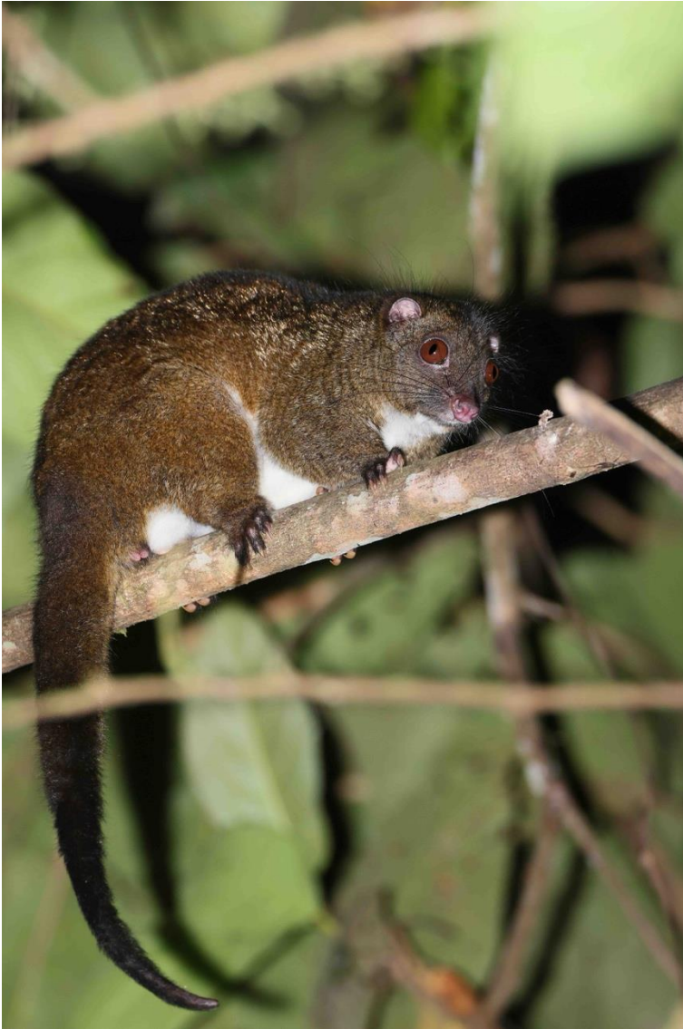
8-Striped Possum ( Dactylopsila trivirgata )- Recorded in all the places visited 9-Feather-tailed Possum ( Distoechurus pennatus )- One recorded in the Arfaks