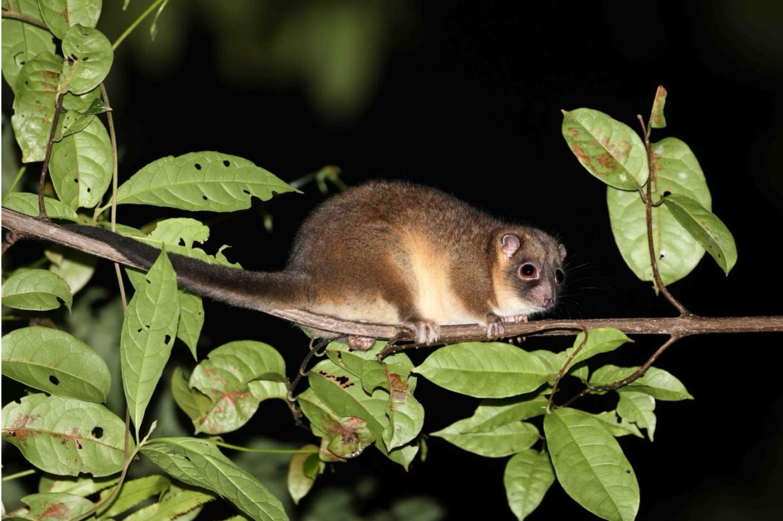
7-Reclusive Ringtail ( Pseudochirops coronatus )- 6 logged in Mupi, including some extremely close.