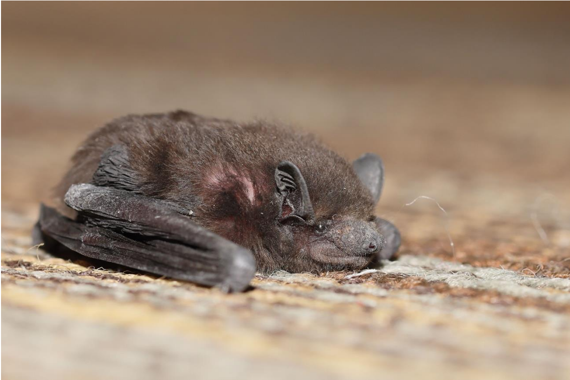
18-Müller's Three-striped Dasyure ( Myoictis melas )- One hanging around the Mupi settlement put on a great show