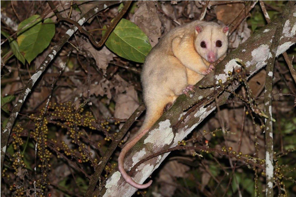
5-Ground Cuscus ( Phalanger gymnotis ) - Photographs. Several well seen in Mupi