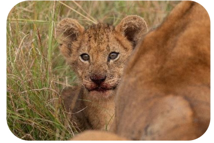
Lion cub (Queen Elizabeth)