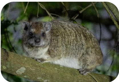
Bush Hyrax? (Lake Mburo)