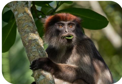
Red Colobus (Kibale)