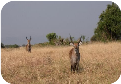
Waterbuck (Queen Elizabeth)