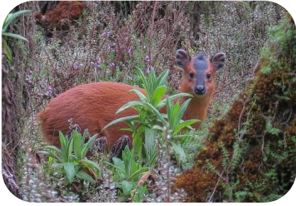
Rwenzori Red Duiker