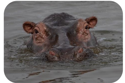
Hippo (Queen Elizabeth)