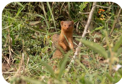
Dwarf Mongoose (Lake Mburo)