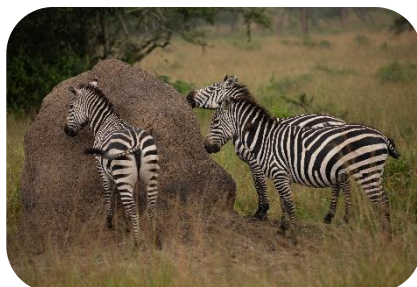
Zebra (Lake Mburo)