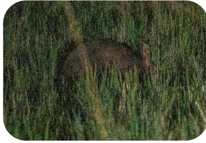
Aardvark (Queen Elizabeth)