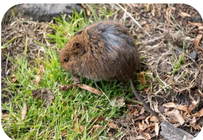
Unidentified Rat (4100m Rwenzori)