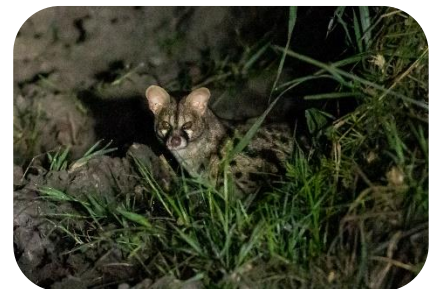
Blotched Gennet (Lake Mburo)