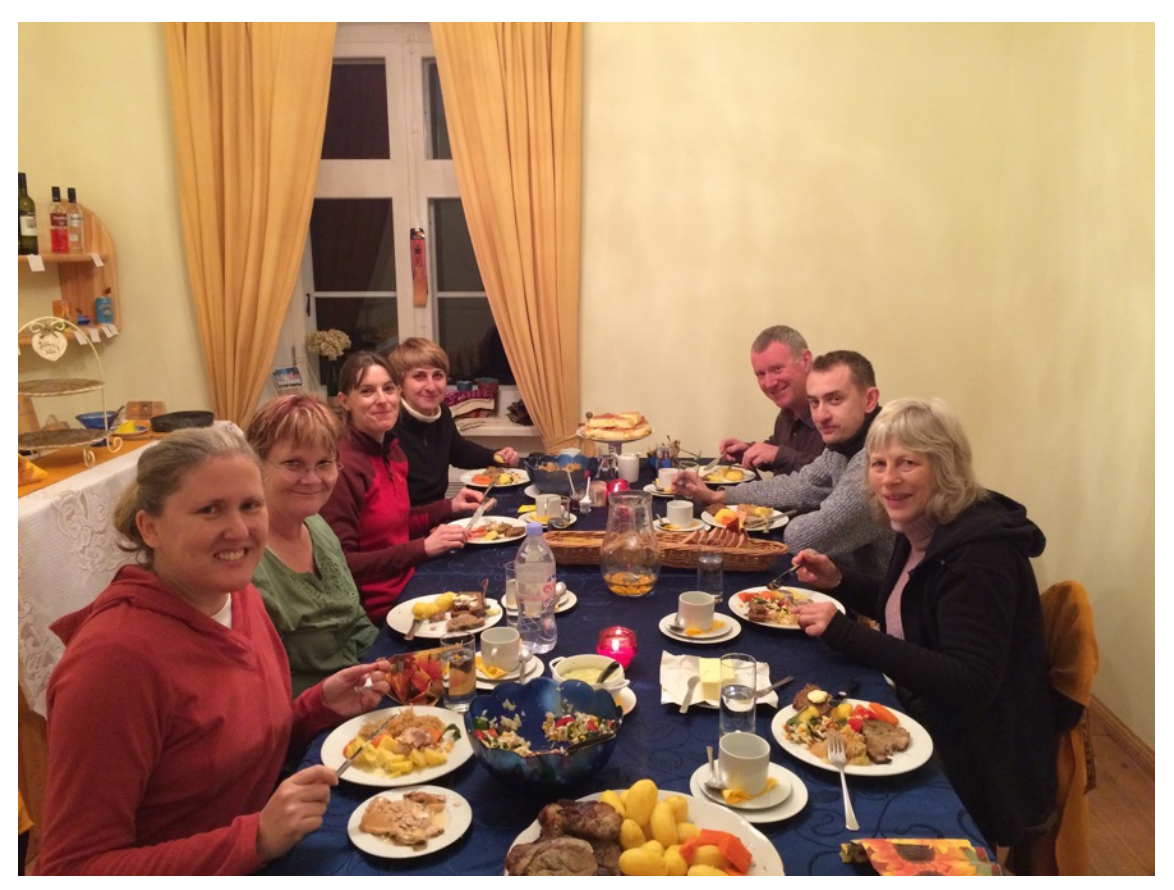
One of the many Estonian feasts