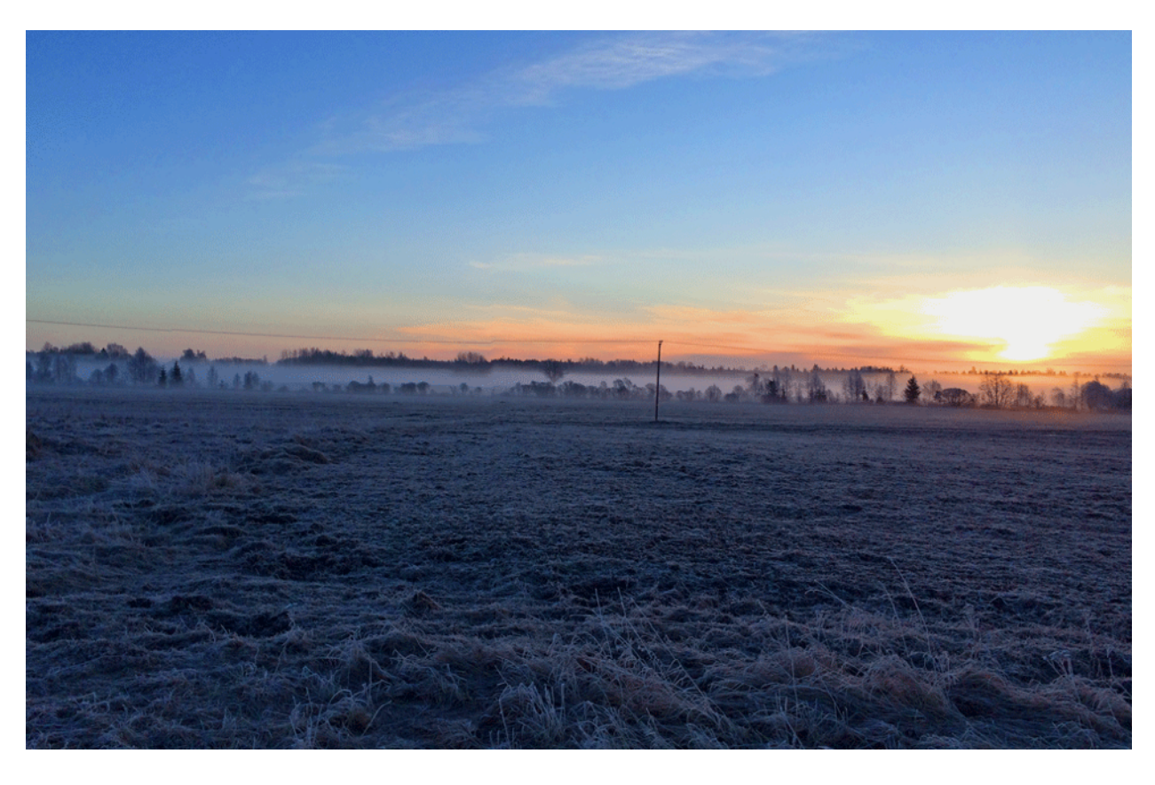
Sunrise over the field where we saw our Eurasian Lynx!

as it flew over the minibus at dawn on the 6th.