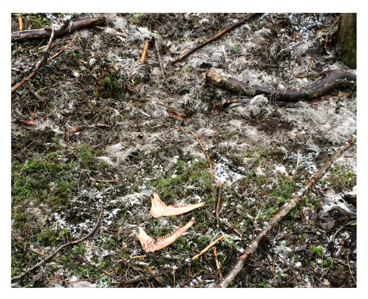
Roe Deer remains after a Lynx kill and Lynx Traps used for research purposes