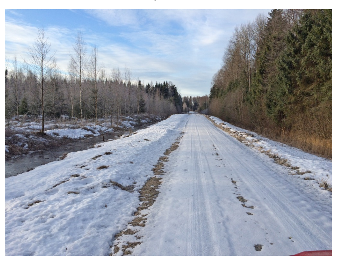
WISE BIRDING HOLIDAYS LTD - ESTONIA: Eurasian Lynx Quest, March 2015