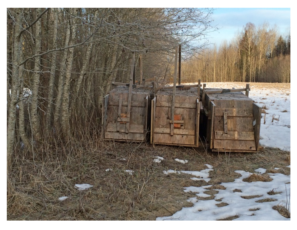
WISE BIRDING HOLIDAYS LTD - ESTONIA: Eurasian Lynx Quest, March 2015