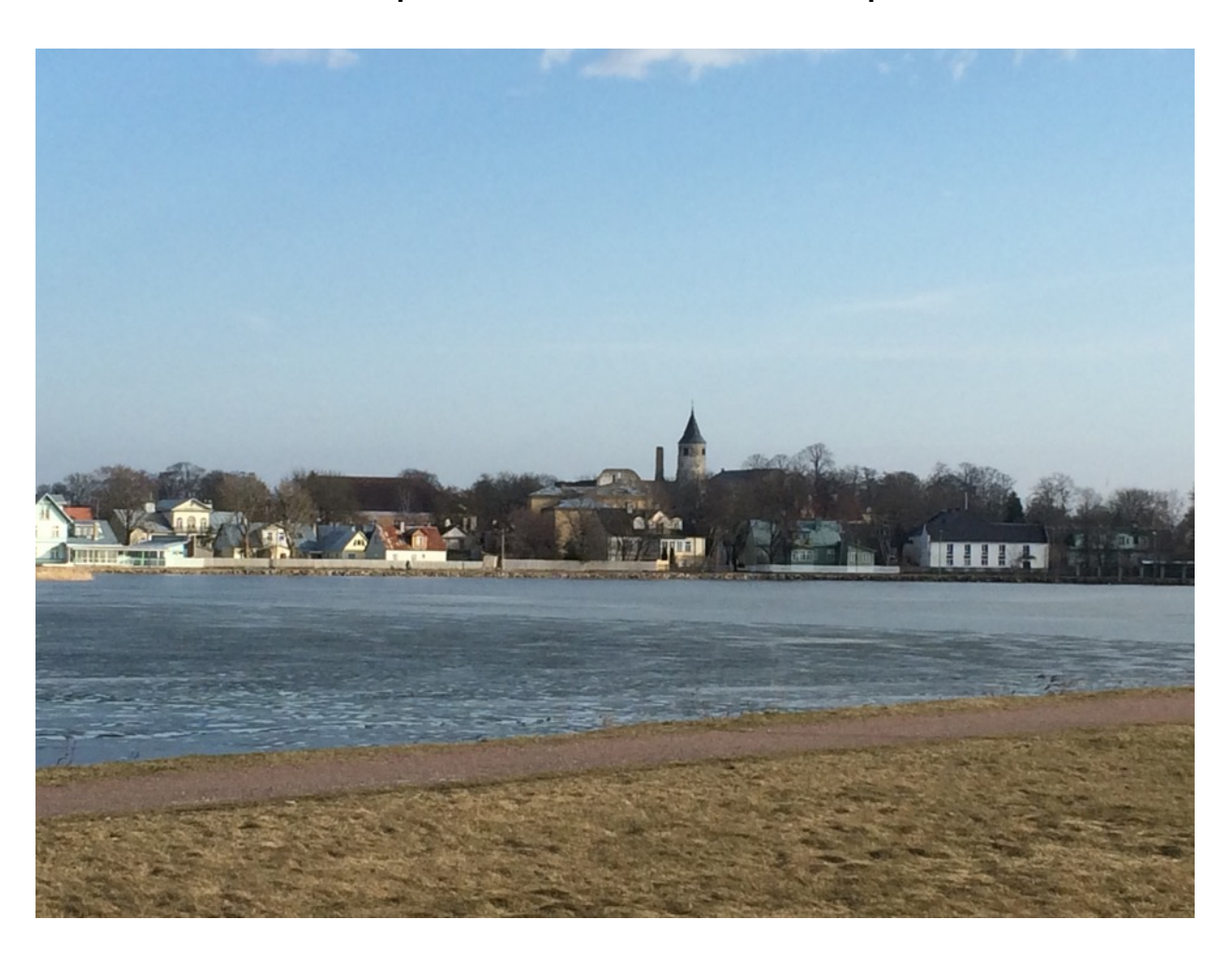
WISE BIRDING HOLIDAYS LTD – ESTONIA: Eurasian Lynx Quest, March 2015