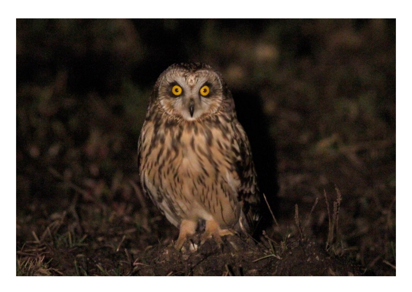
Short-eared Owl and Eurasian Pygmy Owl