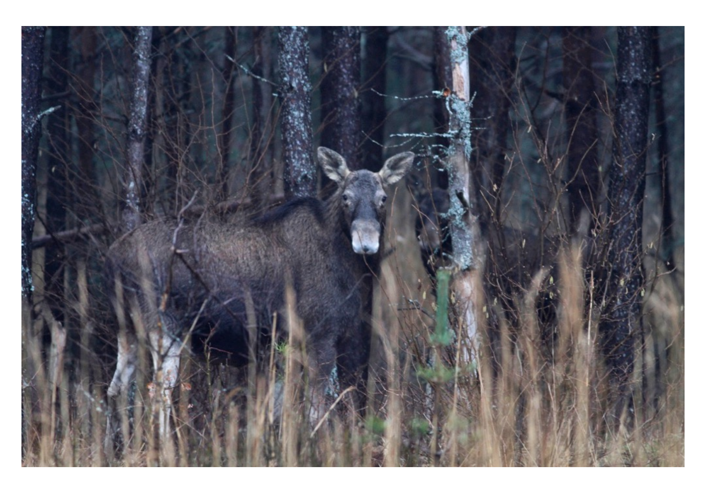
Eurasian Elk and Lynx habitat near Paide