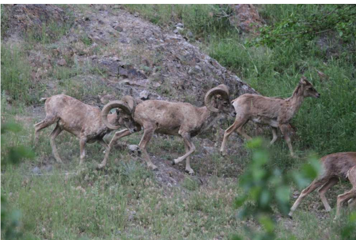
Argali ( Ovis severtzovi ). Picture took in a paddok near the guest house.

In Nouratau we stayed in Hayat near the reserve of Nuratinsky which unfortunately we were not authorized to enter ! On crests we were able to observe several Argali ( Ovis severtzovi ). The first night I tried a night walk. But the owner of the guest house stopped me quickly – I had just enough time to take picture of Eurasian Scops Owl. We negociated to look at porcupine's hole that are numerous in the valley ! We easely find one occupied and wait 3 hours in the night. Nothing except two yapping of fox !