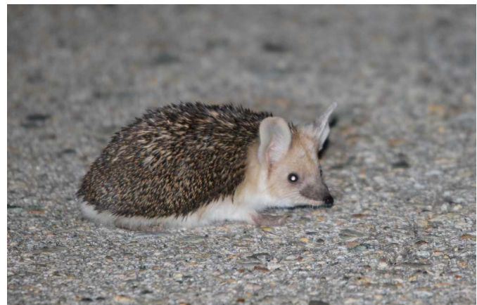
Long eared Hedgehog ( Hemiechinus auritus )