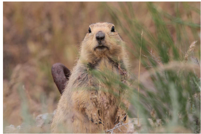
Yellow Ground Squirrel ( Spermophilus fulvus )

Hunters said : wolf very rare, last migration of Saïga in winter in 1990s .