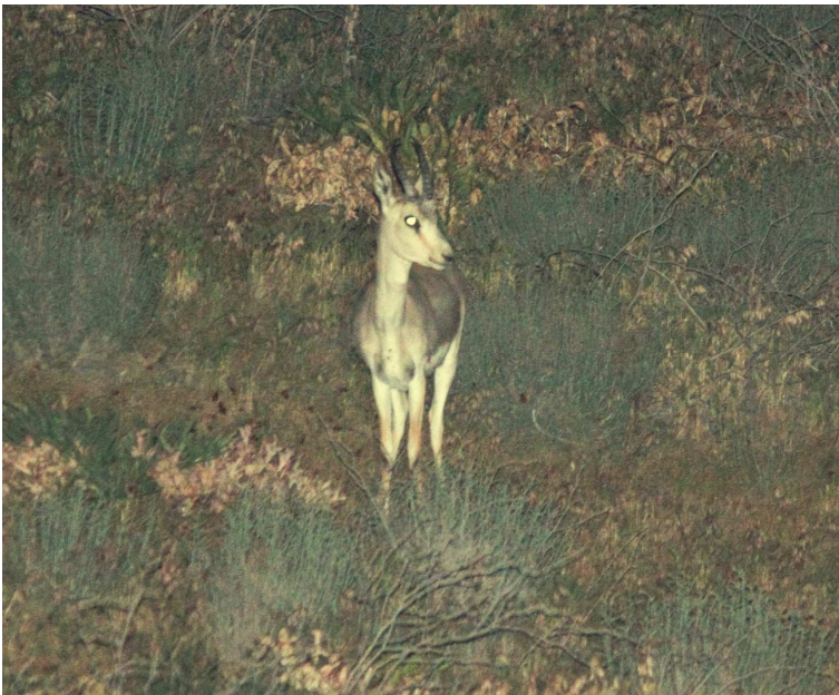
Turmen Gazelle ( Gazella gracilicornis )