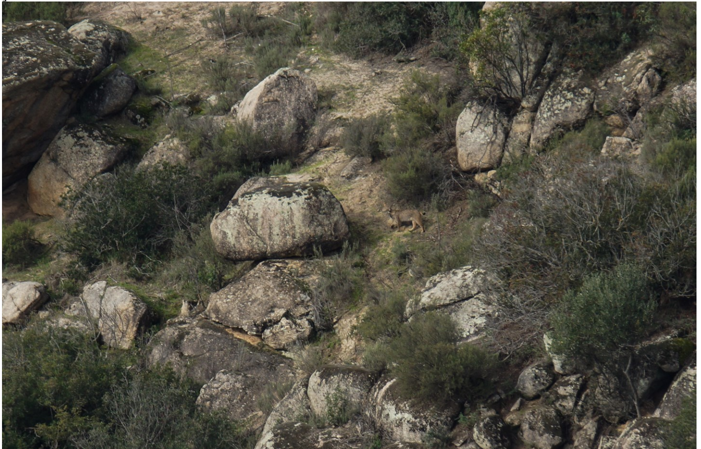
Lynx and Spanish imperial eagle