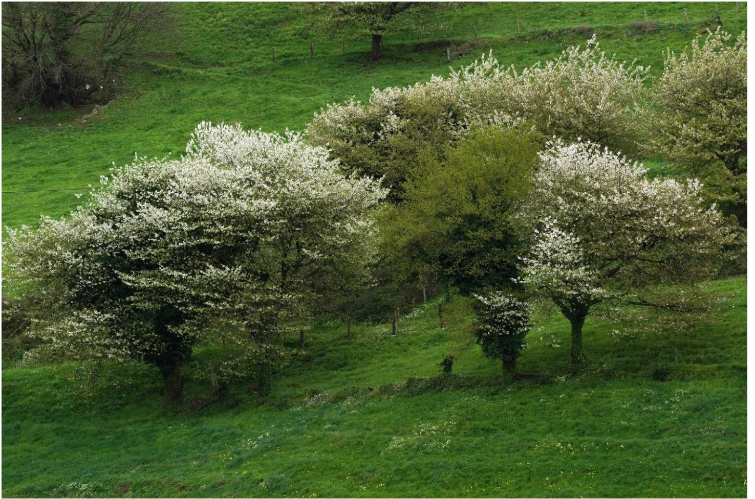
Somiedo in spring