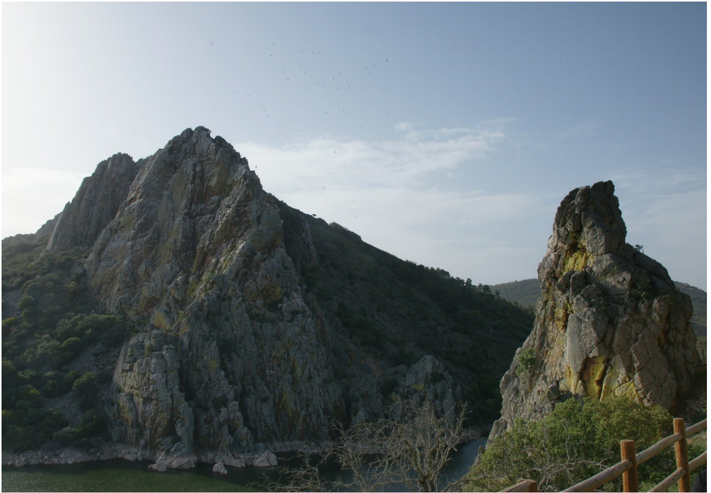
Monfrague culture rock