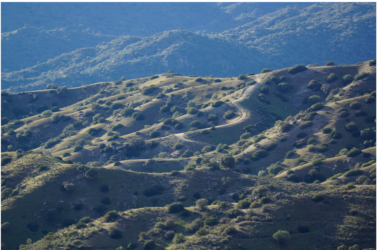
Winter view andujar