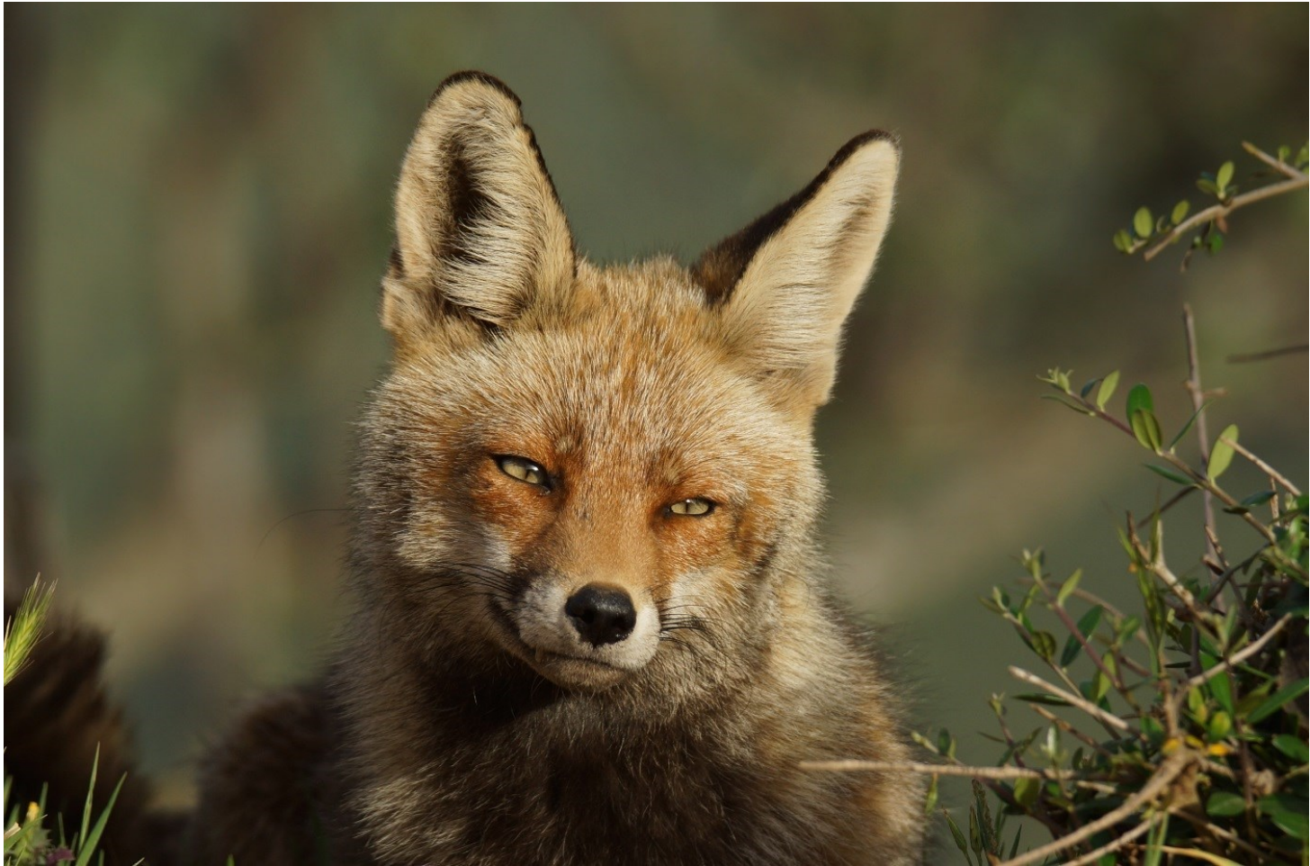
Red fox and mongoose