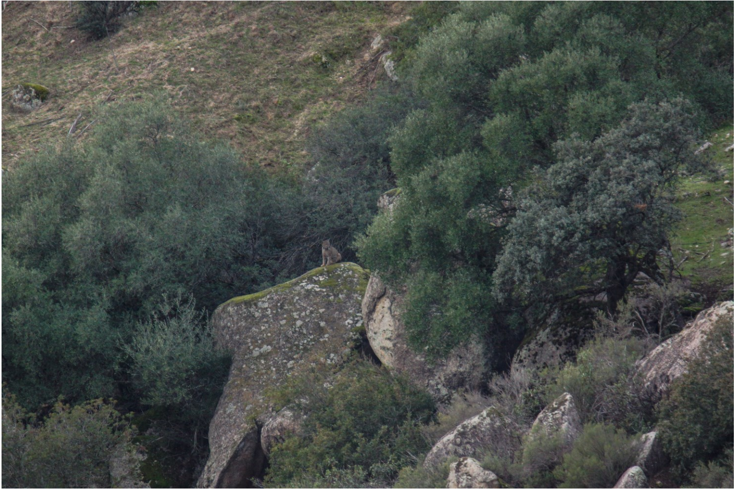
Last lynx view