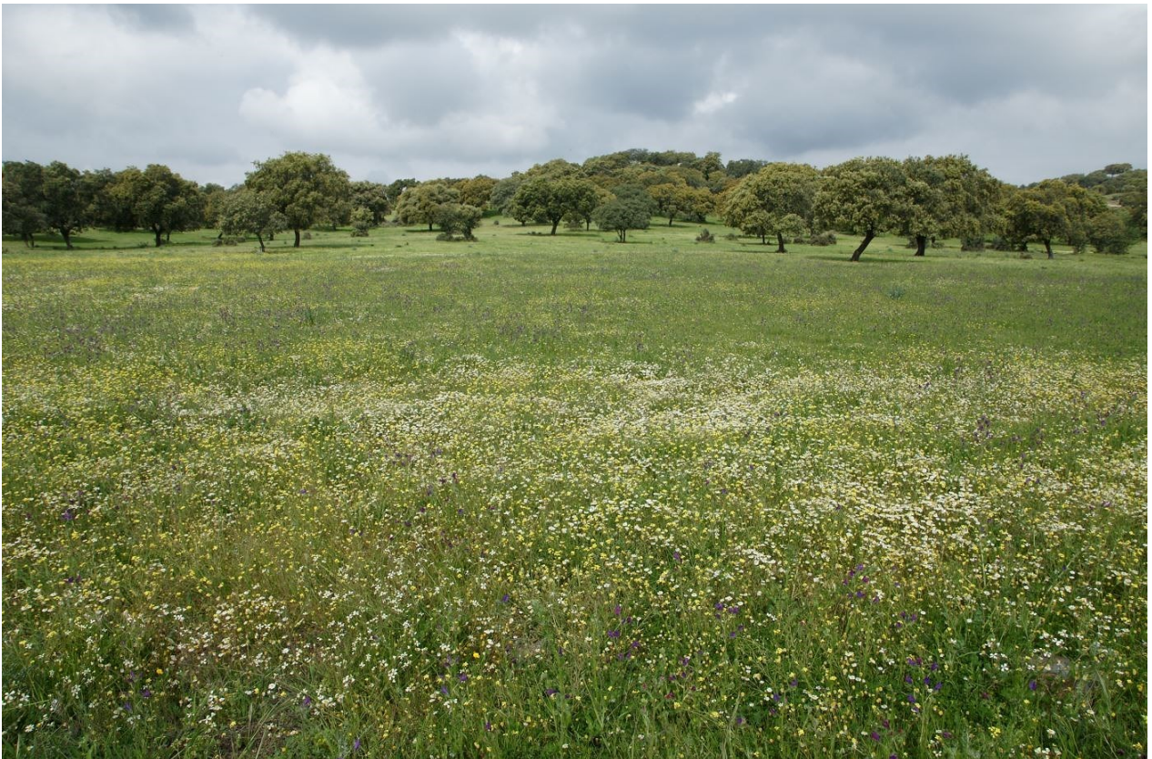
Grey fox (PR) Elephant seals @ Point Reyes NS