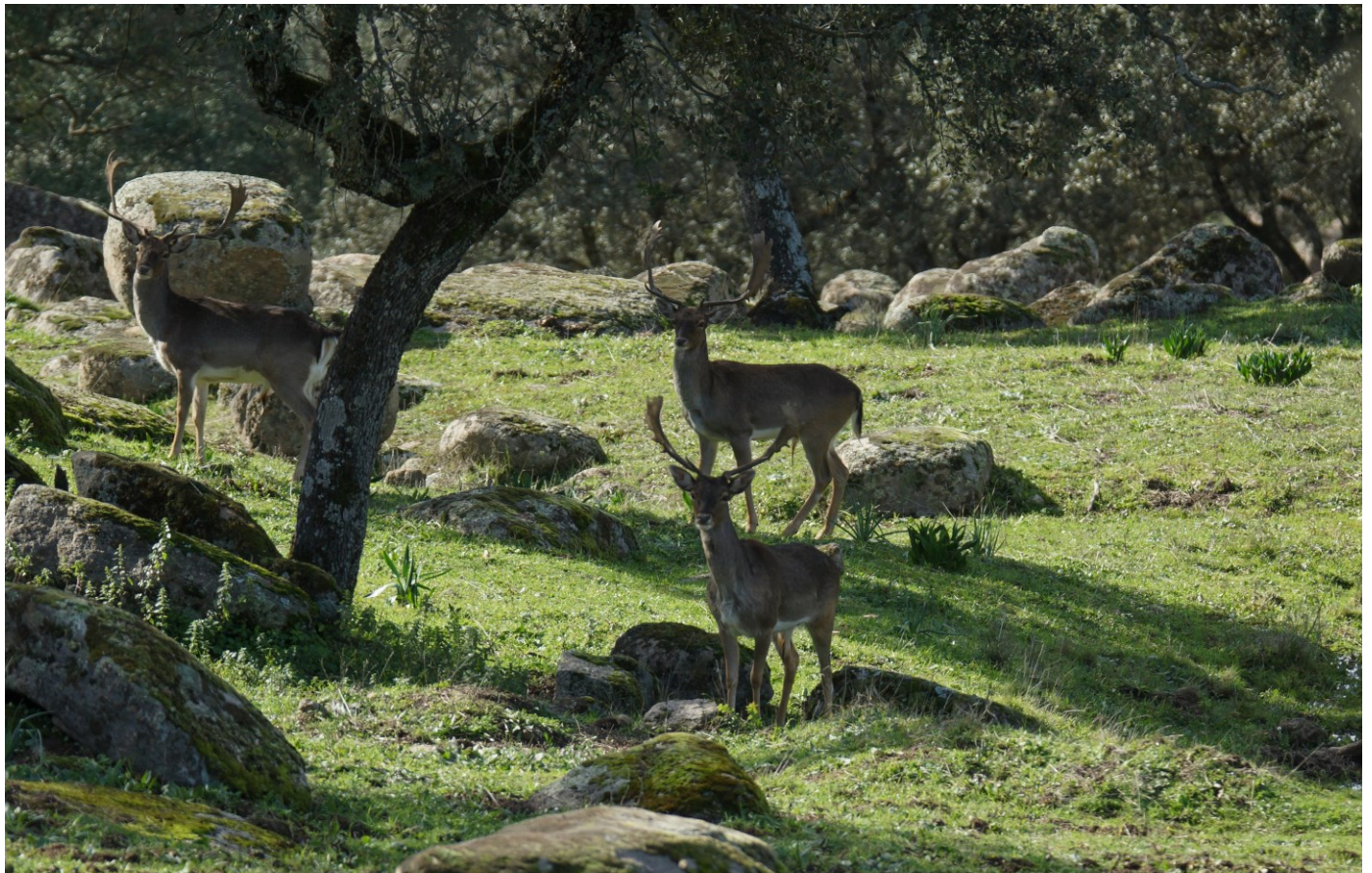
Fallow deer and a wood mouse (probably)