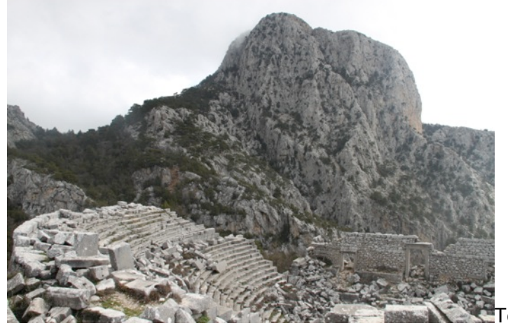
Termessos Theatre: 5 Wild Goats seen from here on the opposite slope