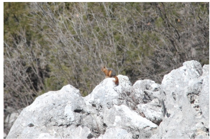
Persian Squirrel. Akseki, 4 April 2015