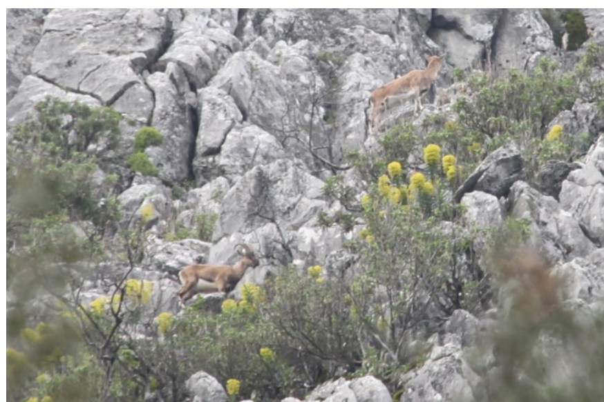
Wild Goats. Termessos National Park, 2 April 2015