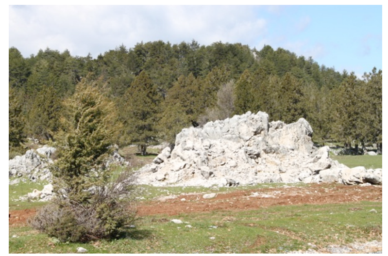
Persian Squirrel habitat (Akseki, Gosney's Site 4)