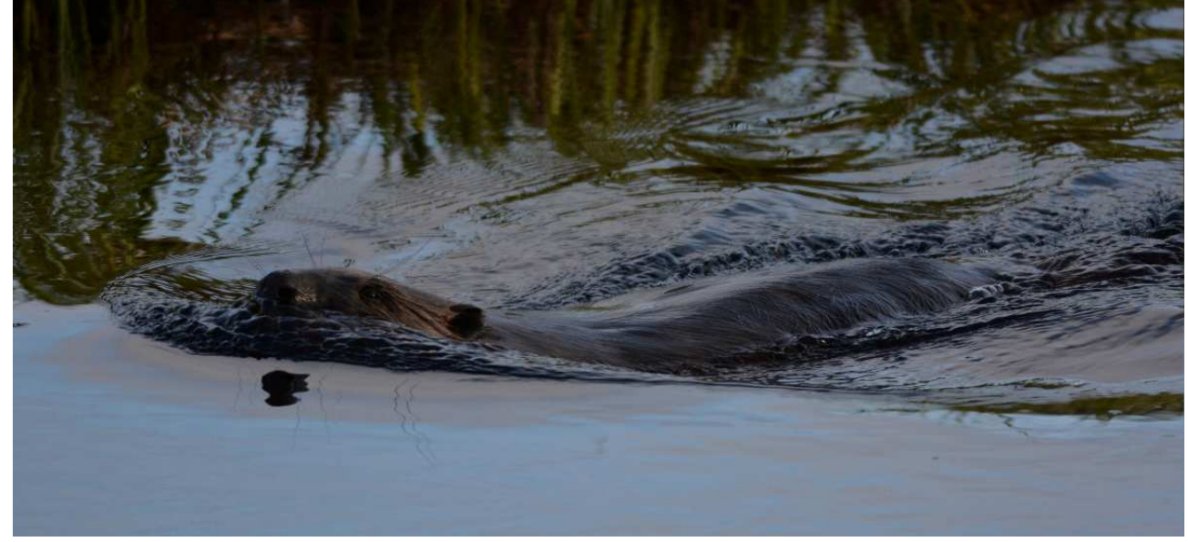
Eurasian Beaver - Soomaa NP.

1/5 1m+6f Luitemaa NR. 4/5 7 ; 5/5 21 ; 7/5 6 Matsalu NP. Quite easy to see at Matsalu NP, not least from the tower at Kloostri.