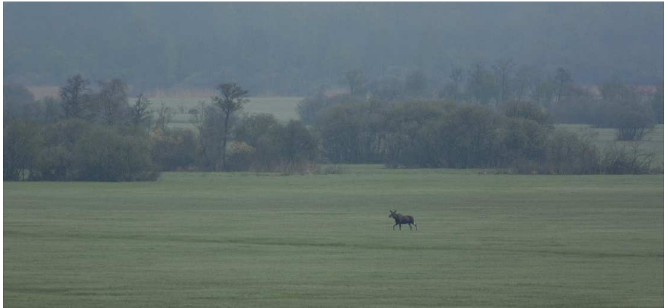
Elk - Matsalu NP.