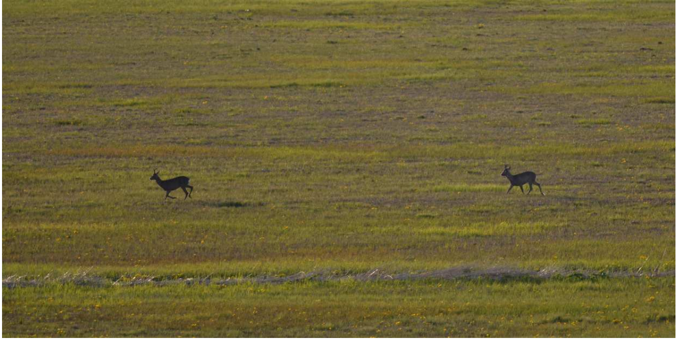
Roe Deer – Matsalu NP.

<u>Luitemaa NR</u>: From the main road (E67) I drove 7 kilometers south on road 333 from Uulu, and took a walk from here in the forest north of the bog. The forest here is obviously used commercially, but still quite good for bird watching. Several Hazel Grouses were found along the road just north of the bog, where they were feeding on fresh buds of the bushes along the road, before flying in to the coniferous forest. Different species of woodpecker were also seen here as well as Willow Tit, Parrot Crossbill, Northern Goshawk and a female Capercaillie. A Pine Marten was seen briefly crossing a path while several Elks favoured the area of grass and bushes on the other side of the road. All in all a pretty nice place, though probably no better than the forest further south and east.