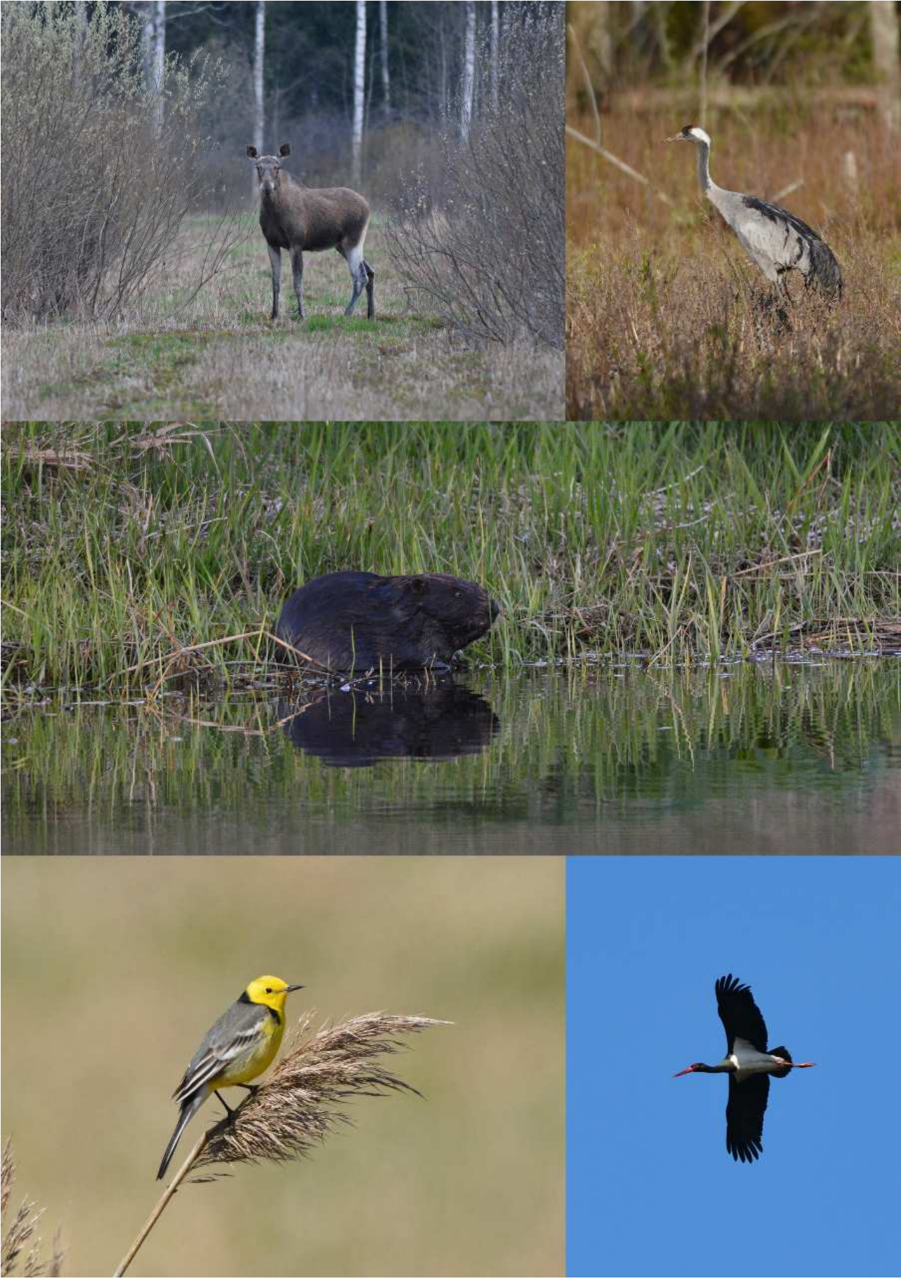
Elk, Common Crane, Eurasian Beaver, Citrine Wagtail and Black Stork.