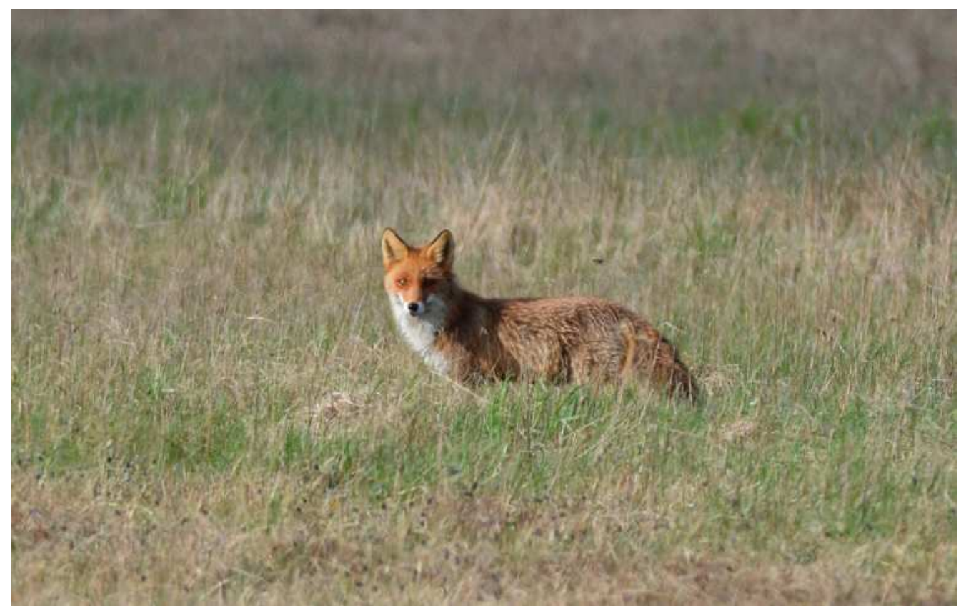
Red Fox - Matsalu NP.

<u>Pakri:</u> Situated some 50 kilometres by road west of Tallinn, and apparently the best place to find Black Guillemot in Estonia. I certainly had no problems finding them, but of course I was helped greatly by the weather which was very nice with almost no wind at all. The birds were lying on the water beneath the cliffs by the lighthouse at the tip of the peninsula. The places is easily found by driving north through the town of Paldiski, and then just following the road along the western coast of the peninsula almost to the end.