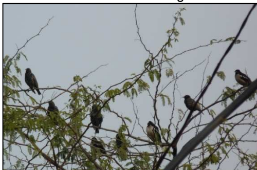
Common & Pied Starlings