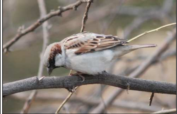
Ssp. indicus - smaller - dark bill

271. *Chestnut-shouldered Petronia Petronia xanthocillis . 1/1 3 farmland SE of Chambal Safari Lodge, 50 farmland S of Chambal Safari Lodge, 5/1 200+ Khajuraho (around temples outside village), 6/1 10 Panna Tiger Reserve, 11/1 10+ drive Jabalpur to Royal Tiger Resort, 17/1 10+ Chambal Safari Lodge, 27/1 1 Flooded fields outside Sultanpur Jheel.