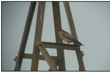
Red-necked Falcon, Chambal