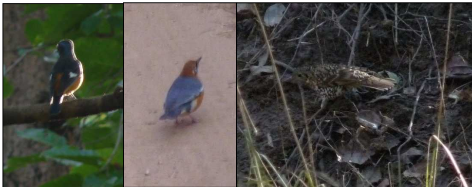
Documentation photos of the three exclusive thrushes seen in Kanha – Blue-capped Rock Thrush, Orange-headed Thrush and Scaly Thrush.