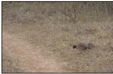
Painted Francolin, Panna