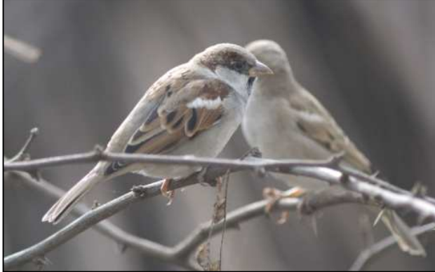
Ssp. parkini - larger - pale bill

*b. Ssp. parkini . 3/1 1 male near Chambal river, 27/1 1 male Dry flats S of Sultanpur Jheel, 15 (see photo) Bhindawas lake. Probably more widespread than our records indicates.