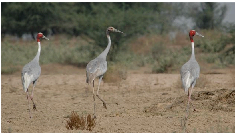
Sarus Crane family