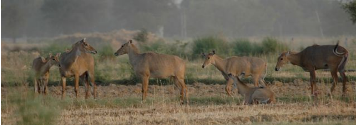
Nilgai (females and juveniles)

Jungle Cat Felis chaus - lovely views of one animal walking on the road but it only stopped to allow better views and photos when it stared at us from the safety of dense forest undergrowth.