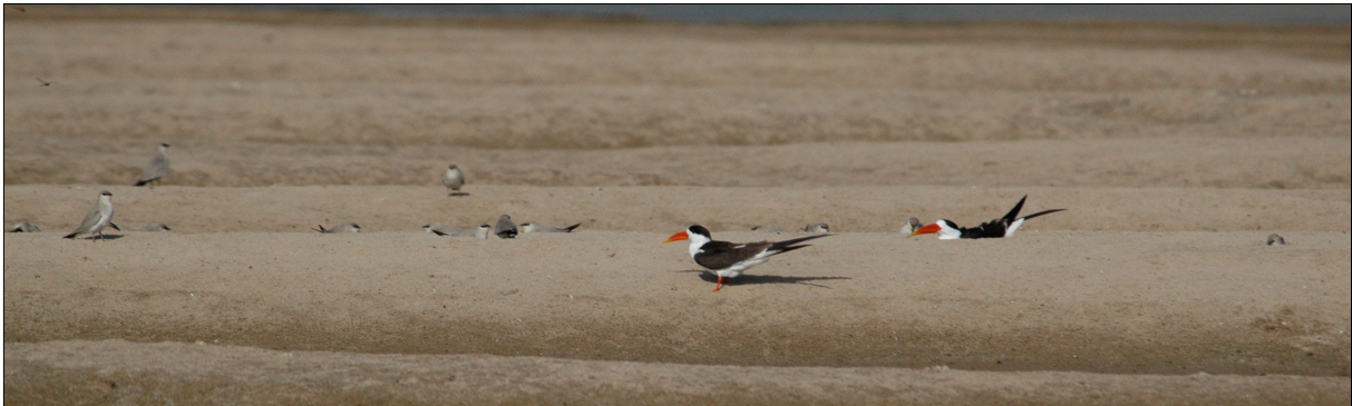
Indian Skimmers and Little Pratincoles breeding

Common Sandpiper Actitis hypoleucos - at least two at CHRS, several daily at BHP, only a few seen at Kanha Little Stint Calidris minuta - at least four at CHRS, also in fairly low numbers at BHP Temminck's Stint Calidris temminckii - at least two at CHRS, low numbers at BHP River Tern Sterna aurantia - low numbers (<10) at CHRS Little Tern Sterna albifrons - low numbers (<10) at CHRS Black-bellied Tern Sterna acuticauda - a few (3-4) at CHRS including two in adult plumage Curlew Sandpiper Calidris ferruginea - a few at CHRS Indian Skimmer Rynchops albicollis - a few (about 5-6) at CHRS, birds were breeding, no chicks yet