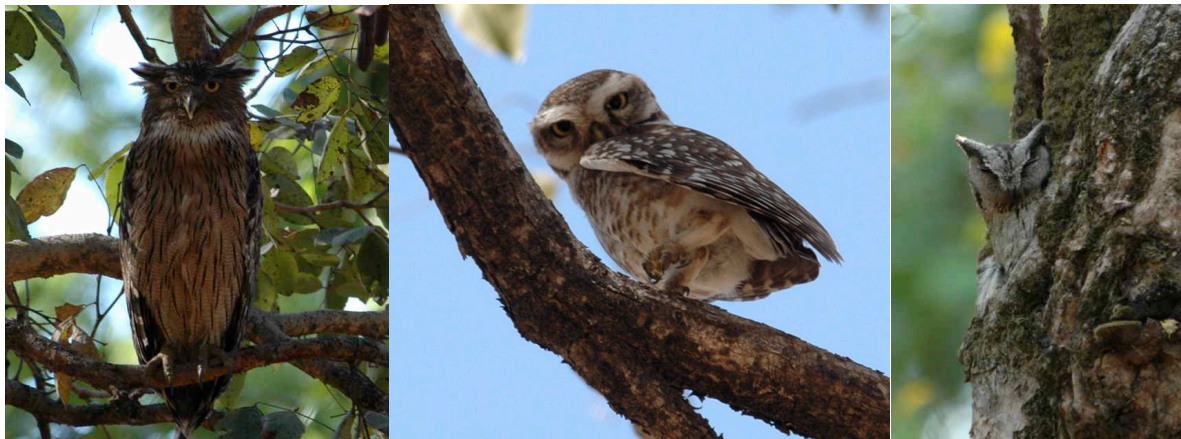
Brown Fish Owl

Brown Hawk Owl Ninox scutulata - dusk views on the descent from the Bhamani Dadar plateau in Kanha