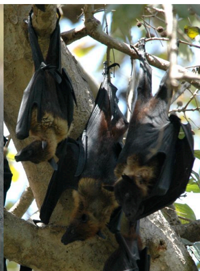
Indian Flying Fox