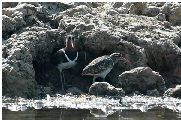
Greater Painted Snipe

Sarus Crane Grus antigone - a pair at SUL, a total of 7 at CHRS, between 2-6 daily at BHP Demoiselle Crane Anthropoides virgo - a single bird was only seen by my wife on our way back to Delhi White-breasted Waterhen Amaurornis phoenicurus - common at BHP Common Moorhen Gallinula chloropus - about 25 at SUL, common BHP Common Coot Fulica atra - quite common at BHP Purple Swampphen Porphyrio porphyrio -- about 20 at SUL, about 10-25 daily at BHP Pheasant-tailed Jacana Hydrophasianus chirurgus - at least 20 at BHP Bronze-winged Jacana Metopidius indicus - two birds on a pool near the village at CHL, about 20-30 at BHP Eurasian Thick-knee Burhinus oedicephalus - one seen and photographed in Kanha, two on dry steppe-like habitat near BHP Great Thick-knee Esacus recurvirostris - breeding in small numbers along the Chambal River, about 10-12 birds seen Black-winged Stilt Himantopus himantopus - about 9-10 at SUL Small Pratincole Glareola lactea - about 30-40 on islets in the Chambal River Kentish Plover Charadrius alexandrinus - about 20 at CHRS River Lapwing Vanellus duvaucelii - only at CHRS where common Yellow-wattled Lapwing Vanellus malarbaricus - only one seen well on fields just outside BHP, also seen en route between CHL and CHRS Red-wattled Lapwing Vanellus indicus - common Common Snipe Gallinago gallinago - one on an islet at CHRS Greater Painted Snipe Rostratula benghalensis - a couple on a rocky islet in the Chambal River