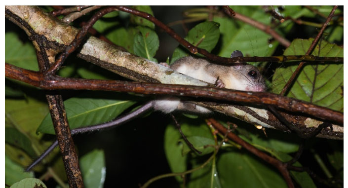
Indomalayan Pencil-tailed Tree Mouse