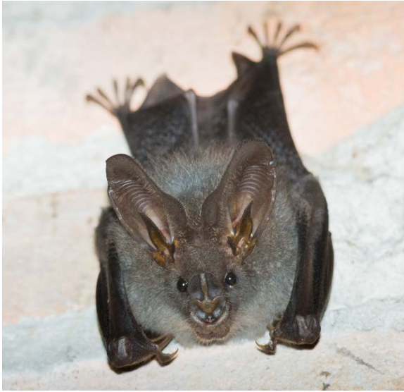
Lesser False Vampire