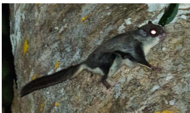
Temminck's Flying Squirrel