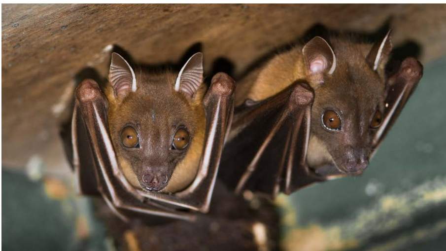
Forest Short-nosed Fruit Bat