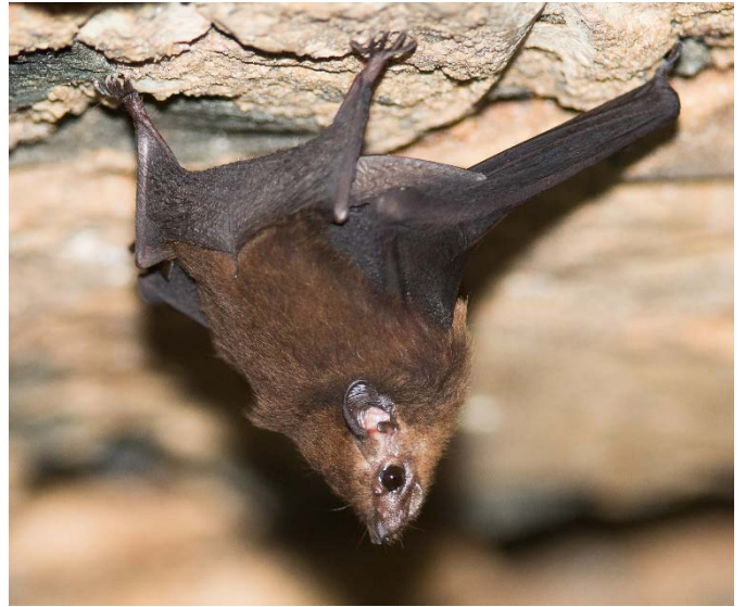
Small Asian Sheath-tailed Bat