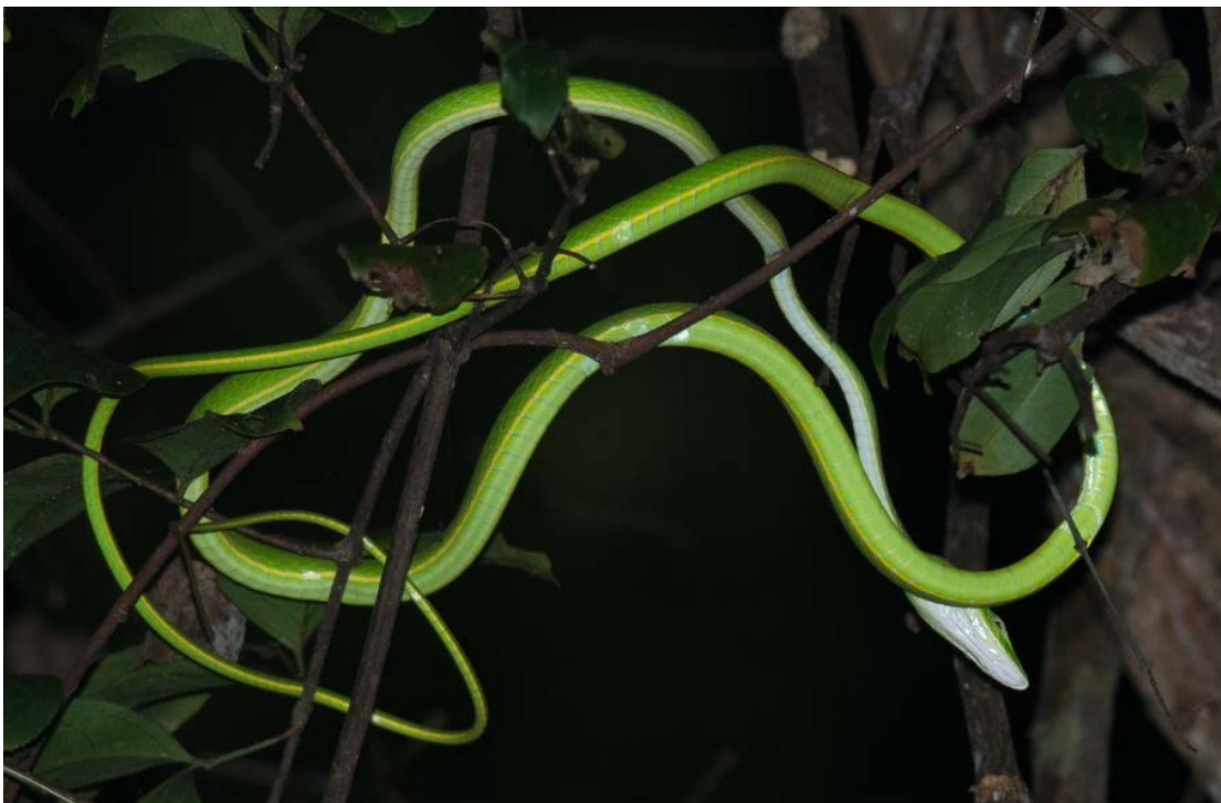
Oriental Vine Snake