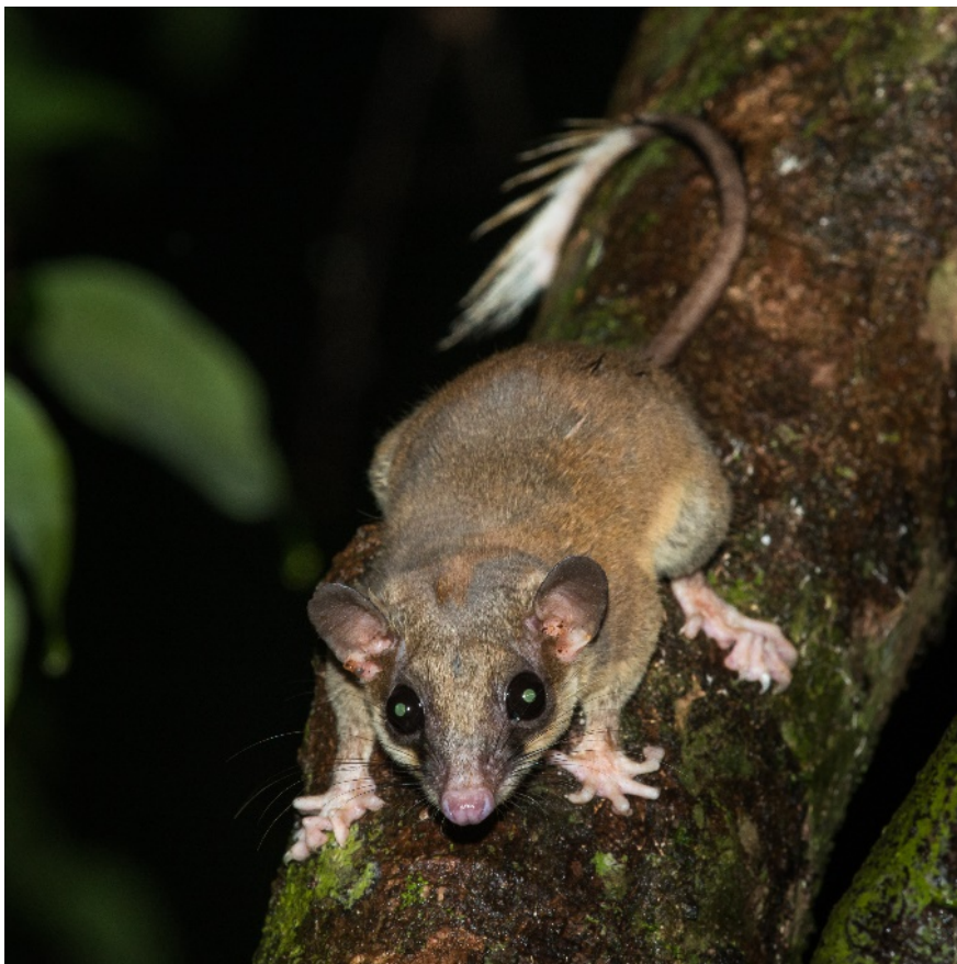
Pen-tailed Treeshrew (Feather-tailed Treeshrew)

10am I left Satwa for Bandar Lampung and returned to Jakarta.