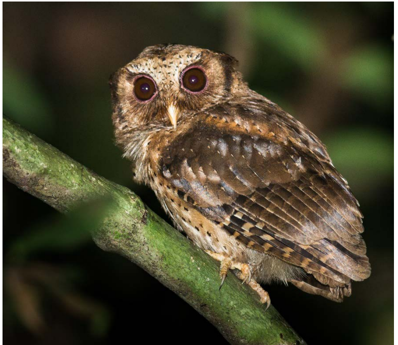
Reddish Scops Owl