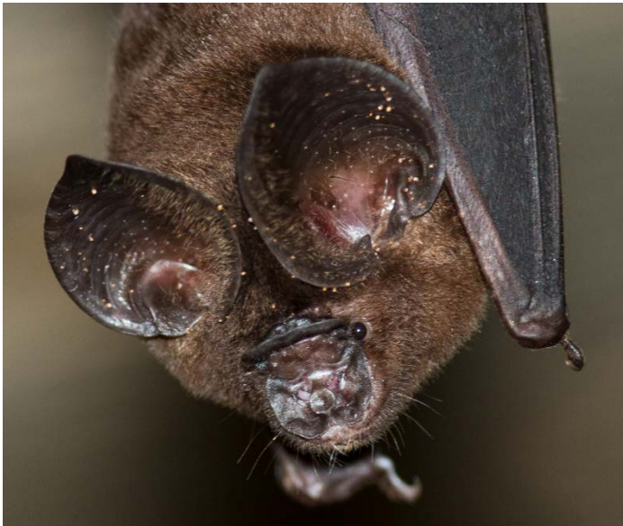
Orbiculus Leaf-nosed Bat (2 pics above)