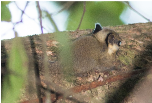
Black-eared Pygmy Squirrel (2 pics above)