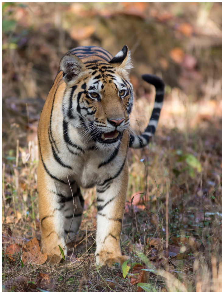
Above left: A subadult tiger curiously approaches the jeep