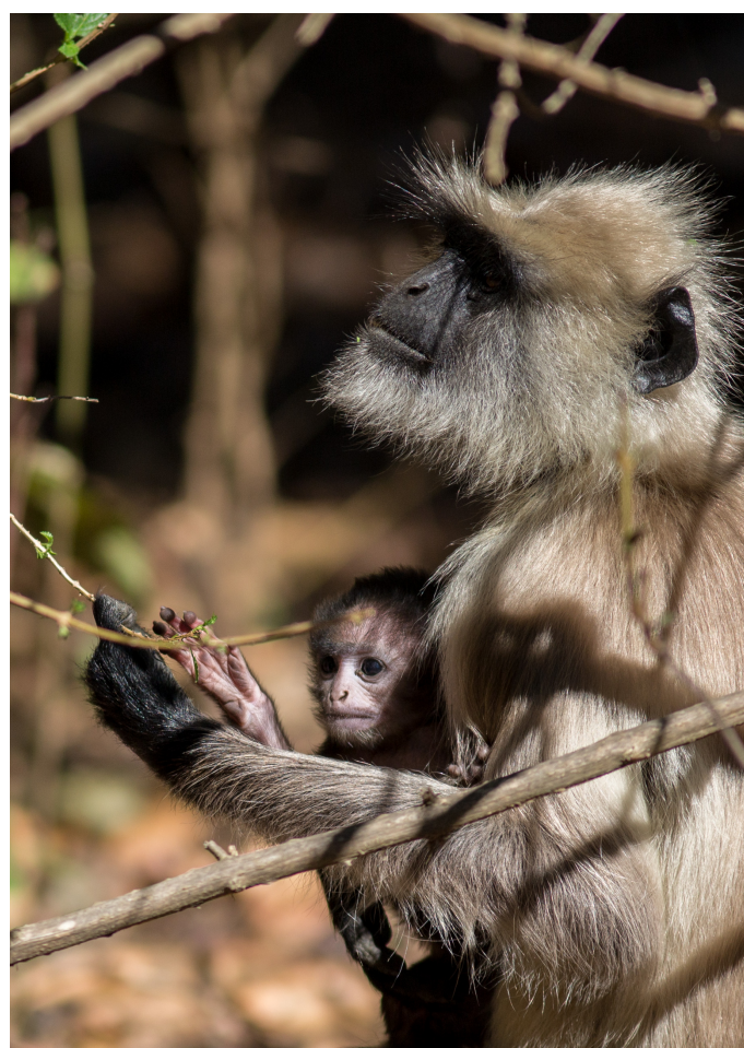
Above right: A baby langur investigates a stem