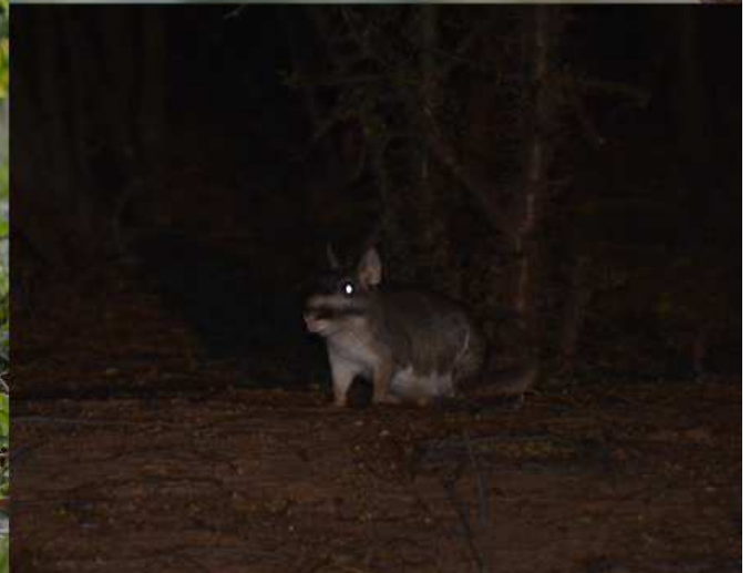
Grey Leaf-eared Mouse, Screaming Hairy Armadillo, Brazilian Guinea Pig, Nine-banded Armadillo, Southern Three-banded Armadillo, Black-horned Capuchin and Plains Viscacha.