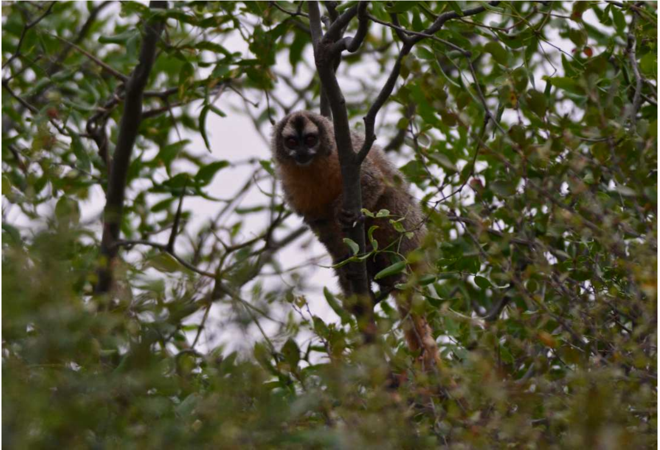
Azara's Night Monkey.

Grassland Yellow-Finch 12 , Wedge-tailed Grass-Finch 1 , Blue-black Grassquit 19 , Plumbeous Seed-eater 14 , Red-crested Finch 2 , Black-throated Saltator 2 , Grassland Sparrow 20 , Chopi Blackbird 40 , Yellow-rumped Marshbird 1 , Screaming Cowbird 8 , Variable Oriole 5. Black Tegu 1 , Four-toed Whiptail Lizard 1 , Rococo Toad 1.