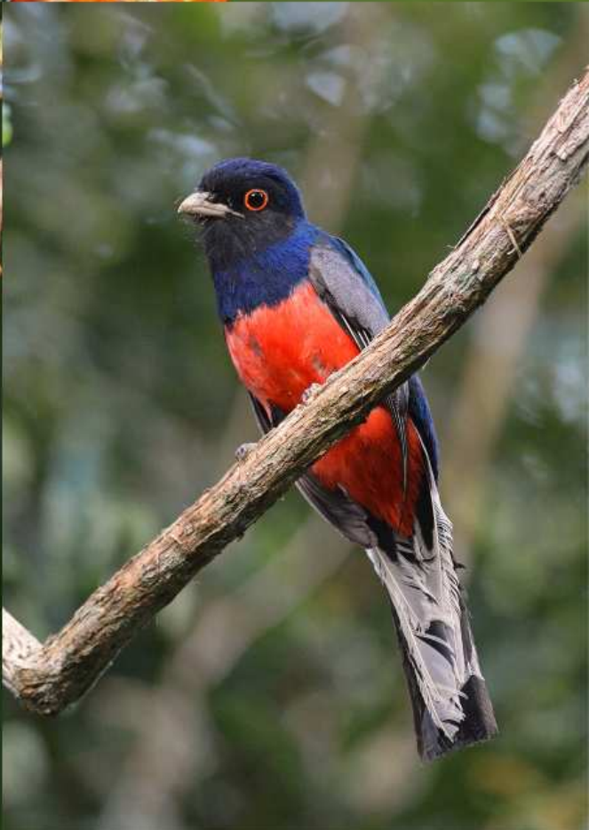
Violaceous Euphonia, Violet-capped Woodnymph, Blue Manakin, Glittering-bellied Emerald and Surucua Trogon.