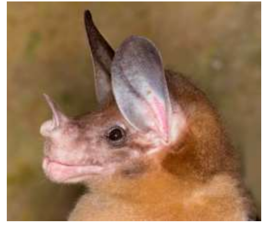
Great False Vampire or Spectral Bat

paths. I set up two nets on the shorter and more stable bridges while Jose set one over the long and very wobbly bridge. Of course I was the one stuck on the bridge untangling a small hummingbird on the scary bridge later that night! At first it seemed like a bit of a bust as we caught only Jamaican and Great Fruit-eating Bats , but a bit later we got our second Great False Vampire and our second Wrinkle-faced Bat . Two very rare species twice in one trip!