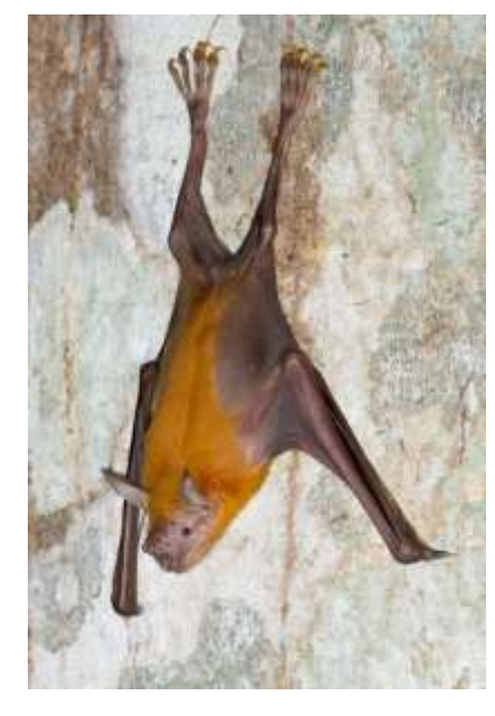
Greater Fishing Bat hanging out

On my way to and from the bridge I had a close encounter with a Gray Four-eyed Opossum , also seen by the others, and we all saw a number of Tomes' Spiny Rats which we managed to trap that night. During our two days we had great views of all