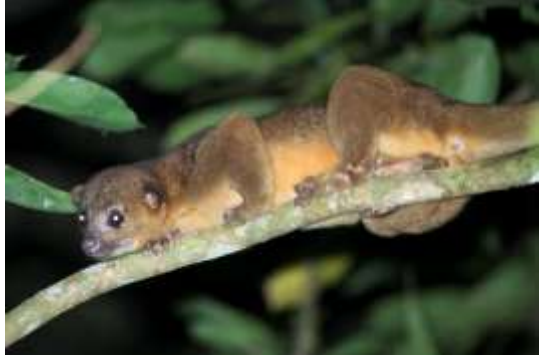
Kinkajou from canopy walk

Feb 09-10, Rio Papaturro and Los Guatusos (LG)