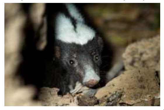
Striped Hog-nosed Skunk (Paul Carter)

We set off in the morning for Playa Coco, about 2 hours south. We were really happy with our upscale condo and huge deserted beach! After some free time a late lunch, we had a very close visit with Mantled Howlers and a Ferruginous Pygmy Owl beside our condo. We then headed to a private reserve at Escamequita (Jose had arranged permission for us to enter at night).