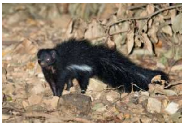
Hooded Skunk (Paul Carter)

scented pool and two over cool pools in the river bed. The guys left me thinking I'd be able to relax (cold beer, warm pool...), but very soon bats started hitting the nets, and from 6 to 8 p.m. I