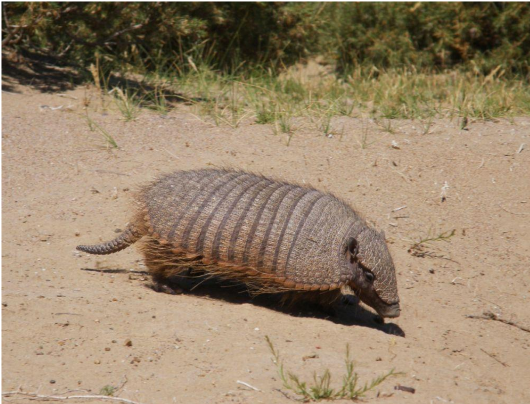
Larger Hairy Armadillo

Nov 9. Visit to Punta Cantor and Caleta Valdés for Elephant Seals, then north to Punta Norte, exploring central and northern parts of the peninsula. A Larger Hairy Armadillo put on a great show for us. In the afternoon we drove south to Gaiman with a stop at Isla de los Pájaros en route. We stayed 2 nights at the lovely Los Mimbres, a chacra on the edge of Gaiman.