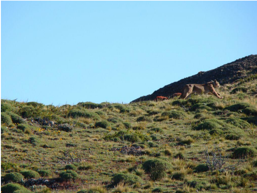
A Puma on the move