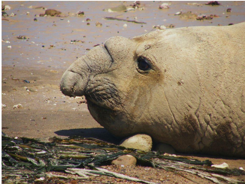
Young male Southern Elephant Seal

Nov 10. We drove to Playa Union and took a boat trip to see Commerson's Dolphin. The dolphins were very active, bowriding and jumping. A few Southern Sea Lions were seen at the harbor. We had a picnic lunch at an Elephant Seal rookery at Isla Escondida en route via the gravel road to Punta Tombo. Visit to penguin colony at Punta Tombo, where we got very close looks at Elegant Crested Tinamou, Darwin's Rhea and Guanacos, as well as the ½ million Magellanic Penguins. Night walk back at Los Mimbres yielded many European Hares but no other mammals.