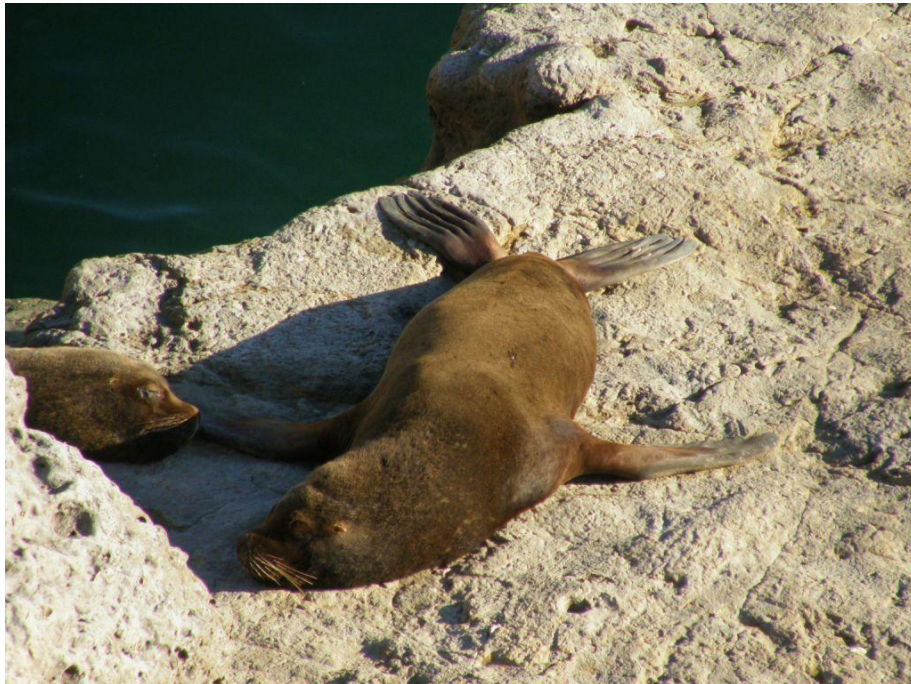
Southern Sea Lion sprawled

Punta Loma. Here we also had excellent views of Cuis, a small cavy, and breeding Rock Shags. We continued on to Puerto Pirámides for 2 nights, with our first views of Right Whales in the gulf. Night walk at Pirámides.