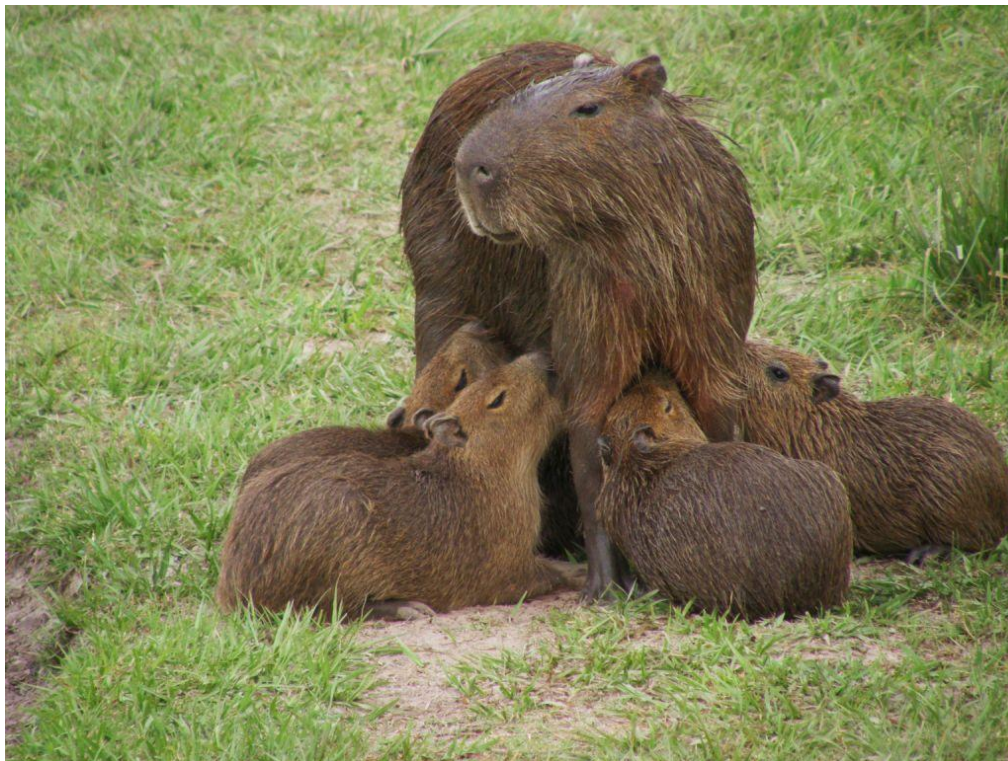
Capybara with young