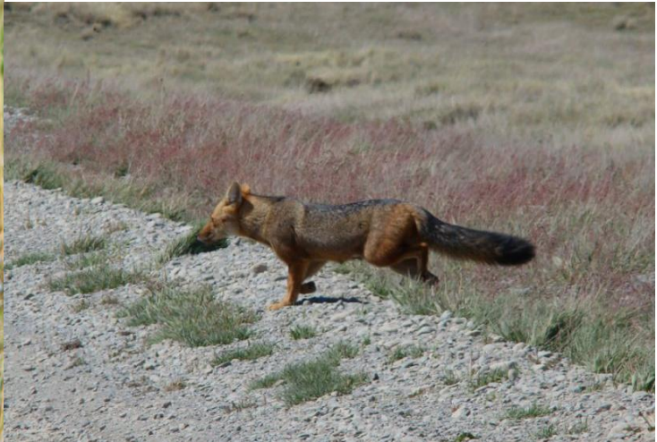
Culpeo or Red Fox

Nov 13. Very early start in search of Pumas and other wildlife. Visit to Lago Sarmiento Mirador del Lago Nordenskjold, and Salto Grande at Lago Pehoé. Picnic lunch at Lago Grey. On the way back, Regina spotted a Huemul at Salto Chico, Rio Paine, near the camping area of Lago Pehoe and we were able to approach very closely. We also saw our first Culpeo hunting in an open area. José located 3 Pumas in mid afternoon on conglomerate rock behind Laguna Amarga, which we watched for an hour or more, resting among large boulders by a cliff-edge. On return to Las Torres we went out after dinner to inspect the dead horse above lodge, but saw no activity.