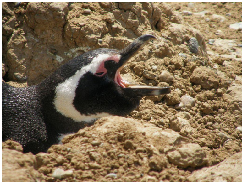
Magellanic Penguin after a long day