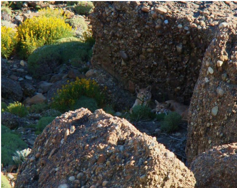
Two Pumas resting amongst conglomerate rock boulders

Nov 14. Four of group hiked up trail toward Torres. A Coypu was seen by some of the group. Others walked with José to forest and streams around our hotel. We had great views of Chilean Flicker, Thorn-tailed Rayadito and other birds. We stopped to visit the dead horse and noticed Puma activity since our evening visit. Lunch at the hotel. Our afternoon outing was to Laguna Azul, with a stop at Cascada Paine. We took a walk in forest which had suffered from a fire, and saw Austral Pygmy Owl and the small Gray Four-eyed Frog. On return we saw a Piche