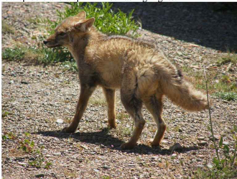
Chilla in the wind

Nov 8. Morning trip to southern part of Valdés Peninsula with views of Red-backed Hawk, Mara, and Guanacos en route, and visit to Elephant Seal rookery at Punta Delgada. Watched Guanacos and Maras en route. Afternoon boat trip in Golfo Nuevo to see Southern Right Whales, with excellent close views of mothers and calves. Late afternoon visit to Sea Lion rookery at Punta Pirámides, with Snowy Sheathbill and other water birds present. Night walk at Pirámides with a few spiders and a sphinx moth as highlights.