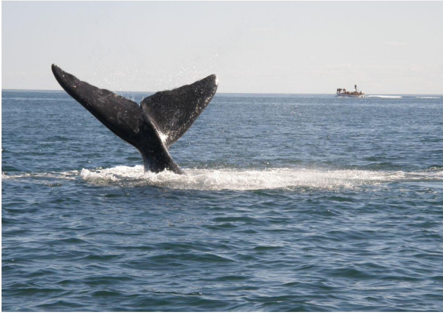
Southern Right Whale

Nov 9. Visit to Punta Cantor and Caleta Valdés for Elephant Seals, then north to Punta Norte, exploring central and northern parts of the peninsula. A Larger Hairy Armadillo put on a great show for us. In the afternoon we drove south to Gaiman with a stop at Isla de los Pájaros en route. We stayed 2 nights at the lovely Los Mimbres, a chacra on the edge of Gaiman.