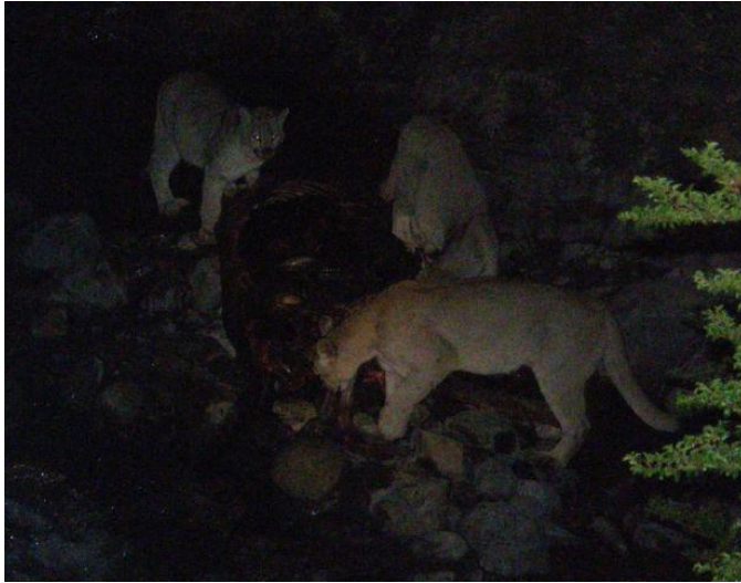
Pumas feeding on a dead horse

Armadillo in Estancia Goic, between Laguna Azul and Laguna Amarga, and later we stopped to check on Puma site from previous day (but they were absent). On return to hotel at about 7:30 p.m. we paid another visit to the dead horse. One puma was glimpsed walking into the brush, but there was too much disturbance from over-zealous NG photographers and noisy hotel staff.