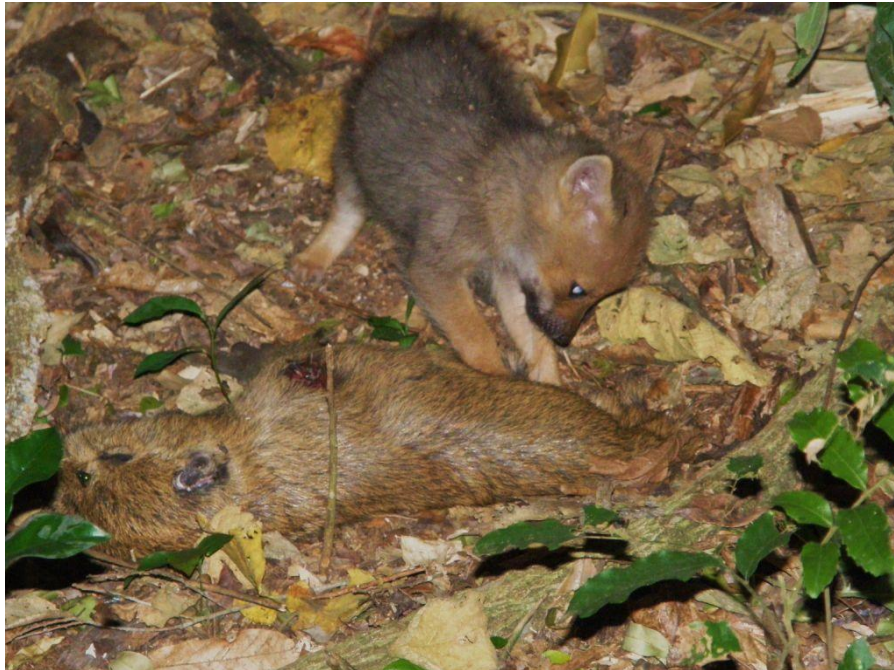
Chilla Fox cub and the fate of a young Capybara

Nov 4. Our morning boat trip on small lake on estancia property was good for birds, including Least Bittern and Azure Gallinule. We saw a Black-chested Buzzard-Eagle at its nest near the lake and also spotted the two caiman species sunning. We caught two species of Piranha in the lake. Afternoon visit to grassland and forest patch for Black and Gold Howlers. The forest was littered with armadillo burrows but we didn't see any animals emerge, due to dry conditions. Night walk near main estancia buildings.