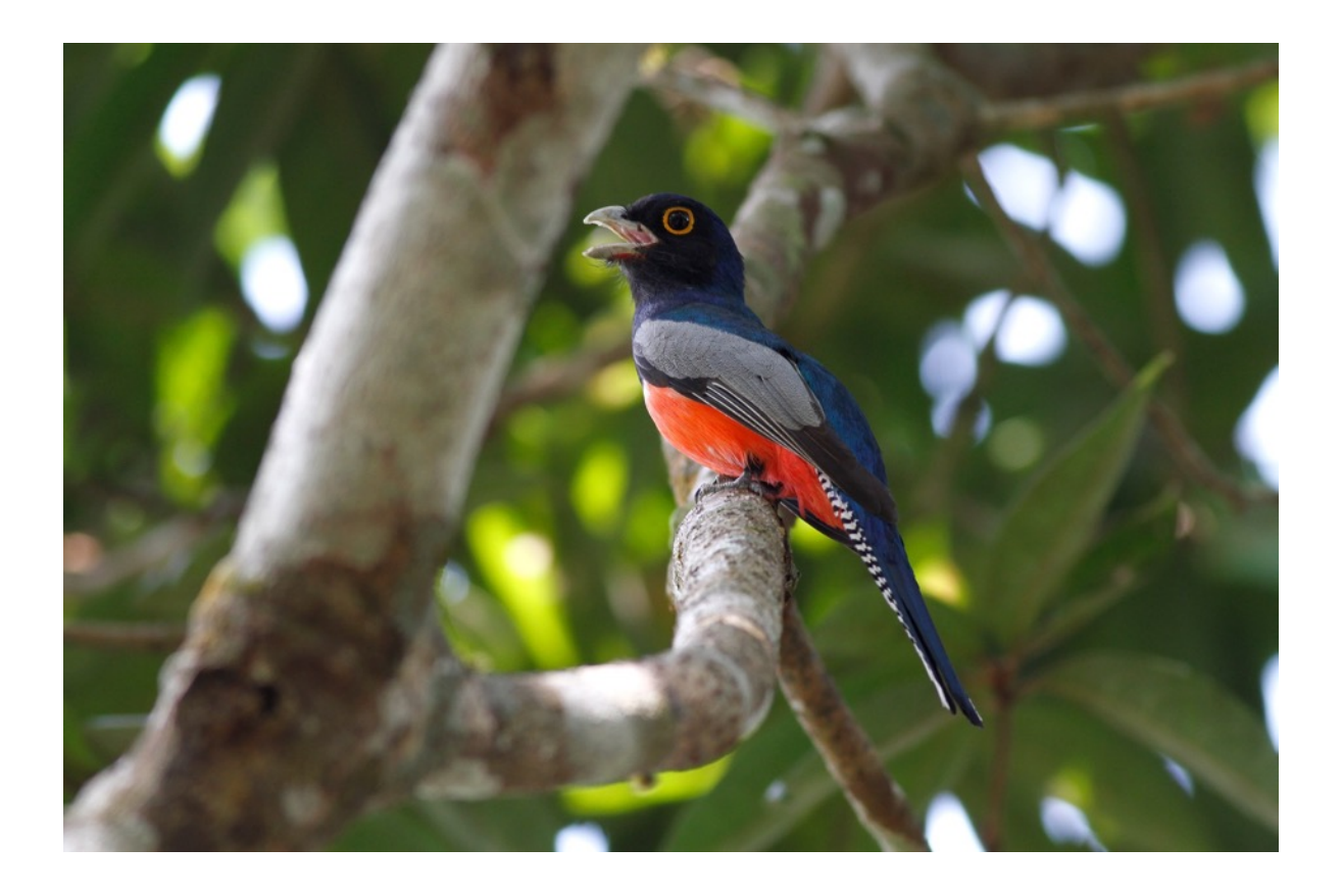
Blue-crowned Trogon (above) and Toco Toucan (below)