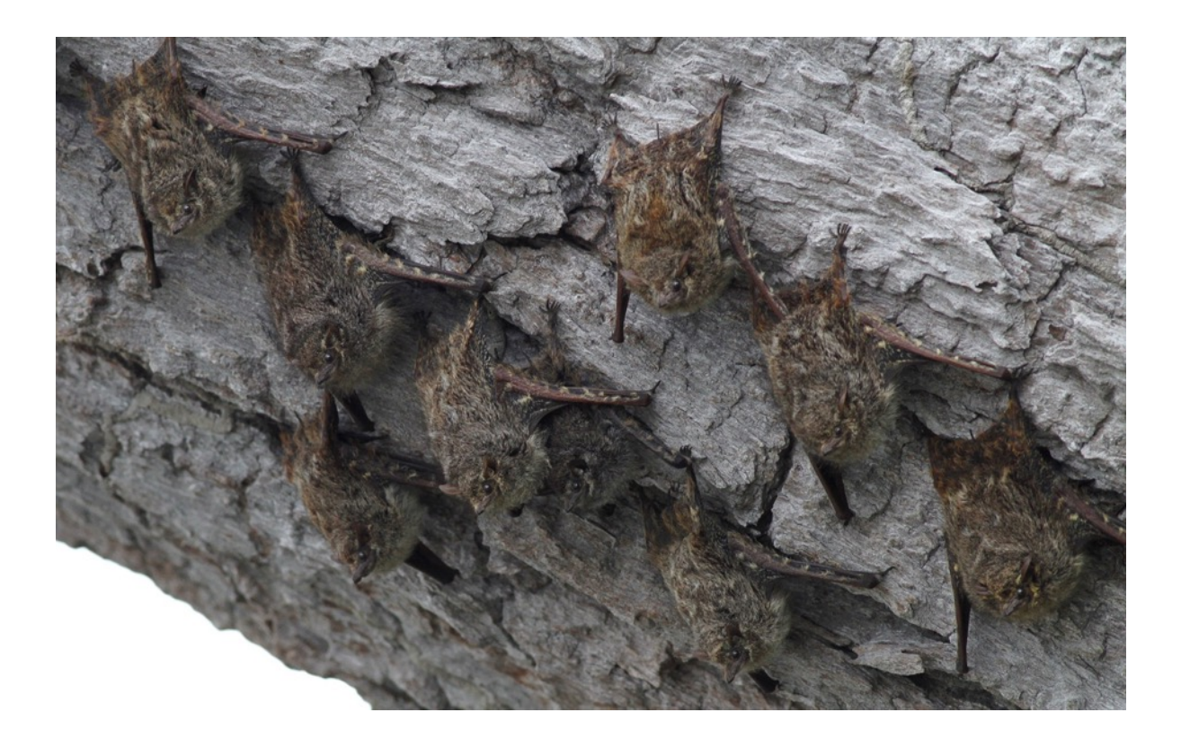
Long-nosed Bats (above) and Band-tailed Antbird (below)