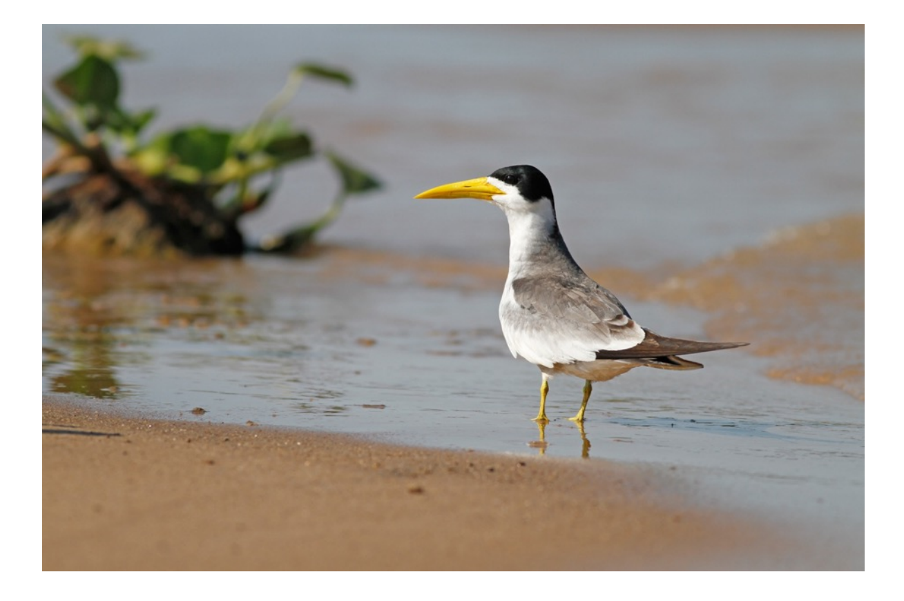
Large-billed Tern (above) and Yellow-billed Tern (below)