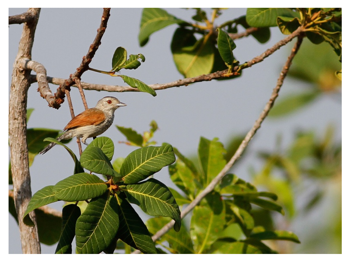
Rufous-winged Antshrike (above) and Collared Crescentchest (below)