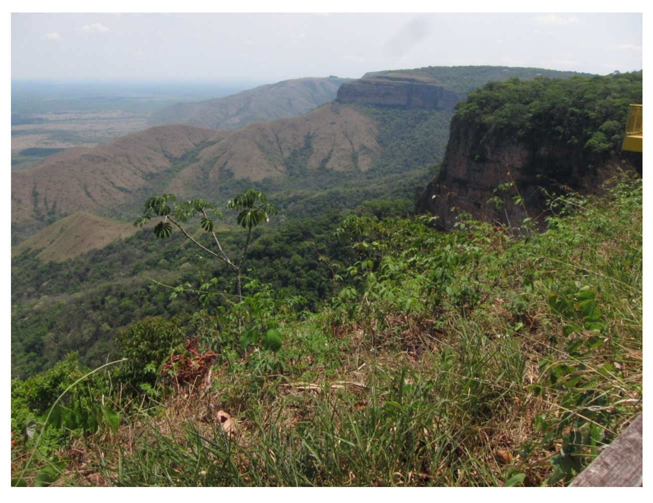
Chapada dos Guimaraes looking towards the Pantanal (above) and Burrowing Owl (below)