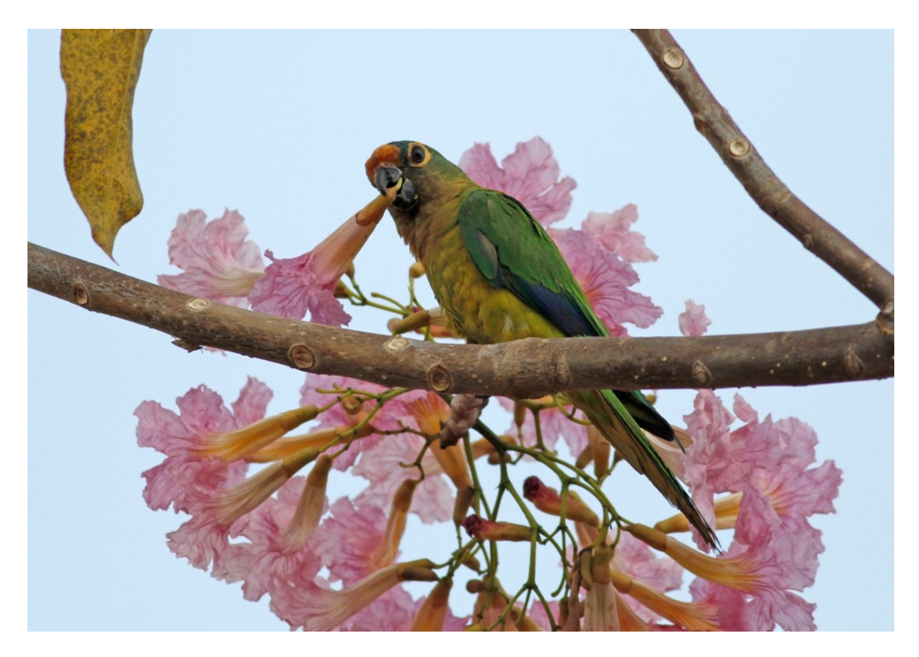
Peach-fronted Parakeet (above) and Horned Sungem (below)