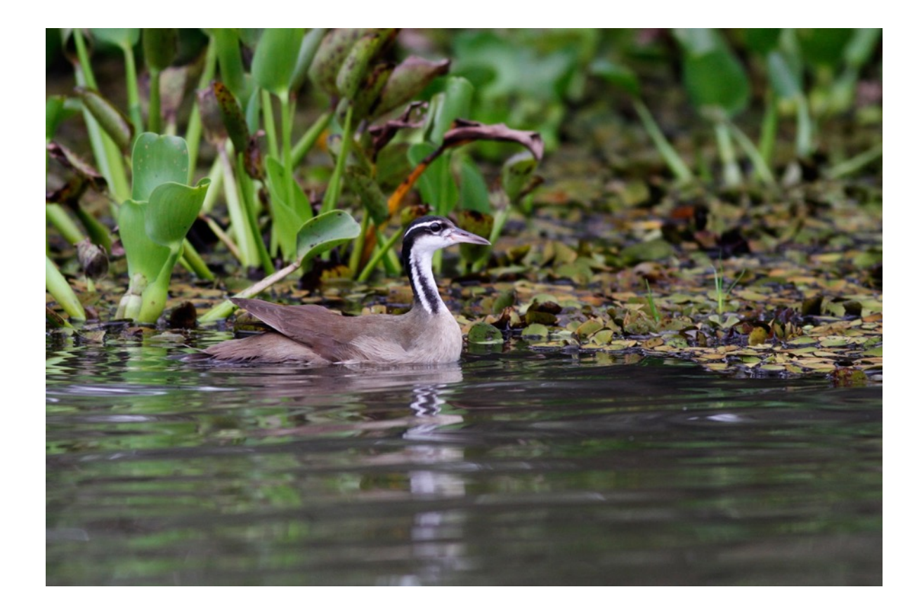
Male Sungrebe (above) and Brazilian Tapir (below)