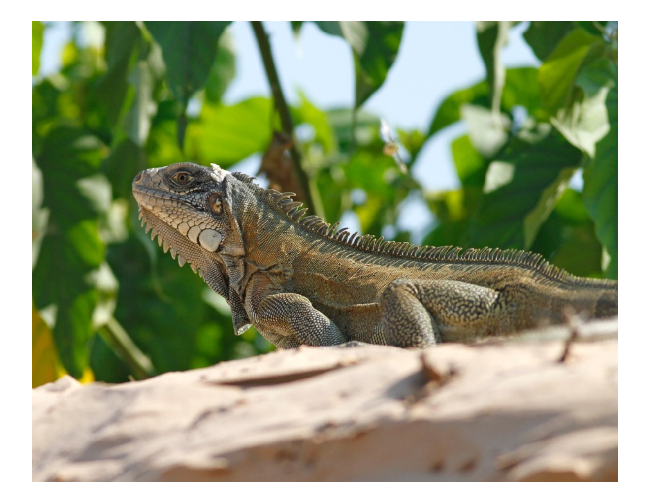
Green Iguana (above) and Pantanal Caiman (below)