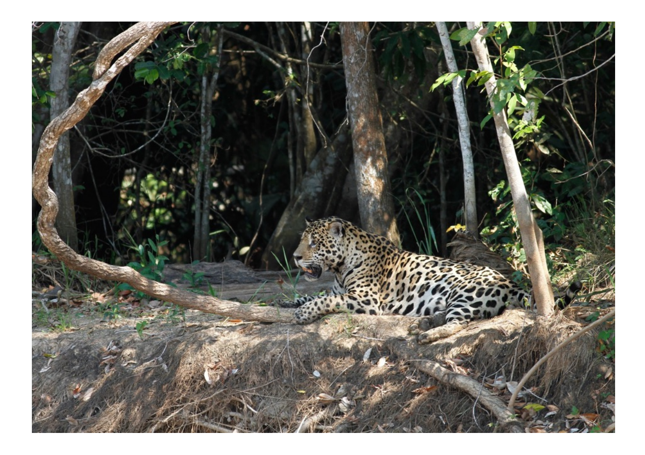
Another male Jaguar (above) and a swimming female (below)