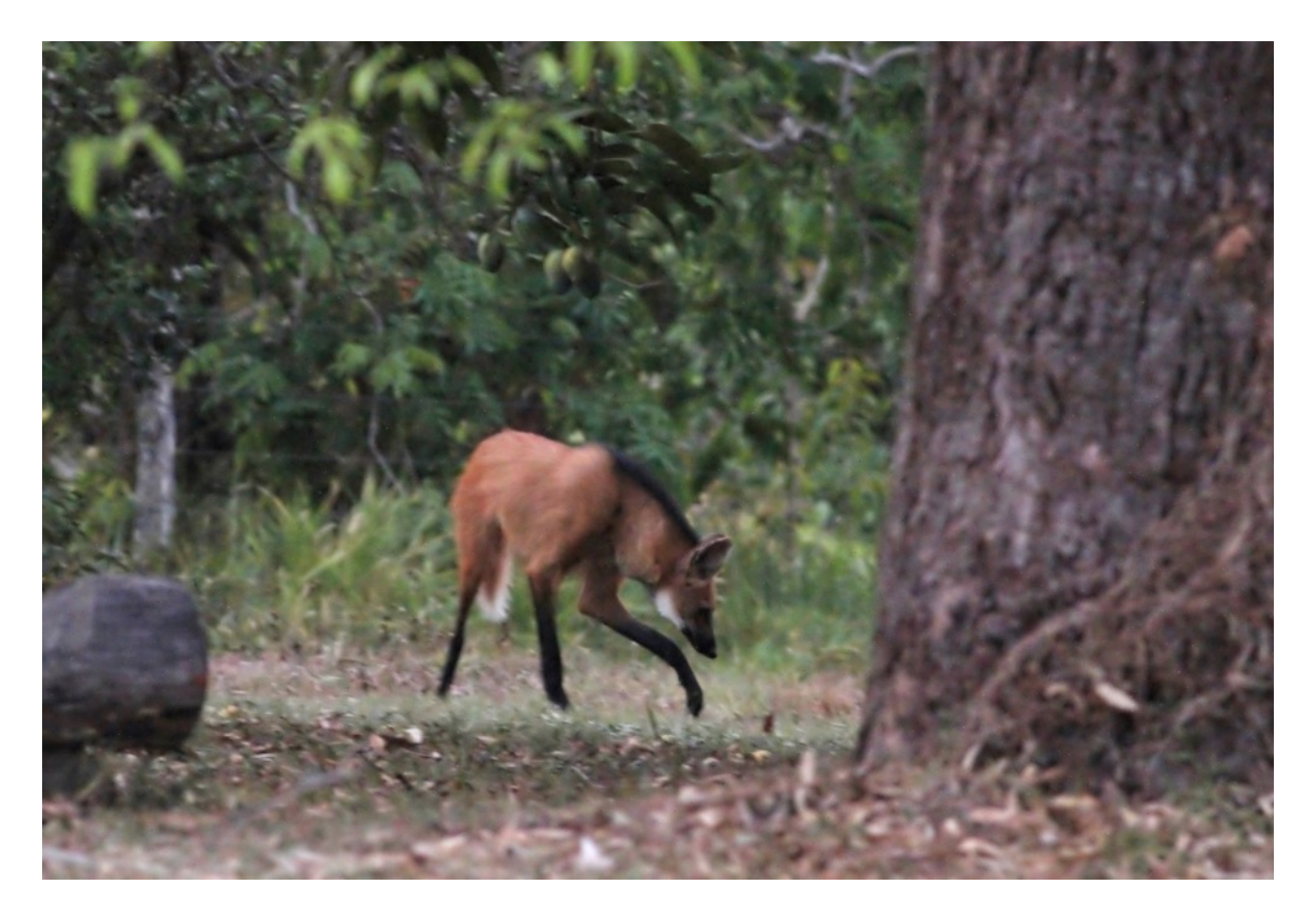
This superb Maned Wolf was one of the tour highlights