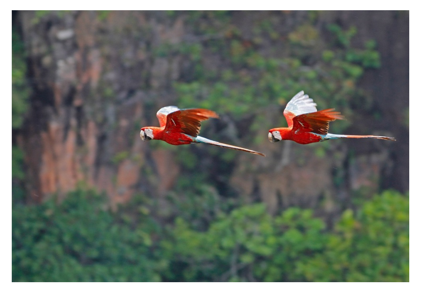
Red-and-Green Macaws (above) and Band-tailed Manakin (below)