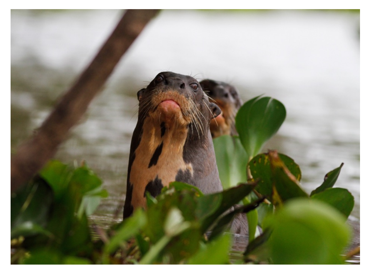
One of many Giant River Otters seen (above) and Giant Anteater on our last morning (below)