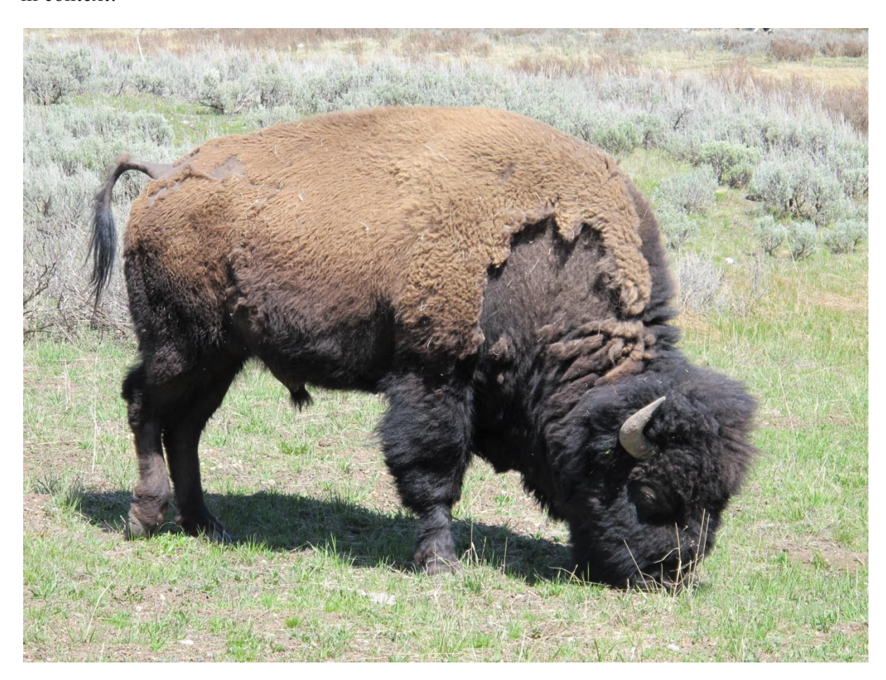
American Bison, Blacktail Plateau, Yellowstone National Park..

group of about twenty just before Madison but, turning the corner towards Norris, I came across my first truly vast herd – some three hundred or more beasts – which rather put things in context!