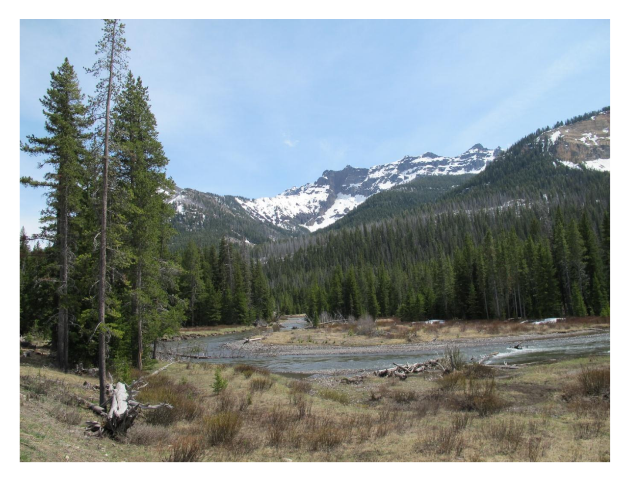
Soda Butte Creek, Yellowstone National Park

- In Search of Wolves, Badgers and Other Elusive Mammals of the American North-west