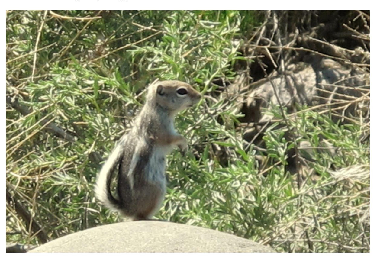
White-tailed Antelope Squirrel, near Marsing.