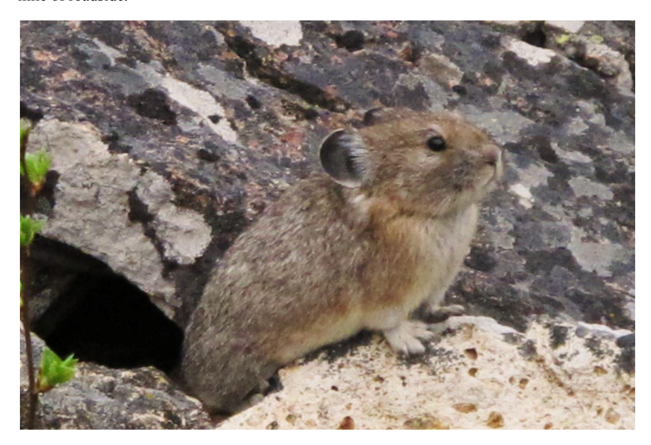
American Pika, Hellroaring Trailhead, Yellowstone National Park.

Driving back towards the wildlife zone, I found a Golden-mantled Ground Squirrel at Beryl Spring, (a steaming natural Jacuzzi). And back at Swan Lake, another big crowd had gathered to watch the three Grizzlies who were still hanging around. This time they were much closer, (about one hundred yards), and I half expected the rangers, (who were busy directing traffic), to move people back to the opposite side of the road. The crowd was increasing all the time and when I left some seventy vehicles were in attendance, stretched out over about half a mile of roadside.