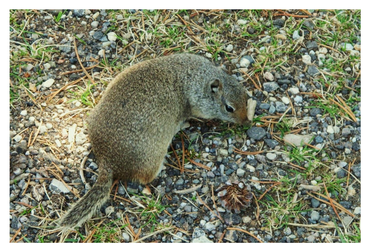
Uinta Ground Squirrel, Madison River, Yellowstone National Park.