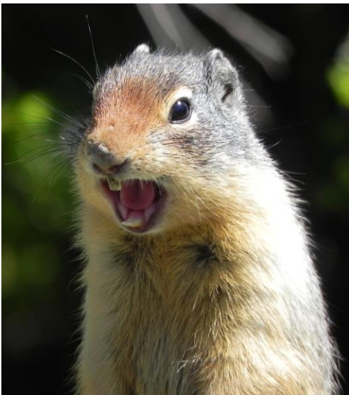
Columbian Ground Squirrel