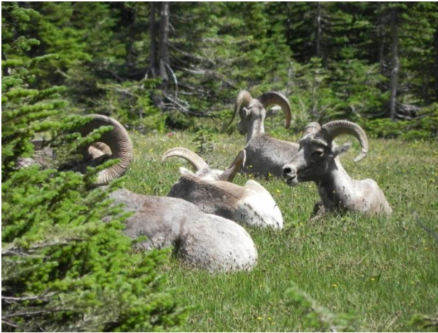
Big Horn Sheep

July 21, 2013: We hiked up to Avalanche Lake looking for Red-tailed Chipmunks. I saw a Red Squirrel at the beginning of the trail. On the way up to the lake it was very quiet. We saw nothing. Right as you get to the lake there is a pile of logs at the edge of the lake. We had not seen the first sign of a chipmunk. My wife reached into her bag and pull out a granola bar. As soon as she opened the wrapper two Red-tailed Chipmunks came running over to her. They had obviously heard that sound before. They were all over the trail around the lake.