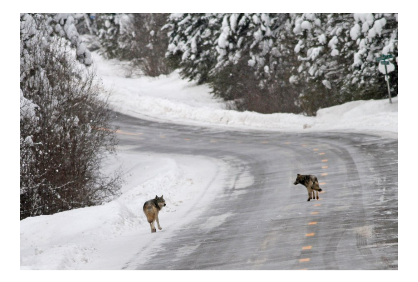
Our first view of the Wolves (above) and one of the quiet roads we patrolled regularly for mammals (below)