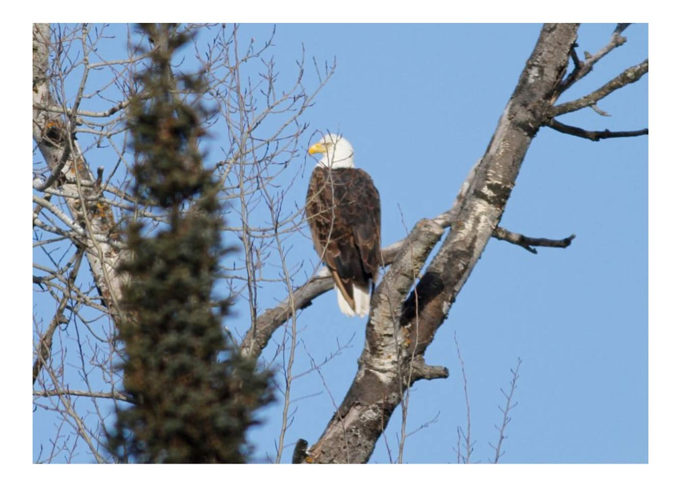
Adult Bald Eagle(above) and female Evening Grosbeak (below)