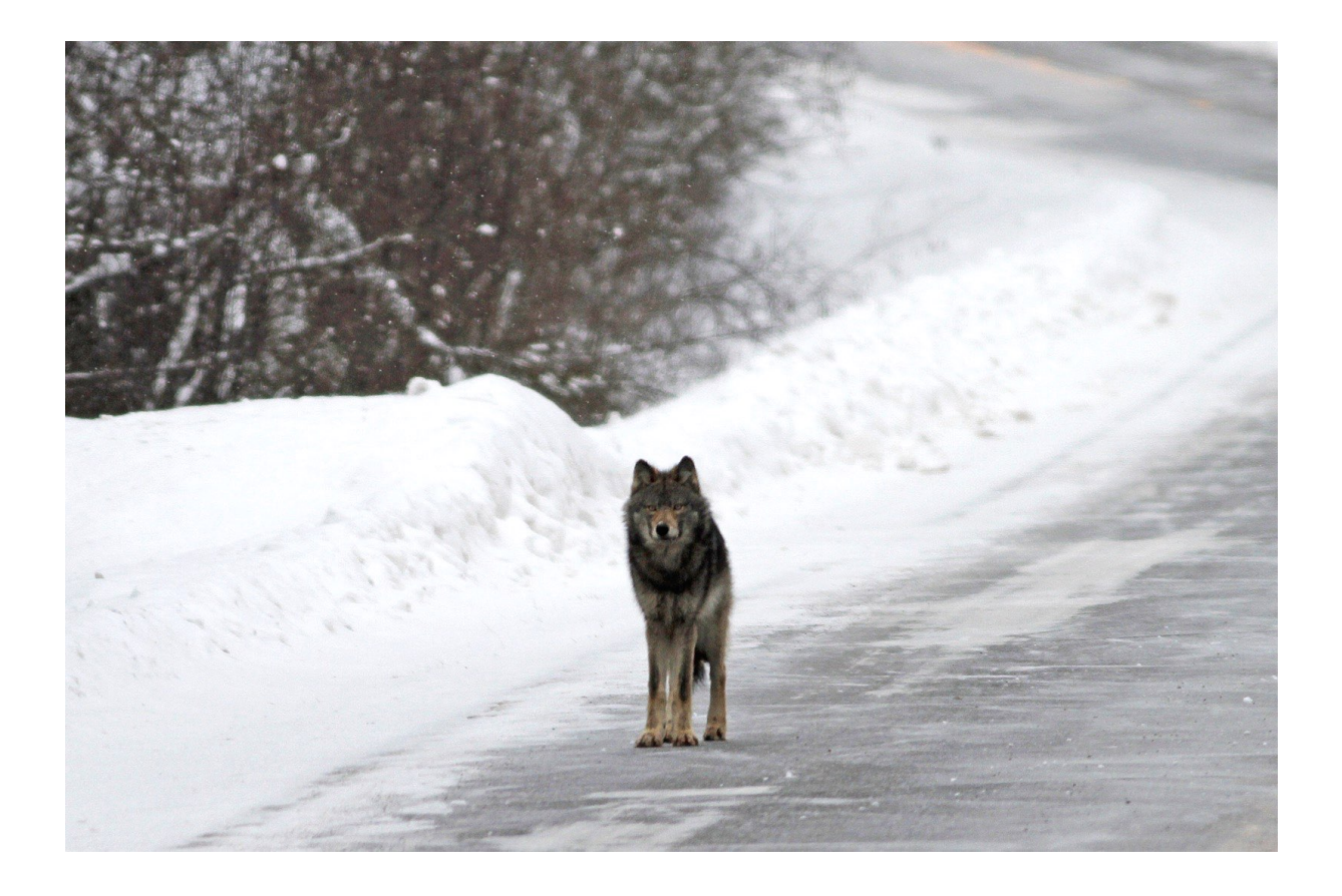
These two Wolves were one of the trip highlights as we watched them for about 15 minutes en route to our lunch stop