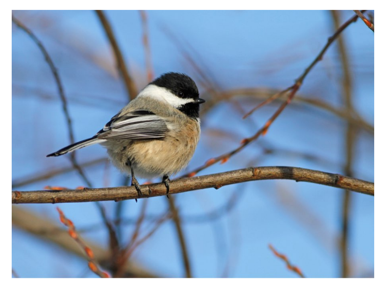
Black-capped Chickadee (above) and Boreal Chickadee (below)