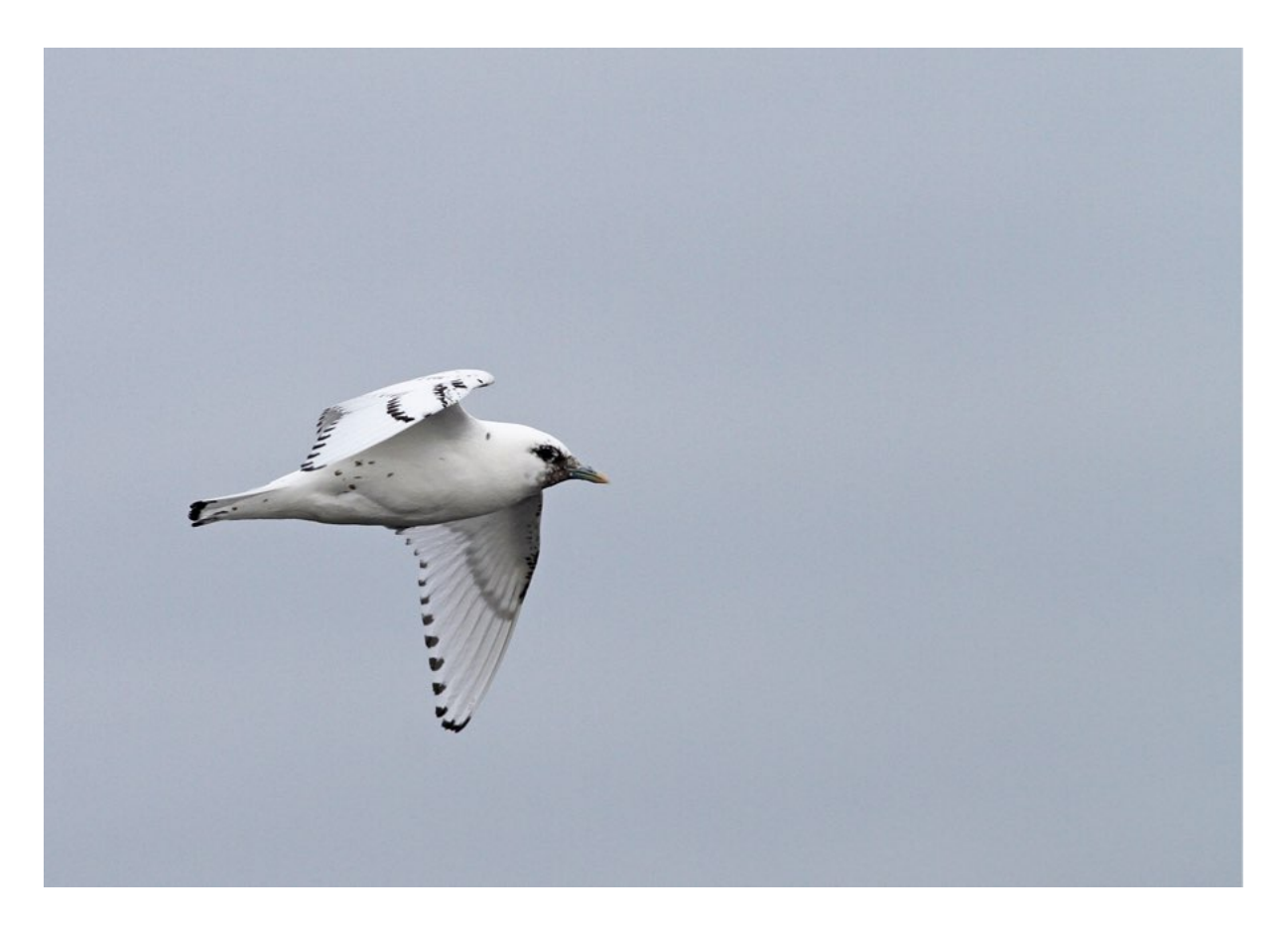
This 1st winter Ivory Gull in Duluth was a long staying rarity and showed down to a couple of metres!