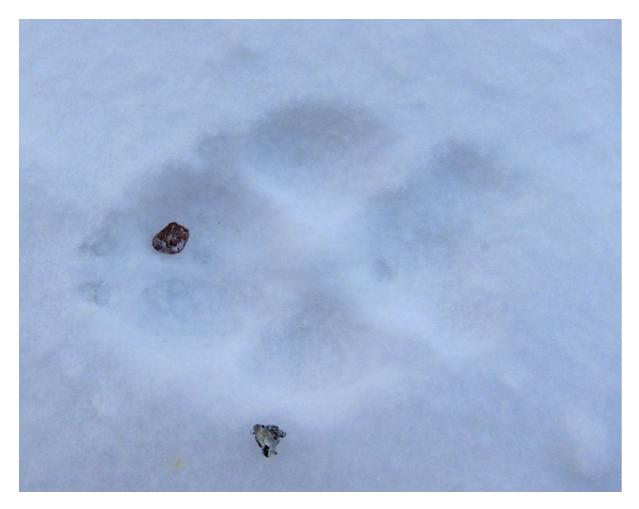
Wolf print (above) and Canadian Lynx prints (below)