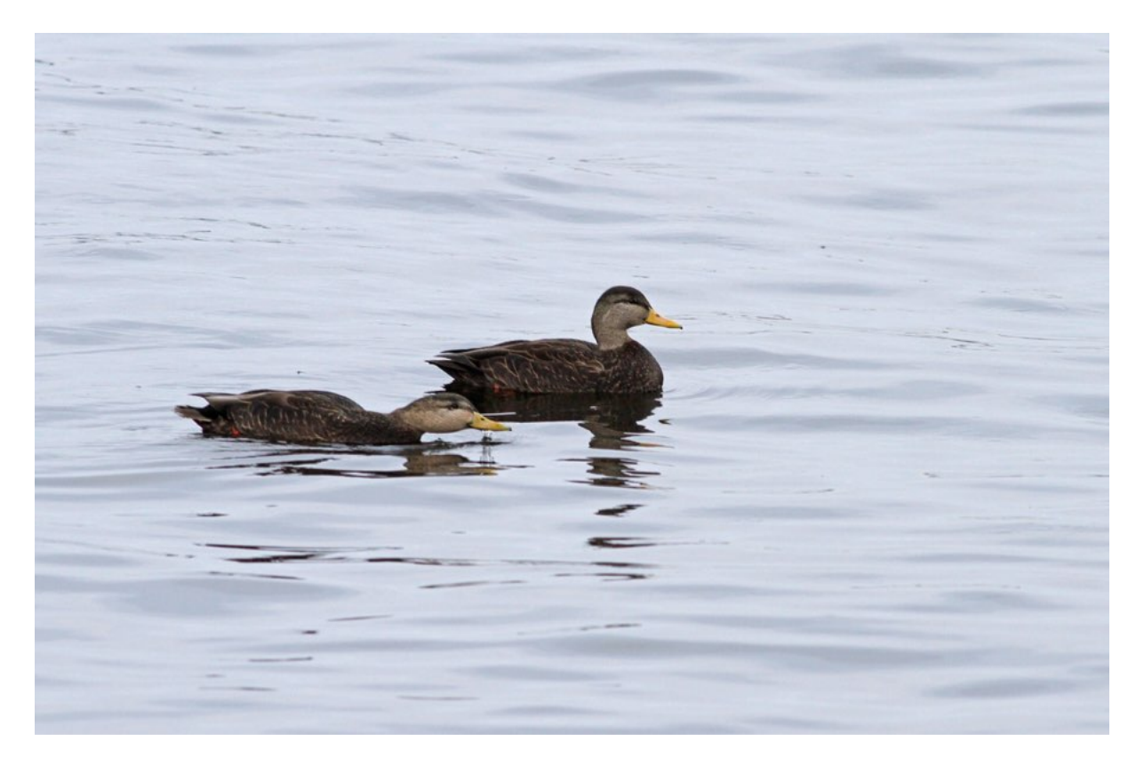
American Black Ducks (above) and 1st year Arctic (American) Herring Gull (below)