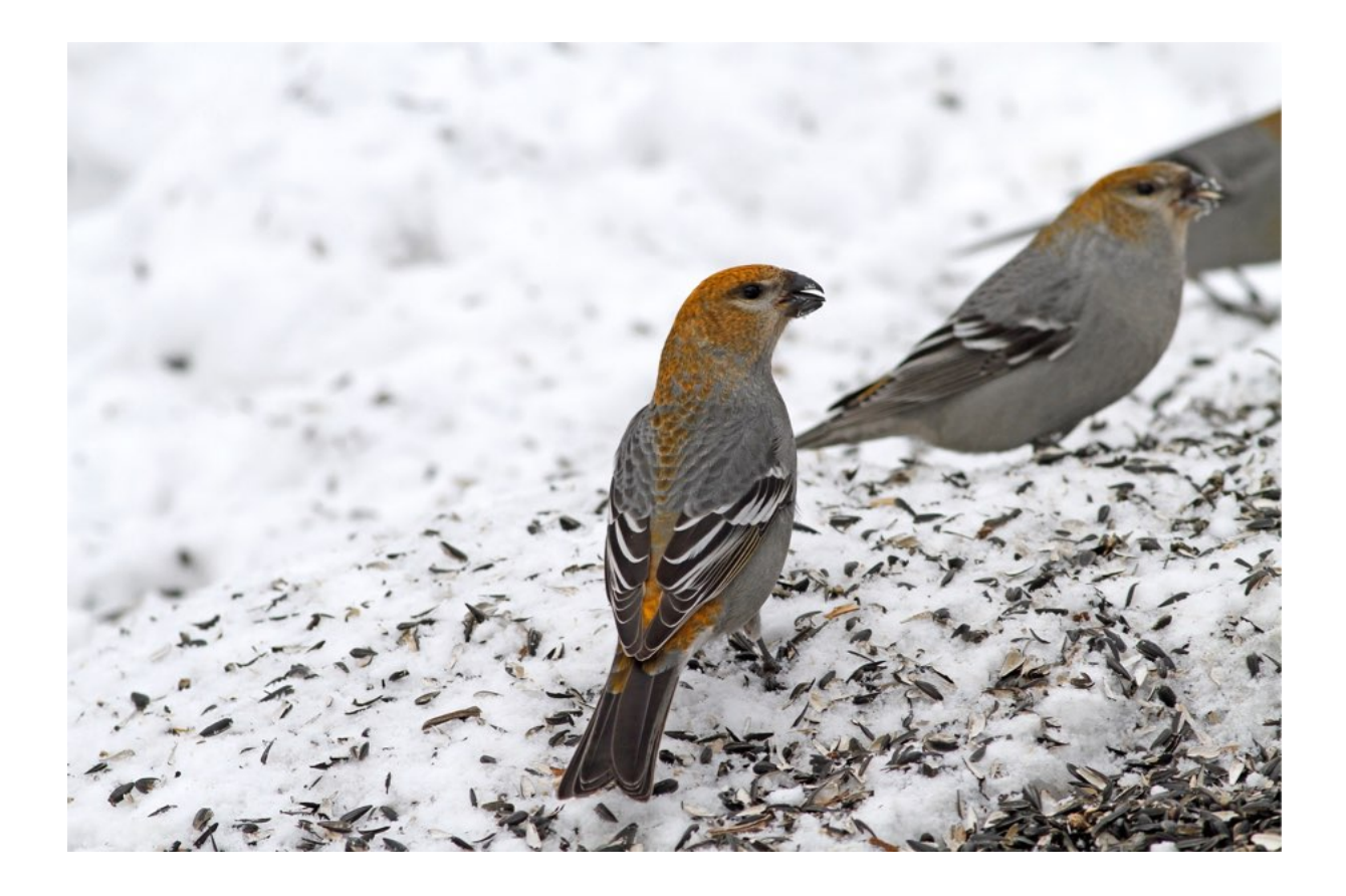
Pine Grosbeaks were certainly one of the bird highlights of this tour