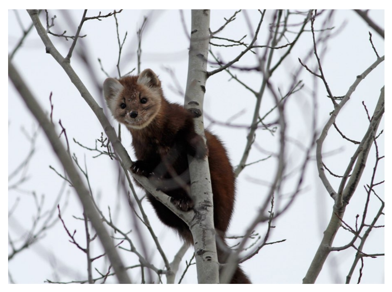
This American Marten showed very well on our first full day