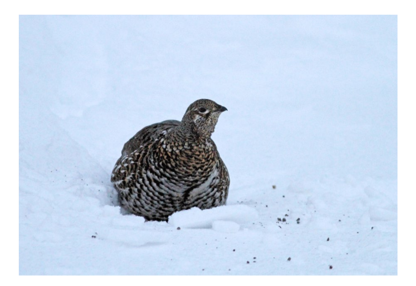
Female Spruce Grouse (above) and Grey Jay (below)