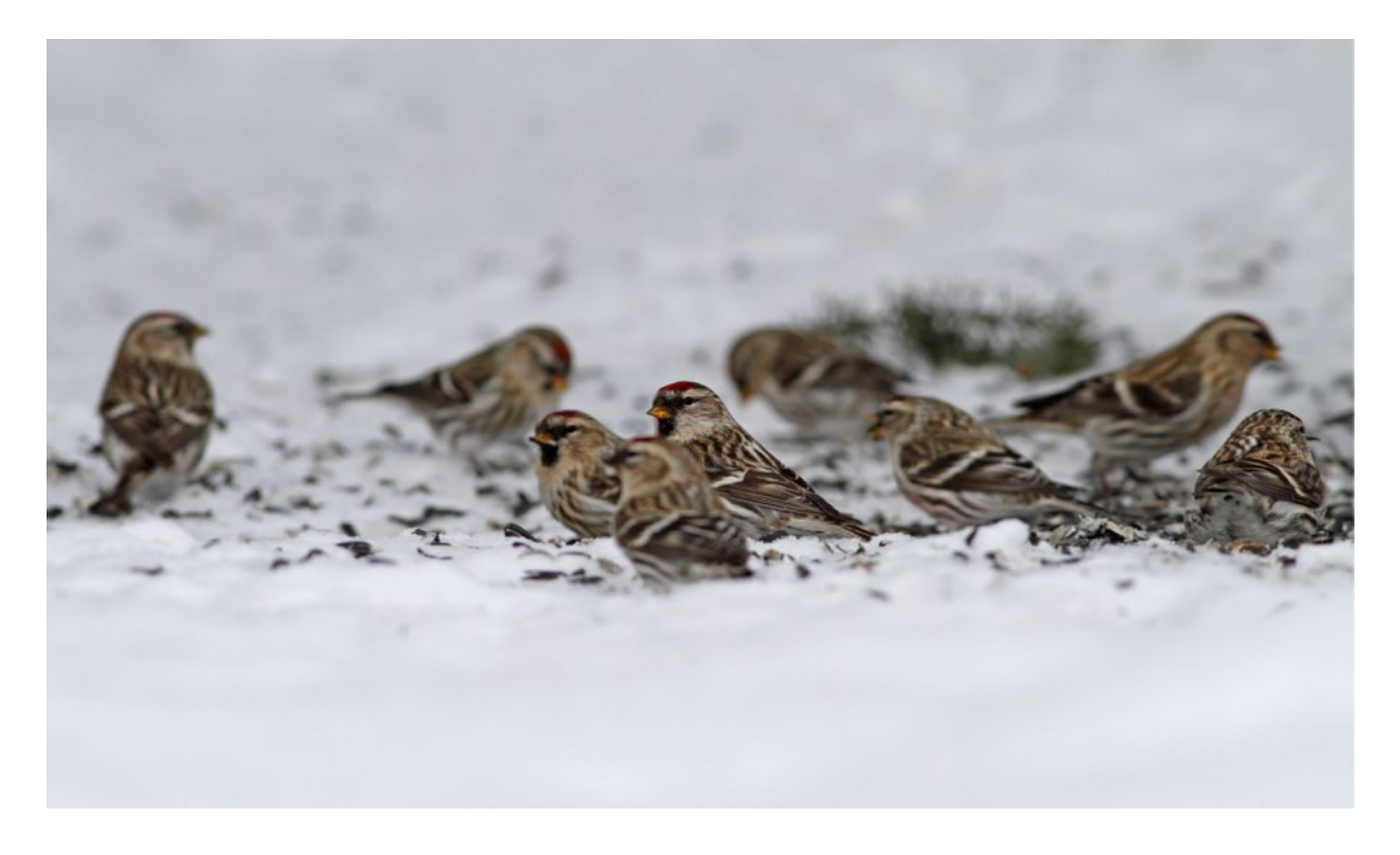
Common Redpolls were seen daily at feeding areas