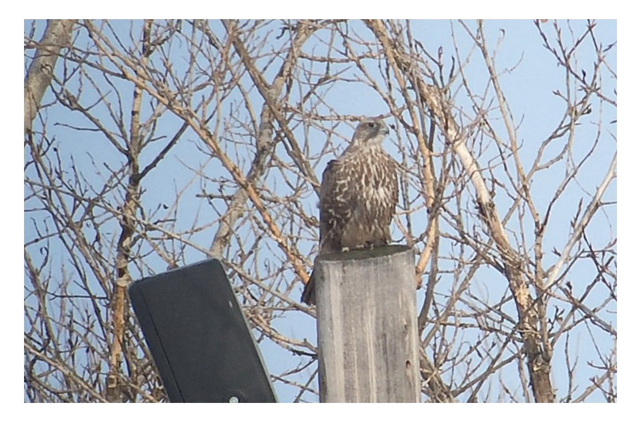
This immature Gyr Falcon showed well on our last day around Duluth