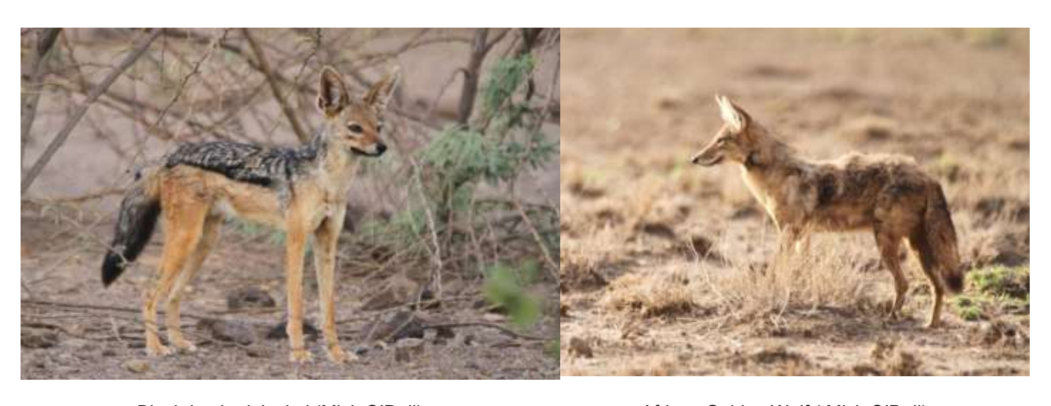
Black-backed Jackal (Mick O'Dell)