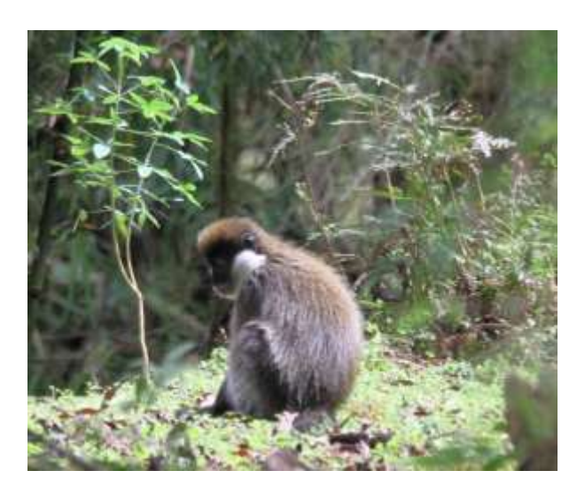
Bale Monkey (Mick O'Dell)