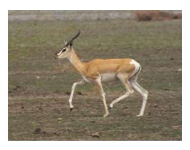
Soemmeering's Gazelle