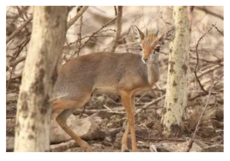
Harar Dik-dik