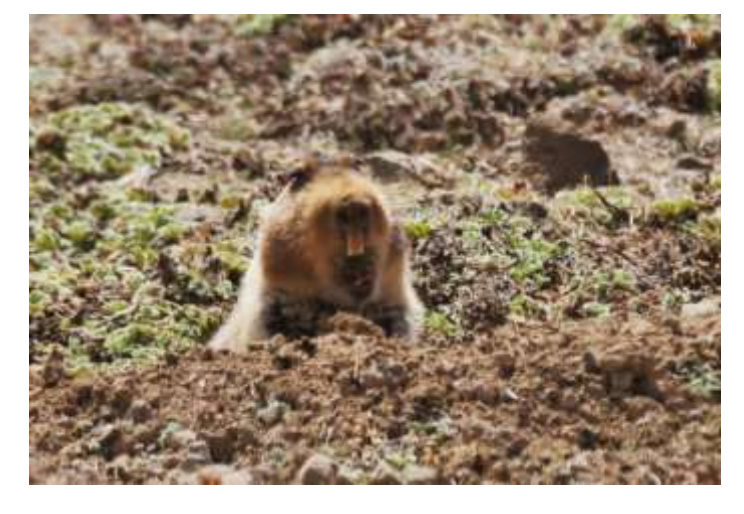
Blick's Grass Rat (Mick O'Dell)