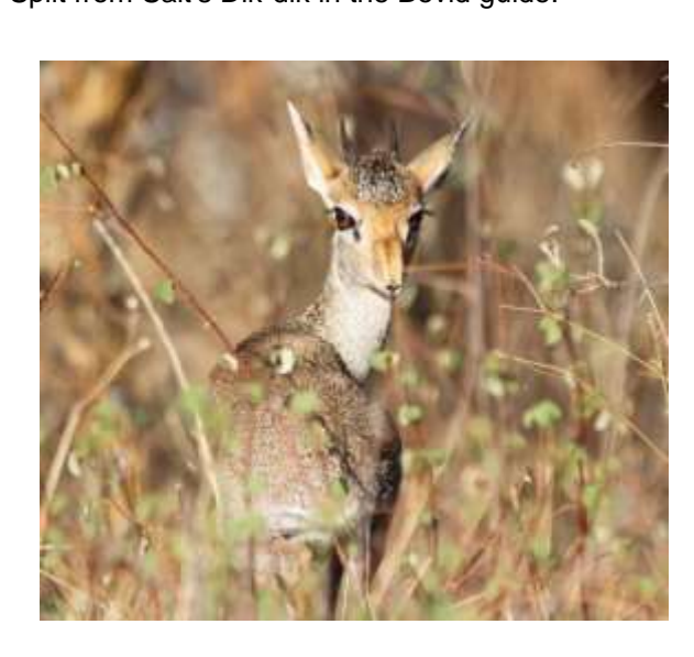
Gunther's Dik-dik