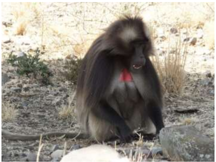
Gelada Baboons