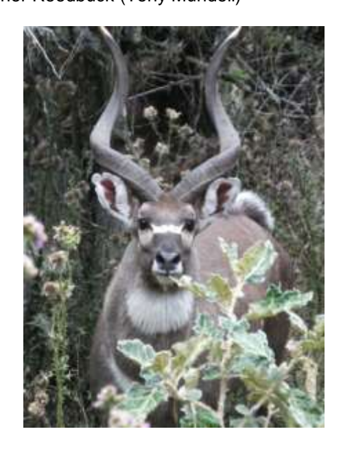
Mountain Nyala