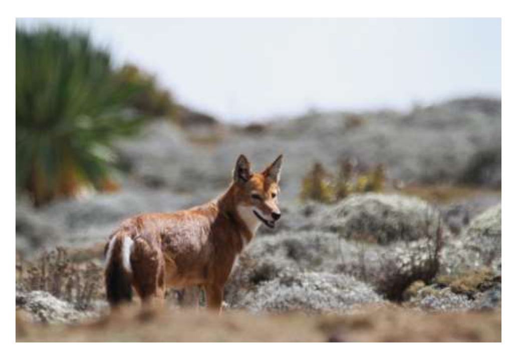
Ethiopian Wolf