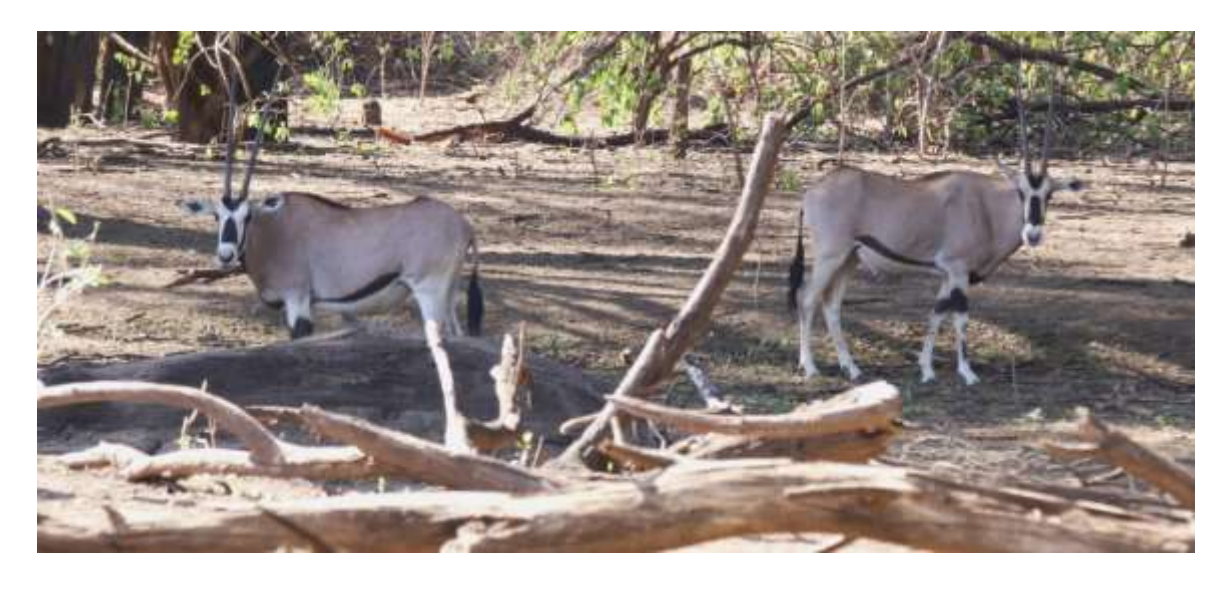
Beisa Oryx