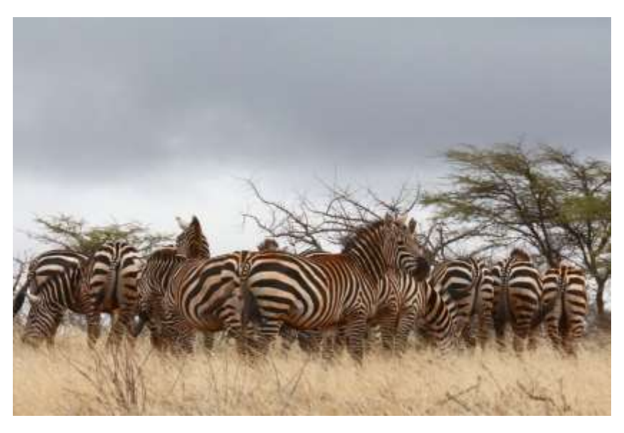
Burchell's Zebra (Caroline Simpson)