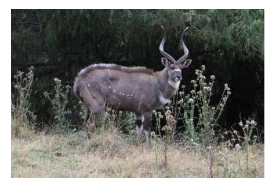
Mountain Nyala (Mick O'Dell)