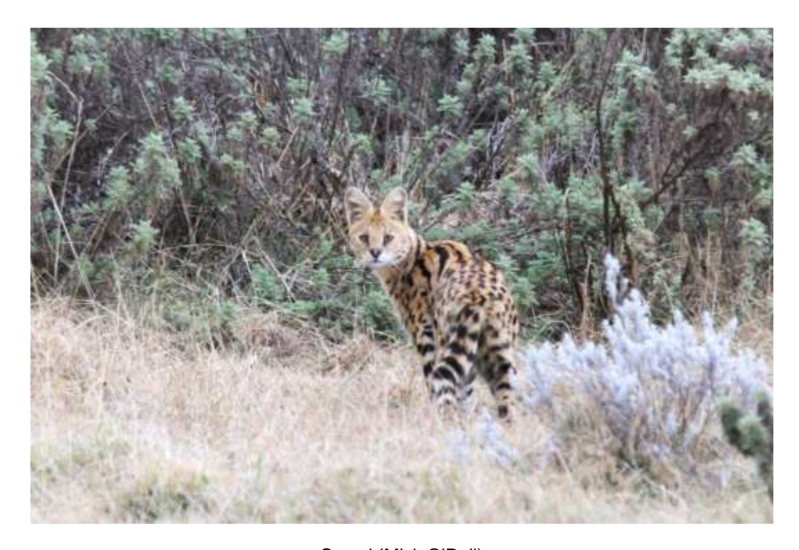
Serval (Mick O'Dell)