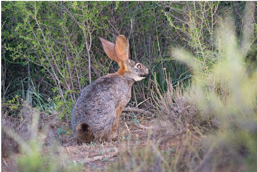
Riverine Rabbit at R2