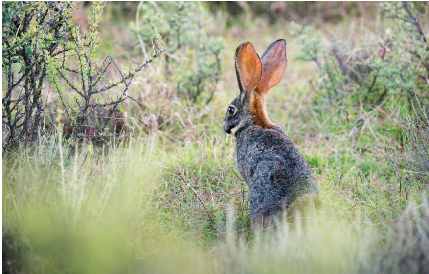
Riverine Rabbit at R1