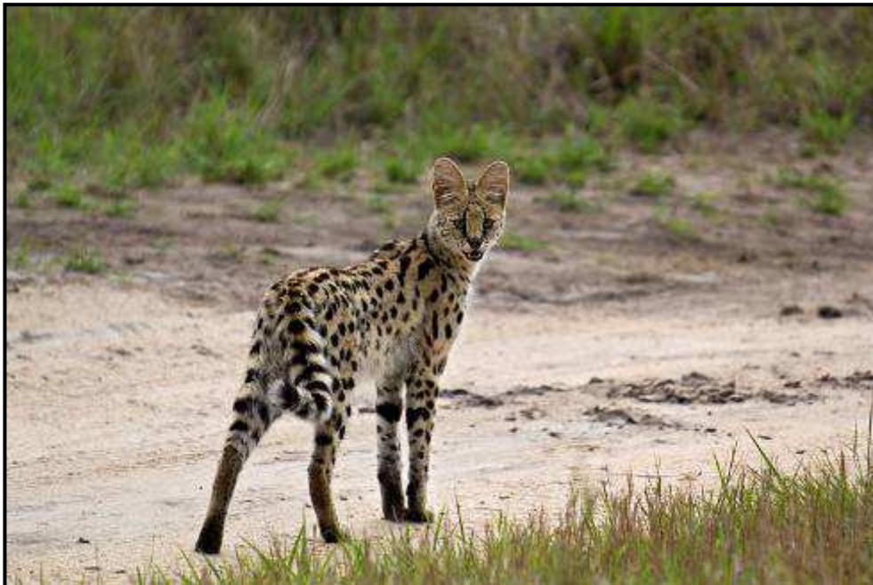
Above: Serval, seen on day 6.

To see more photographs from the 2011 Just Cats! tours visit our Flickr album: http://www.flickr.com/photos/leonmars/sets/72157628021091471/