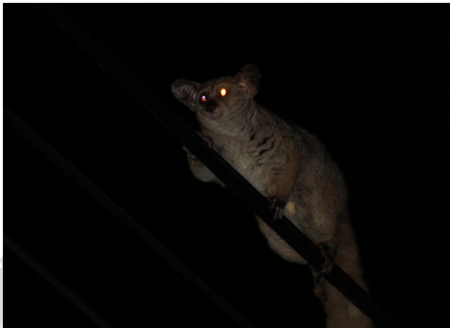
Galago de cola gruesa ( Otolemur crassicaudatus ) Greater galago. Satara rest camp. Kruger N.P.