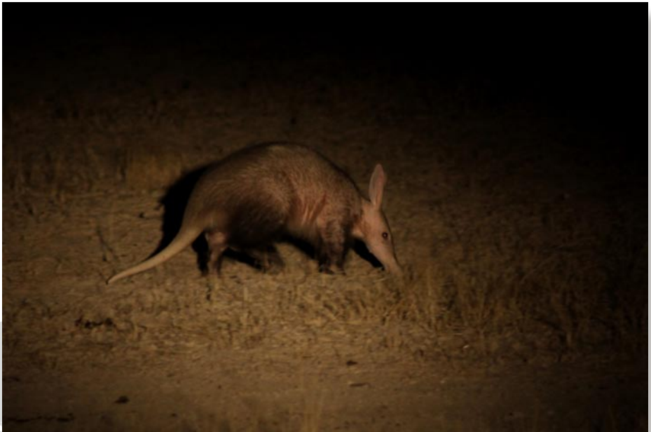
Cerdo hormiguero (Orycteropus afer) Aardvark