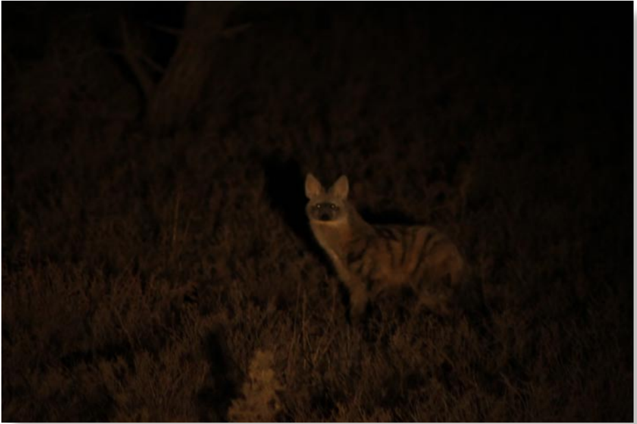
Proteles crestado (Proteles cristatus) Aardwolf . Marrick.