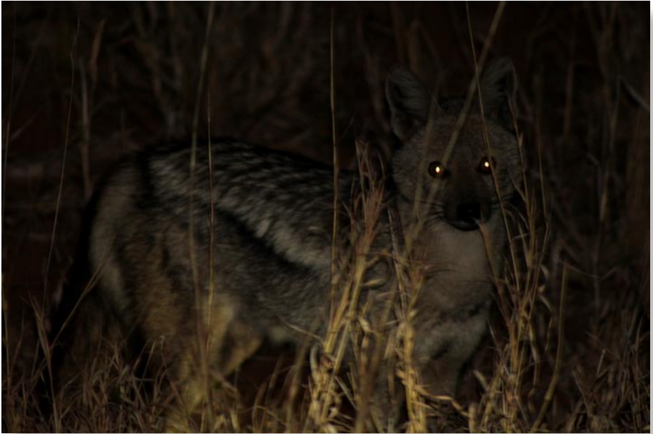
Chacal rayado (Canis adustus) Side-striped jackal. Letaba. Kruger N.P.