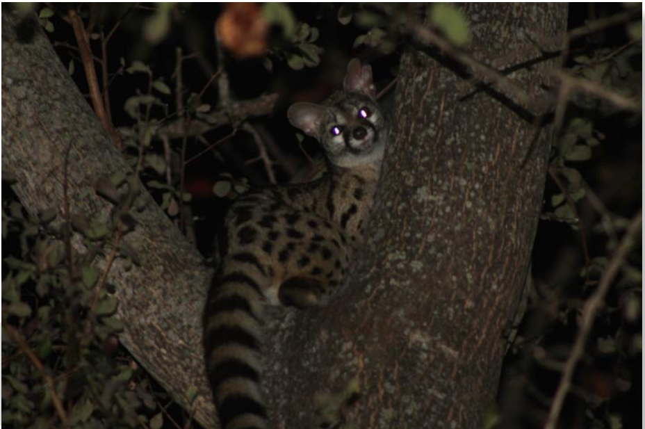
Gineta tigrina (Genetta tigrina) Large-spotted genet. Skukuza rest camp. Kruger N.P.