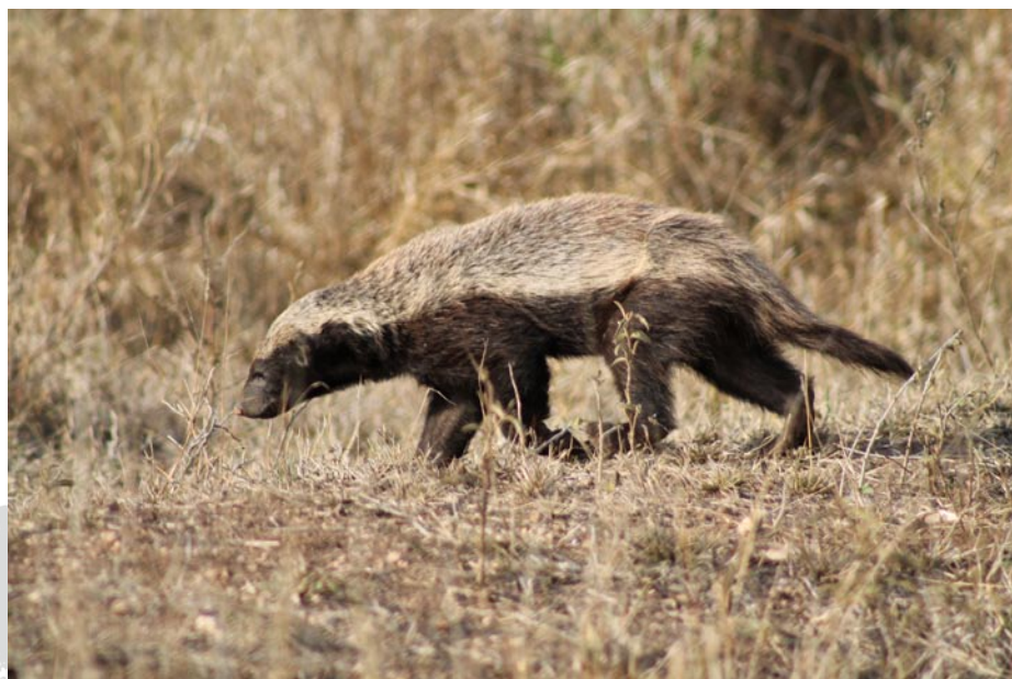
Ratel (Mellivora capensis) Honey badger. Satara. Kruger N.P.