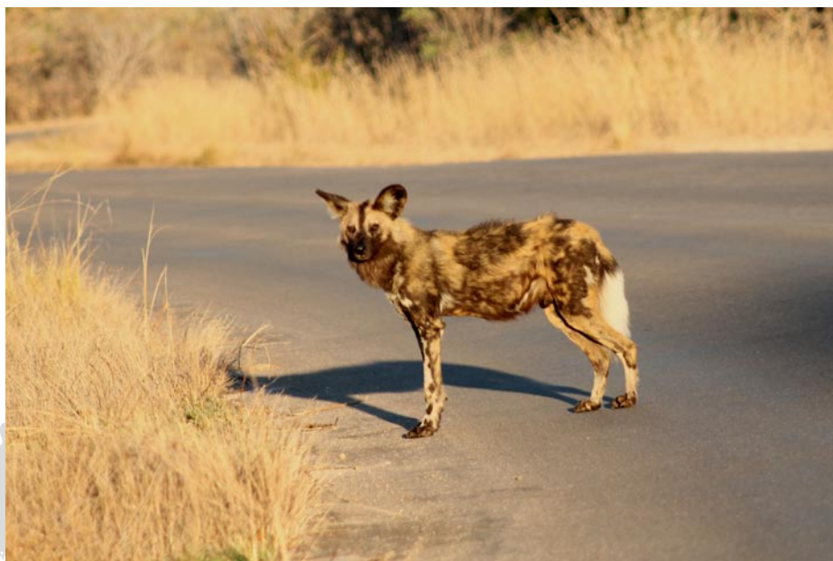
Licaón (Lycaon pictus) Wild dog. Pretoriuskop. Kruger N.P.