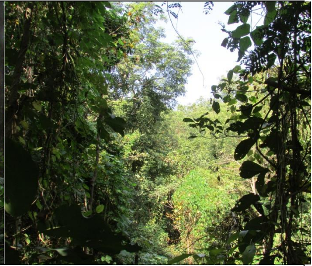
Closed canopy moist forest