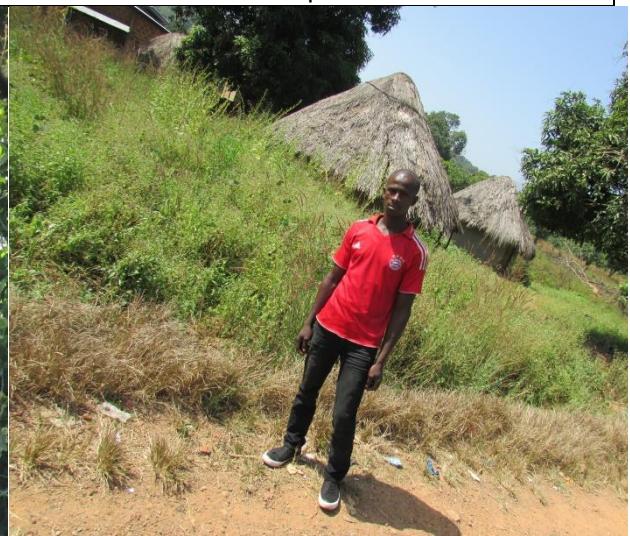
Village close to the forest