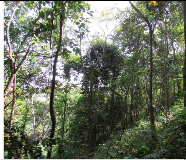
Open canopy dry forest