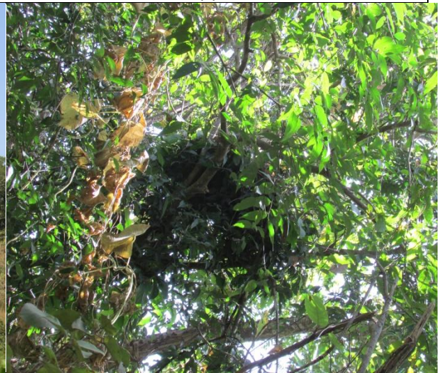
Western chimpanzee's nest