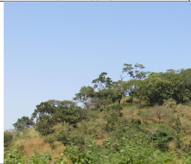
Hilltop wooded savanna